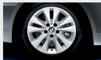
■ 17 x 7.5 Double Spoke (Styling 116) cast alloy wheels and 225/50R-17 all-season tires. (std. 545i; spare is a space-saver wheel and tire)