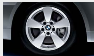
■ 17 x 7.5 Star Spoke (Styling 138) cast alloy wheels and 225/50R-17 all-season tires. (std. 530i; spare is a space-saver wheel and tire)