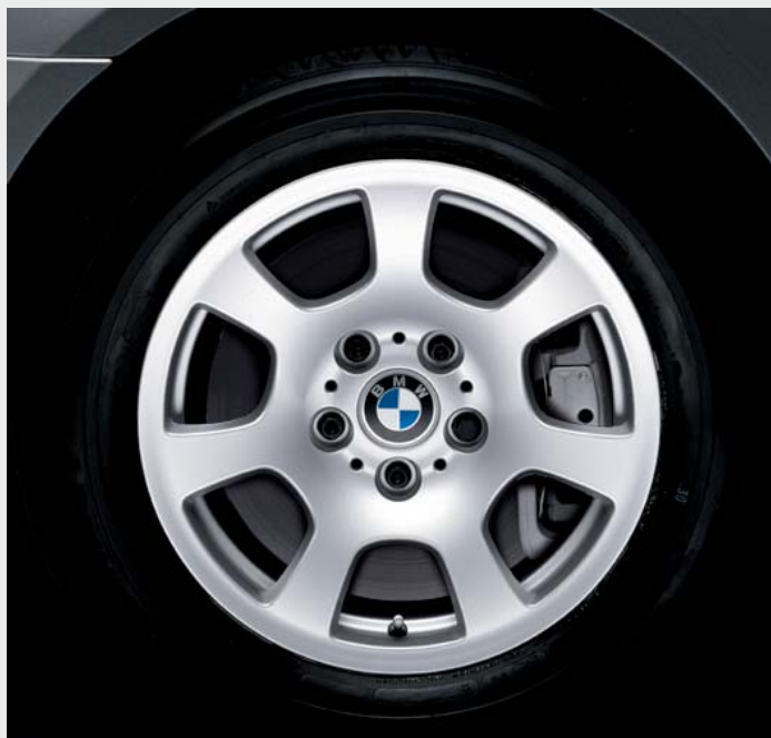
■ 16 x 7.0 Trapezoid (Styling 134) cast alloy wheels and 225/55R-16 all-season tires. (std. 525i; spare is a space-saver wheel and tire)