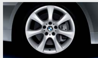
18 x 8.0 front, 18 x 9.0 rear Star Spoke (Styling 124) cast alloy wheels and 245/40R-18 front, 275/35R-18 rear run-flat performance tires. 1 (std. 545i 6-speed; included in 545i Sport Package; tires not recommended for winter use in ice and snow. Spare is a space-saver wheel and tire)