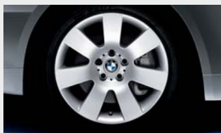
18 x 8.0 Star Spoke (Styling 123) cast alloy wheels and 245/40R-18 run-flat performance tires. 1 (included in 530i Sport Package; tires not recommended for winter use in ice and snow. Spare is a space-saver wheel and tire)