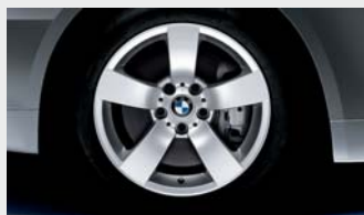
17 x 8.0 Star Spoke (Styling 122) cast alloy wheels and 245/45R-17 run-flat performance tires. 1 (included in 525i Sport Package; tires not recommended for winter use in ice and snow. Spare is a space-saver wheel and tire)