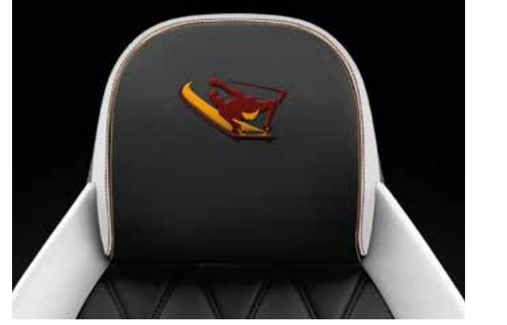
Personalised seat embroidery