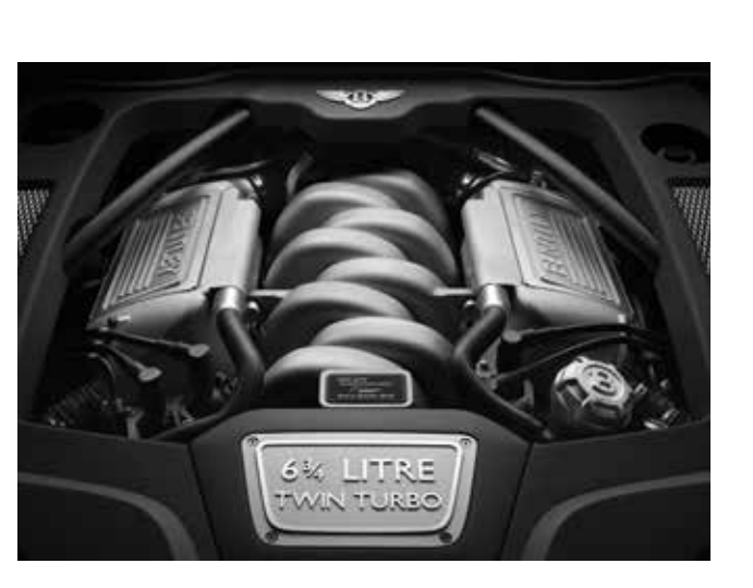
Both the Mulsanne and the Mulsanne Speed feature the re-calibrated V8 engine, with 13% efficiency improvement, and it delivers 50 miles (80 km) greater range.

With this enhanced efficiency and increased performance, the Mulsanne Speed is a significant evolution: power with true potential.