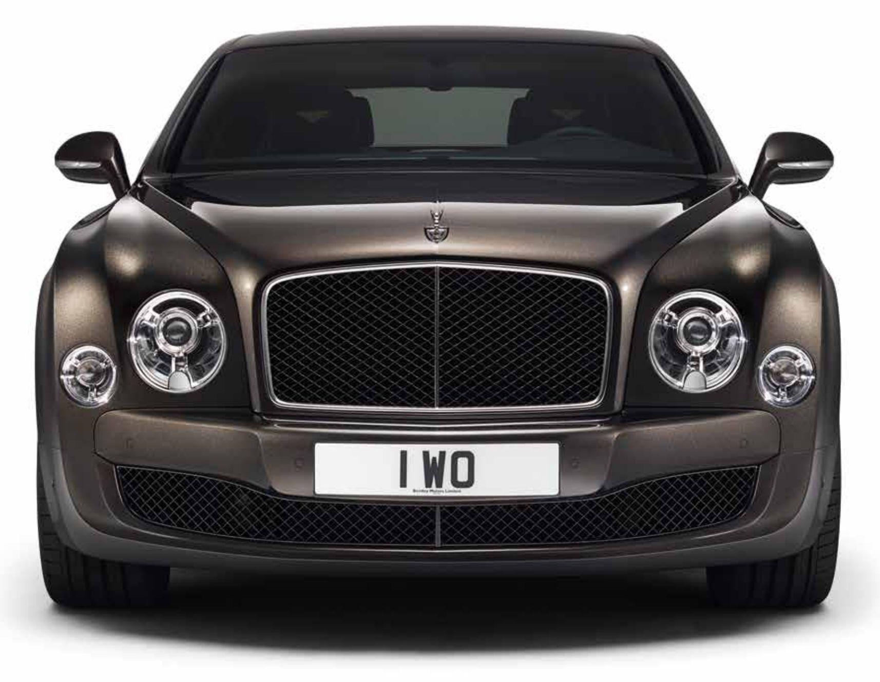
A dark tint to the brightware gives the new Mulsanne Speed a presence that commands attention.