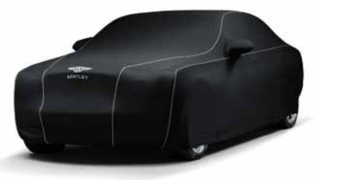
Personalised car cover

To find out more, please contact your local Bentley dealer.