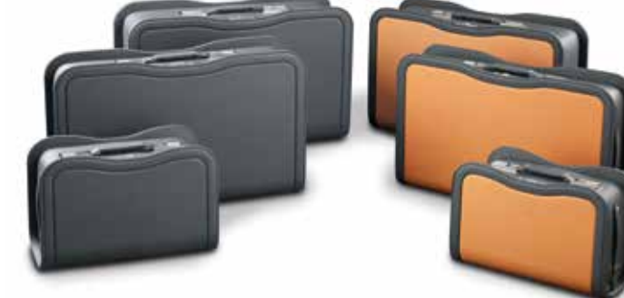
Mulsanne fitted luggage set