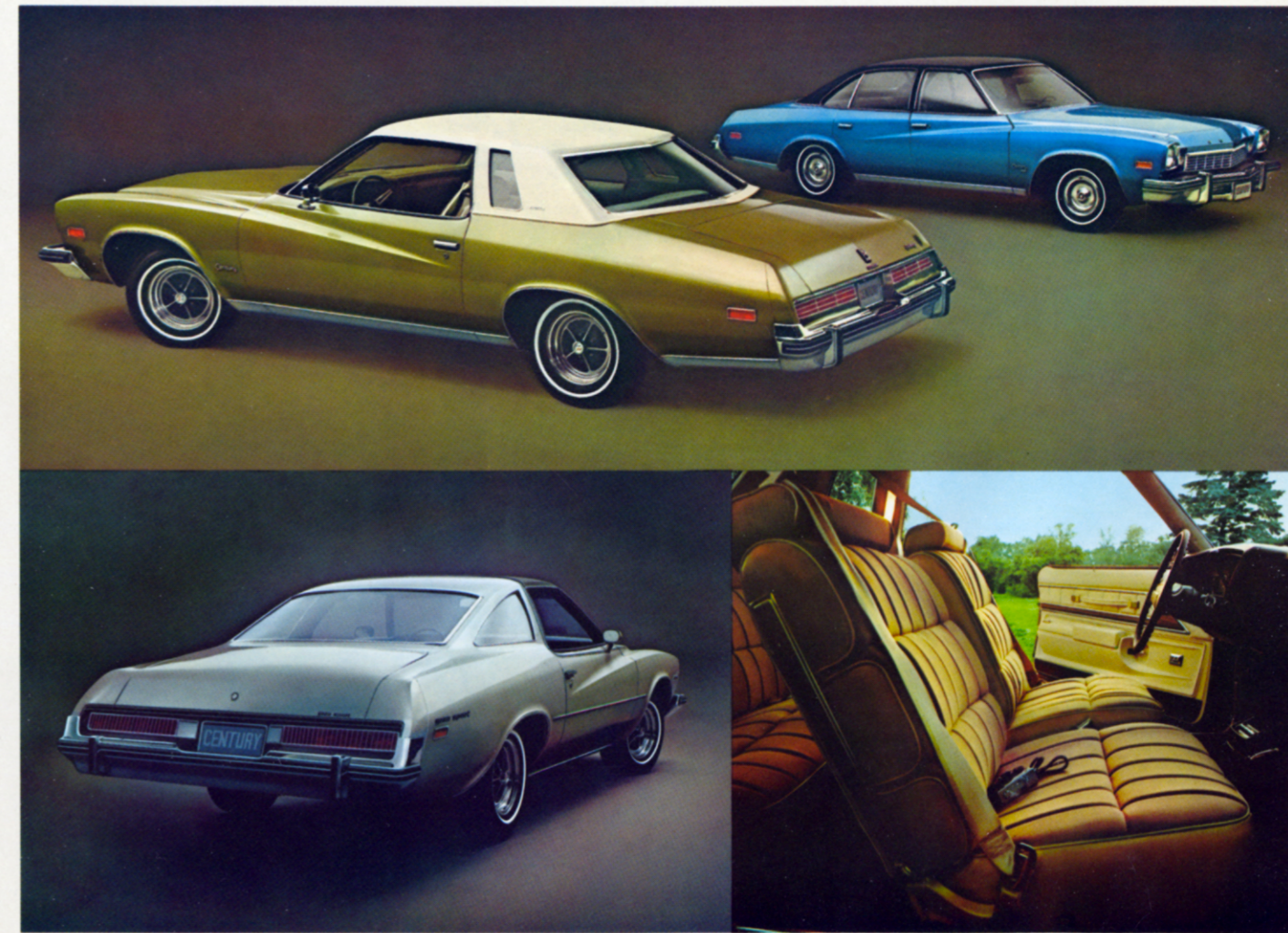
Gran Sport Colonnade Hardtop Coupe at bottom