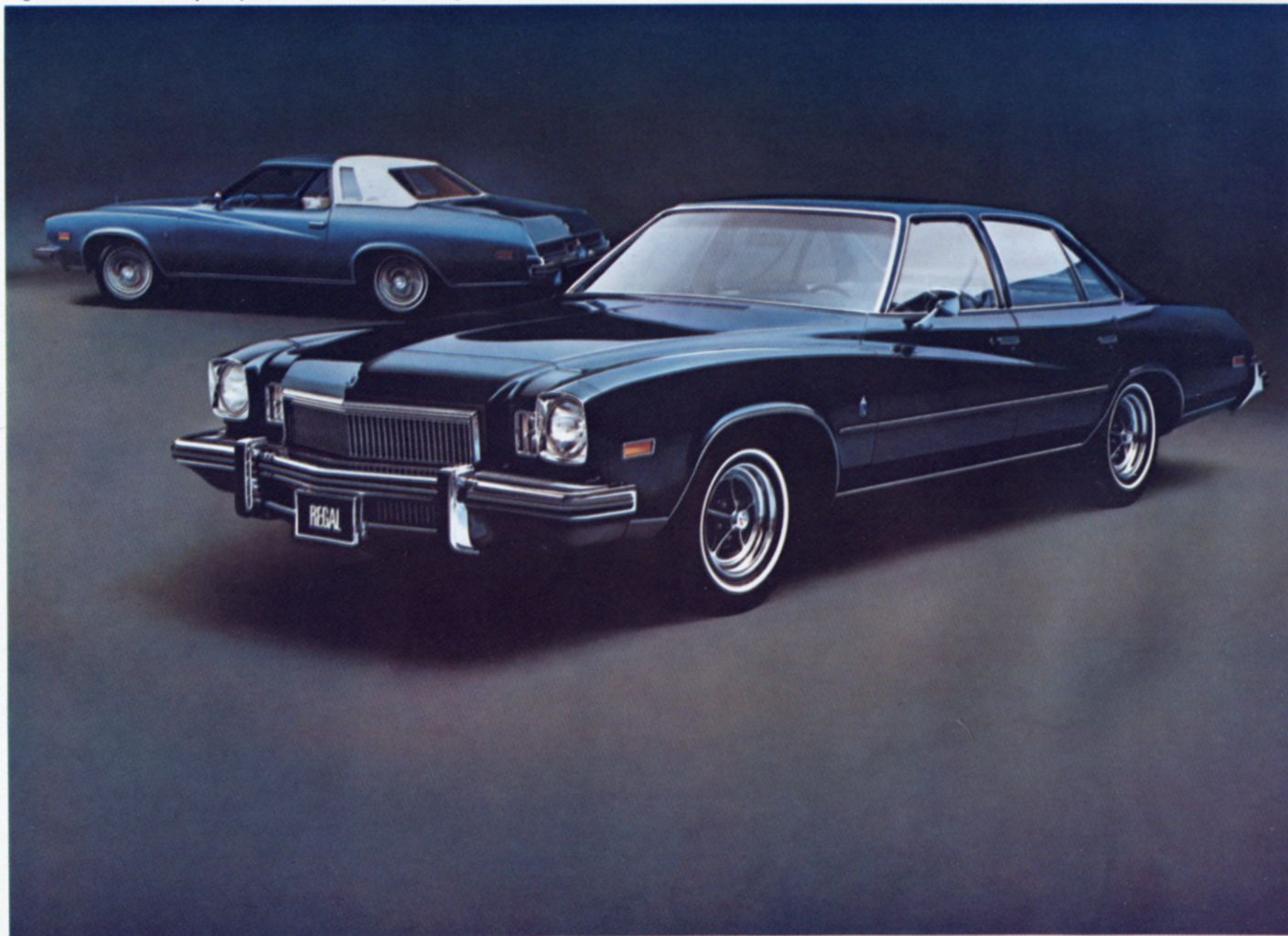
Regal Colonnade Hardtop Coupe with Landau top and Regal Colonnade Hardtop Sedan