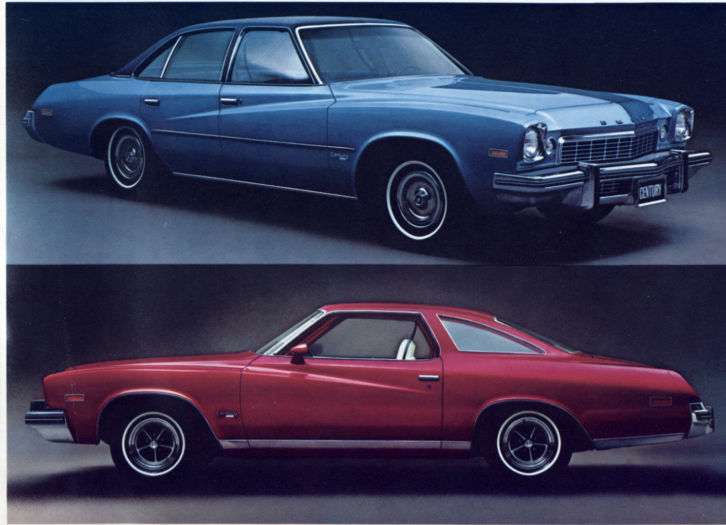
Century 350 Colonnade Hardtop Sedan and Coupe