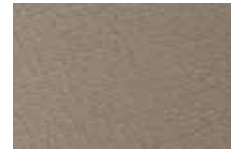
Shale Perforated Leather-Appointed Seating 6