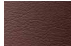
Chestnut Perforated Leather-Appointed Seating 7