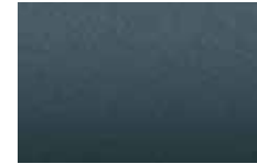
Dark Slate Metallic 2,3