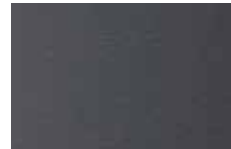
Dark Galvanized Cloth 5 or Perforated Leather-Appointed Seating 6

INTERIOR Ebony accents included with all interior colors. Leather-appointed seating first and second rows only.