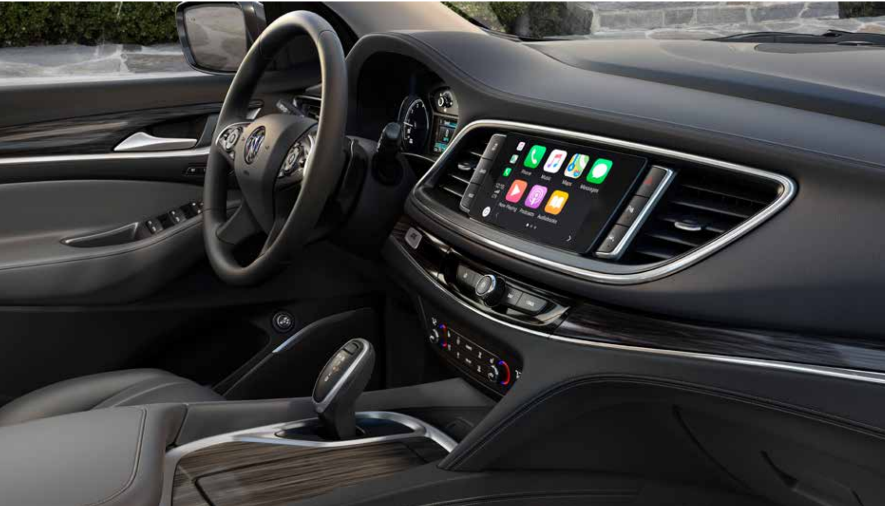
Enclave Premium interior shown in Dark Galvanized with Ebony accents and available features. Apple CarPlay™ shown on infotainment screen.