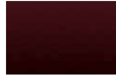
Rich Garnet Metallic 2,4