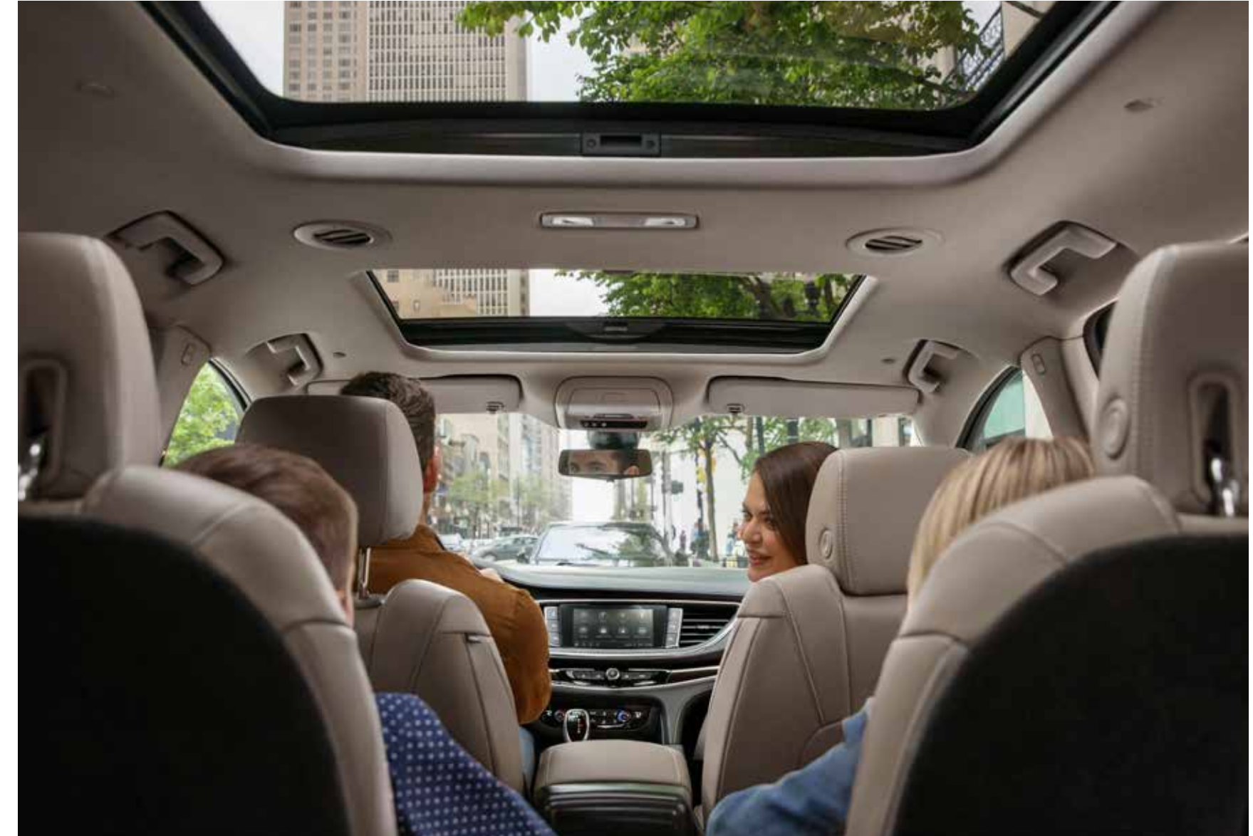
Enclave Premium interior shown in Shale with Ebony accents and available features.