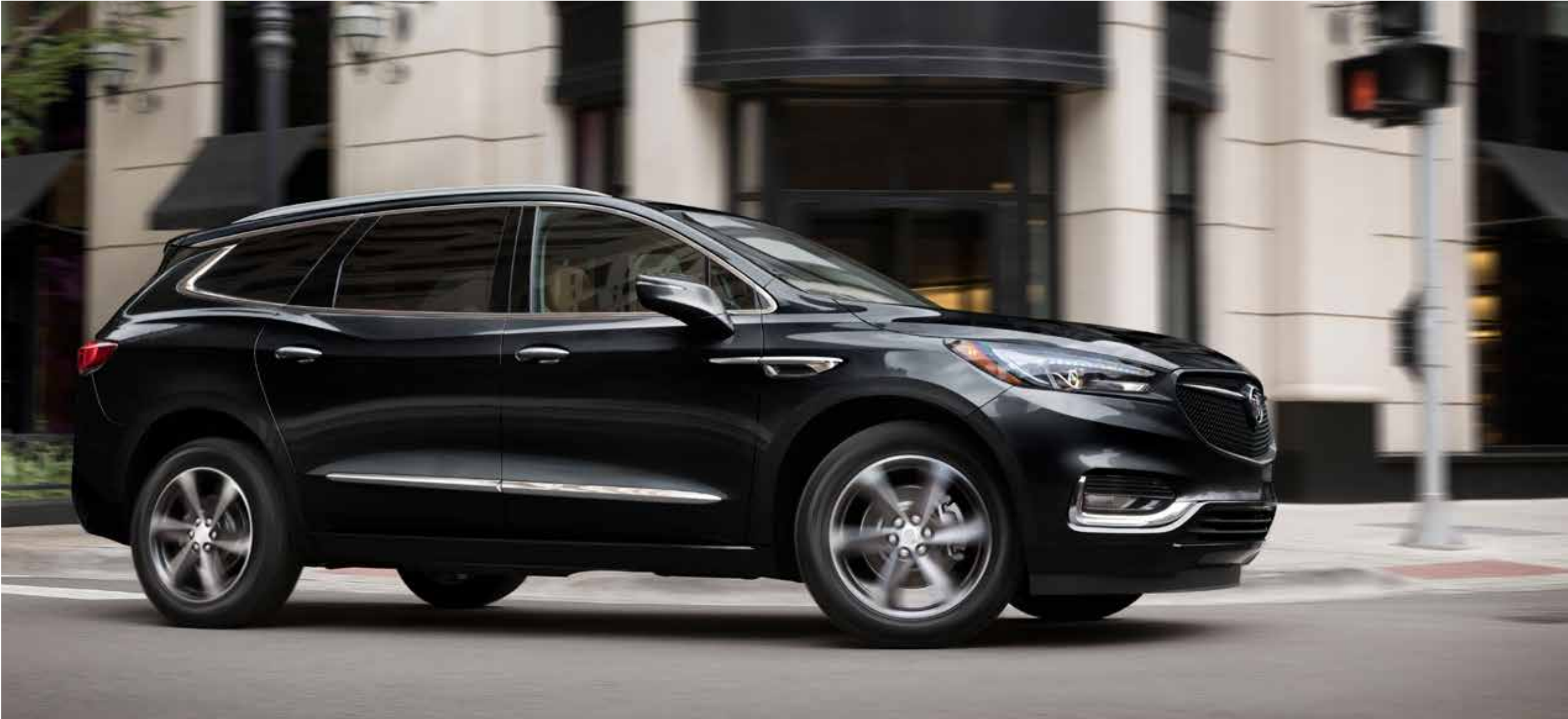
Enclave Essence shown in Ebony Twilight Metallic with available Sport Touring Package.