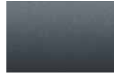
Satin Steel Metallic 2,3