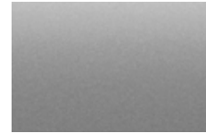
Quicksilver Metallic 1,2