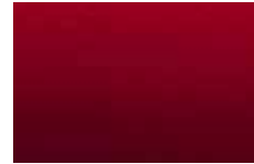
Red Quartz Tintcoat 1,2