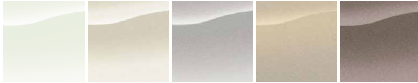
Summit White White Diamond Tricoat 1 Quicksilver Metallic Gold Mist Metallic Mocha Steel Metallic