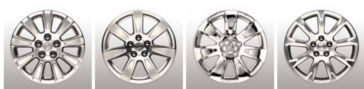
Q05 17" machined alloy PW2 18" machine-faced alloy, painted Q52 18" chrome Q70 19" 9-spoke painted, machined alloy