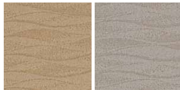
Cashmere Cloth Titanium Cloth