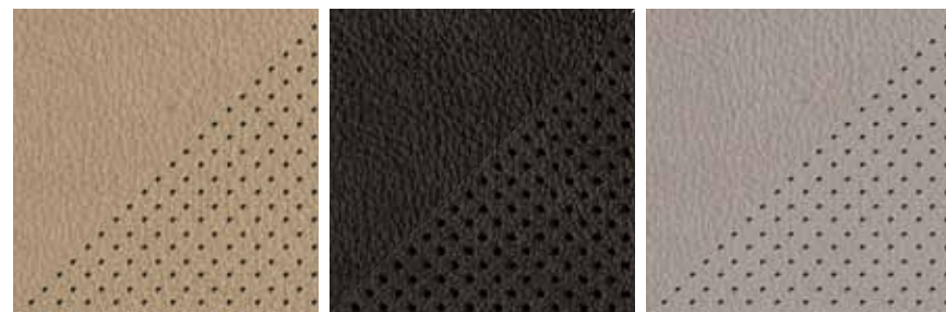
Cashmere leather-appointed seating Ebony leather-appointed seating Titanium leather-appointed seating