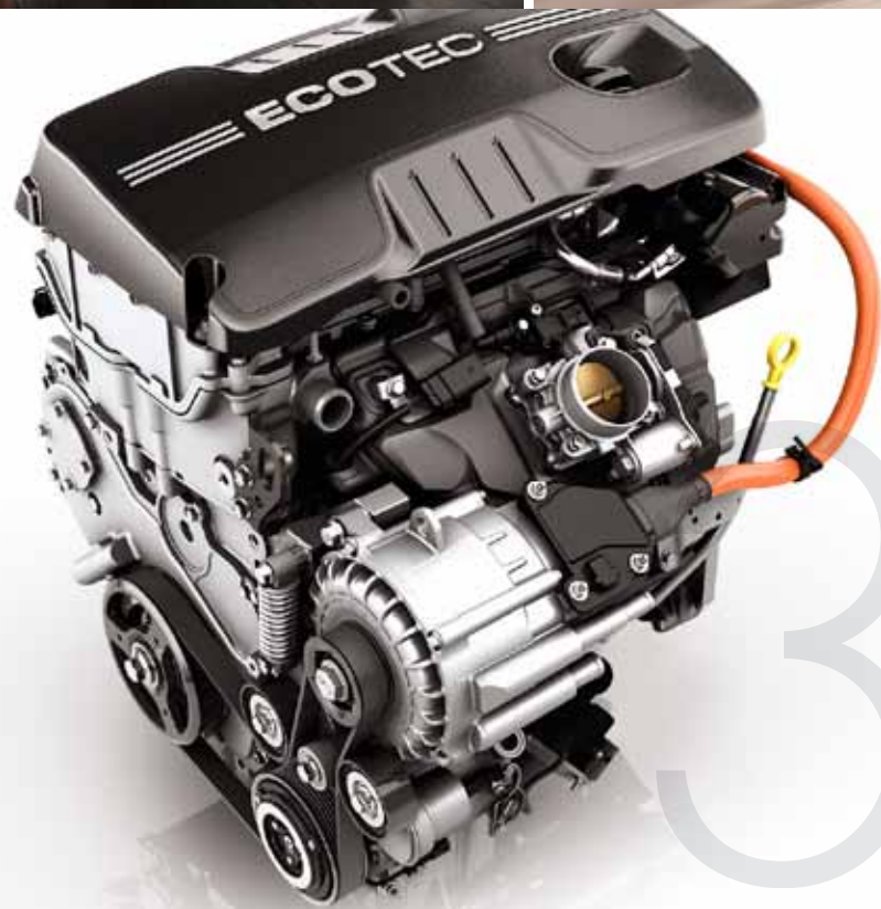
THE ECOTEC ENGINE WITH eASSIST TECHNOLOGY ACHIEVES A CLASS-LEADING 25 CITY AND 36 HIGHWAY MPG. 1