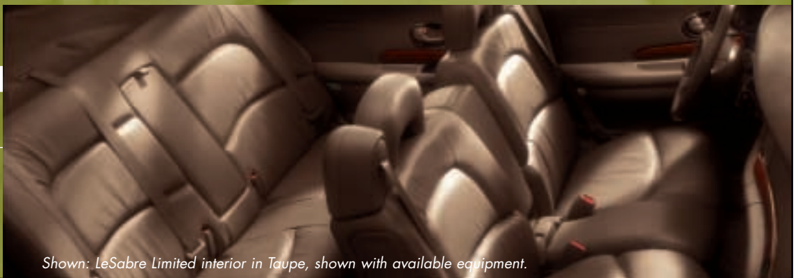
Shown: LeSabre Limited interior in Taupe, shown with available equipment.