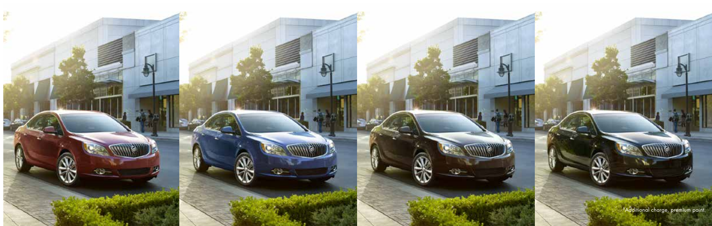
1 Additional charge, premium paint.