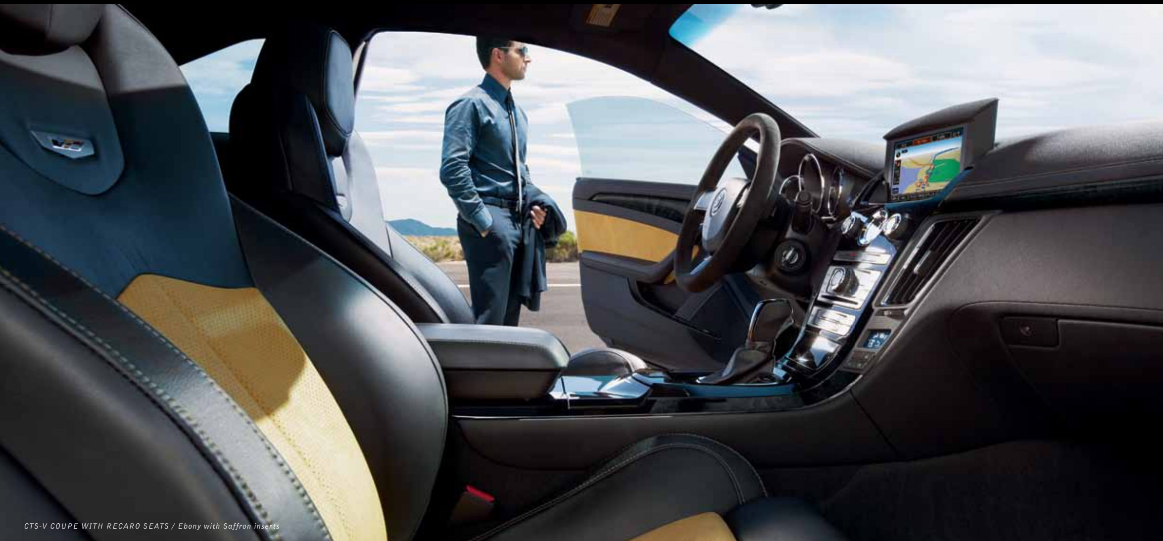
CTS-V COUPE WITH RECARO SEATS / Ebony with Saffron inserts