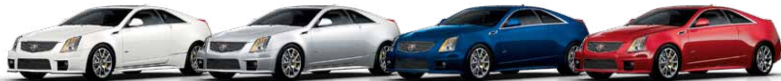
WHITE DIAMOND TRICOAT RADIANT SILVER METALLIC OPULENT BLUE METALLIC CRYSTAL RED TINTCOAT