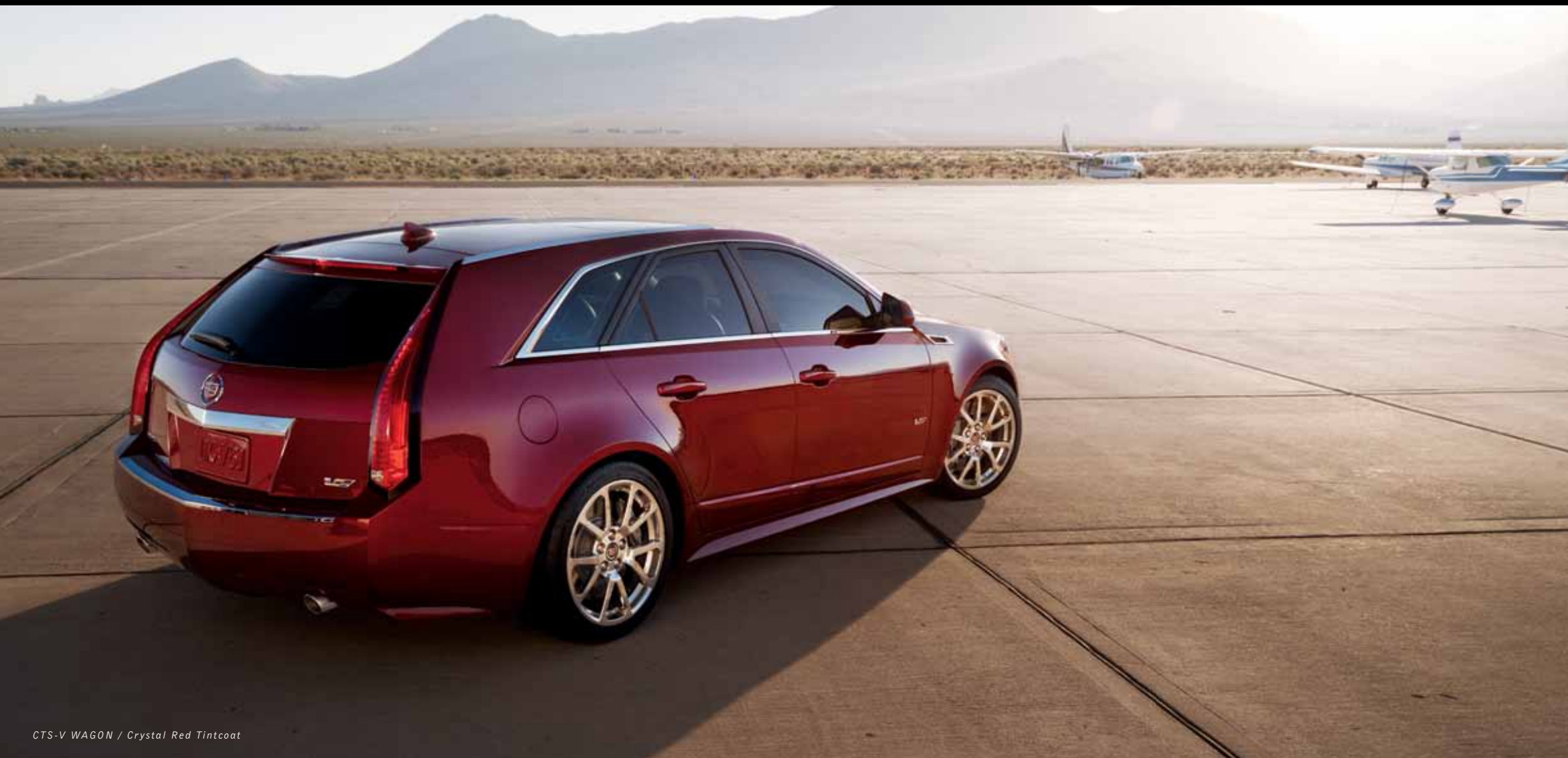
CTS-V WAGON / Crystal Red Tintcoat