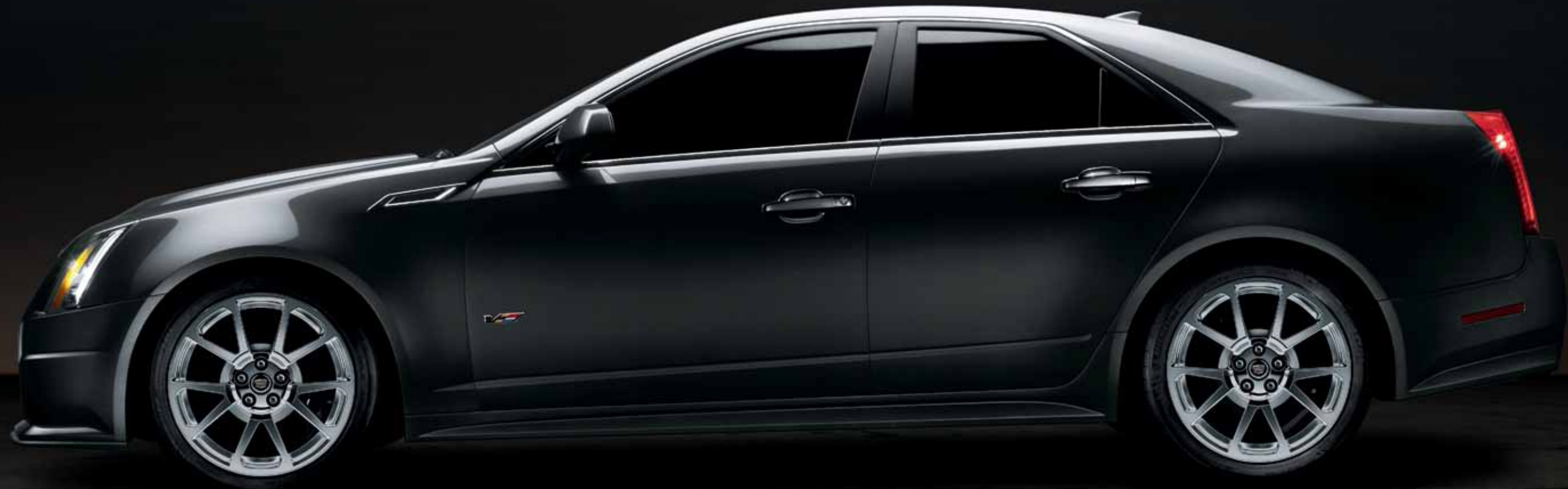
CTS-V SEDAN / Thunder Gray ChromaFlair®

From its boldly chiseled shape down to every exacting detail, the exterior of the CTS-V Sedan was designed to purposefully enhance performance. Its chassis is lower by 10 mm in front and 16 mm in the rear compared to the CTS Sport Sedan to minimize air flowing underneath. Up front, the bold fascia was designed with an integrated splitter to improve aerodynamics, while vented ducts force-feed plenty of cooling air to the Brembo® high-performance brakes. Even the 10-spoke 19" aluminum alloy wheels are forged for lighter weight, proving that the CTS-V is driven by much more than just the potent engine lurking under the hood.