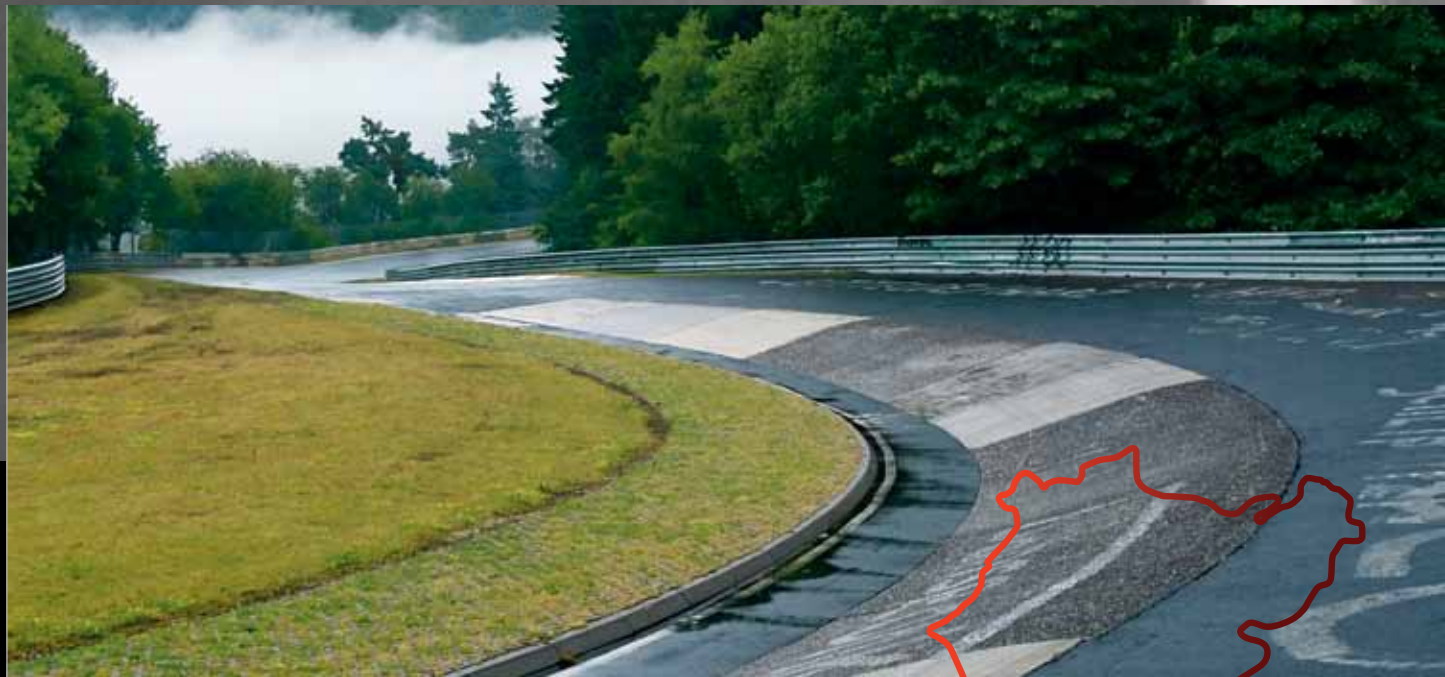
NÜRBURGRING'S FAMED KARUSSELL CORNER