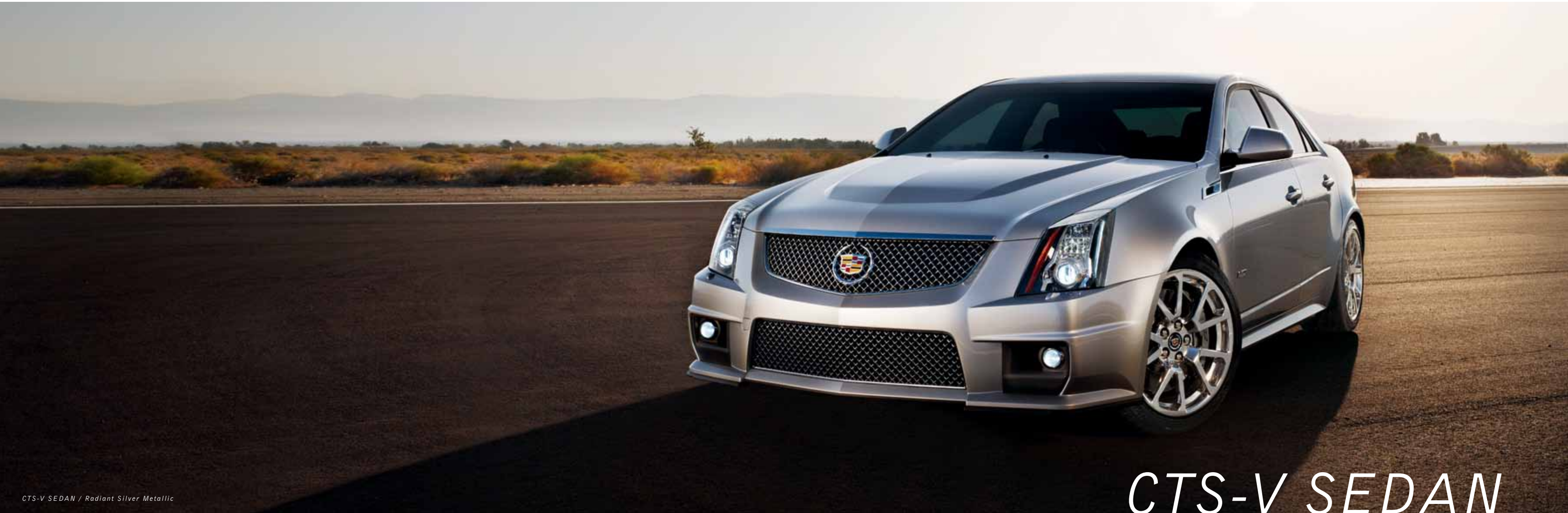
CTS-V SEDAN / Radiant Silver Metallic