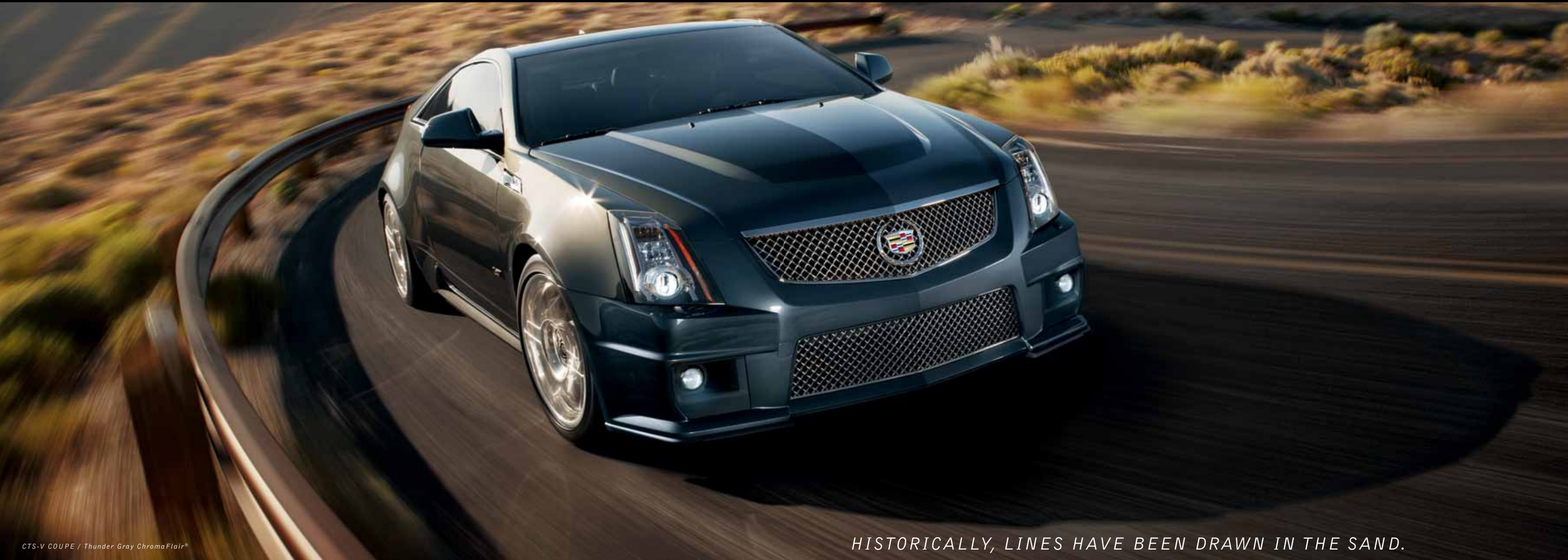
CTS-V COUPE / Thunder Gray ChromaFlair®

HISTORICALLY, LINES HAVE BEEN DRAWN IN THE SAND. AND, OCCASIONALLY, IN THE ASPHALT.