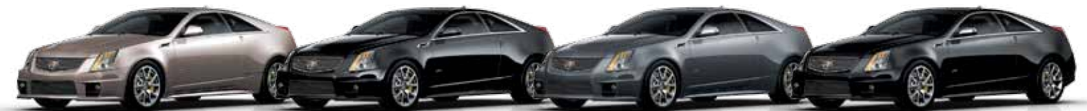
MOCHA STEEL METALLIC BLACK RAVEN THUNDER GRAY CHROMAFLAIR® BLACK DIAMOND TRICOAT