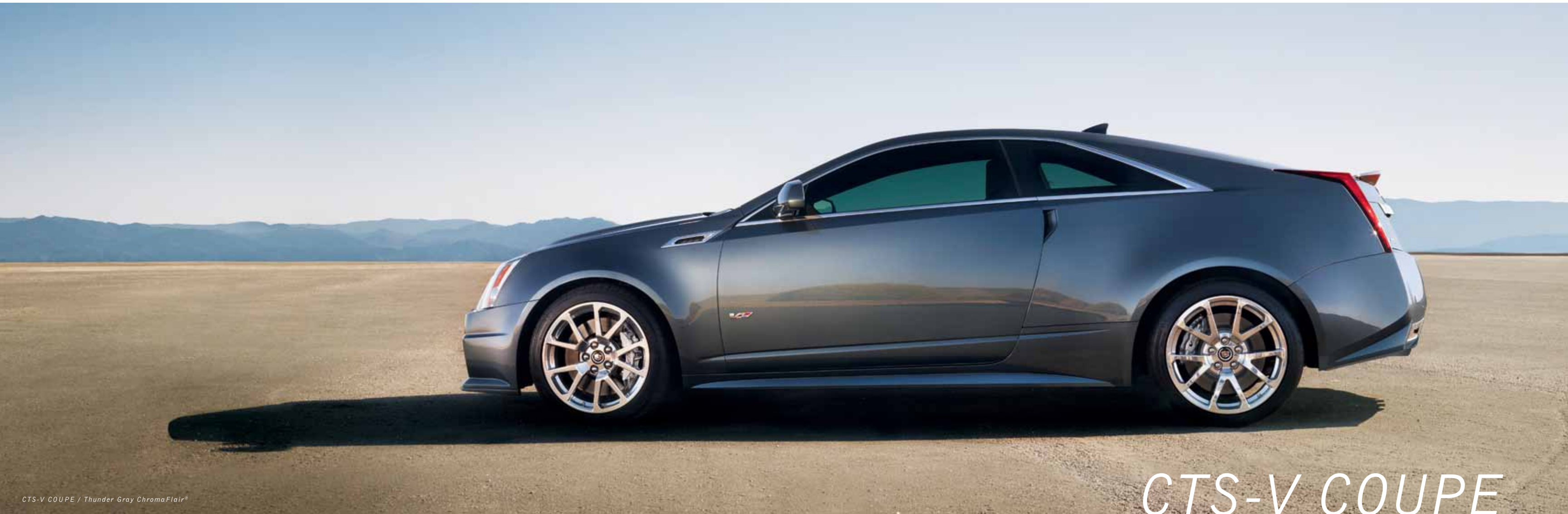
CTS-V COUPE / Thunder Gray ChromaFlair®