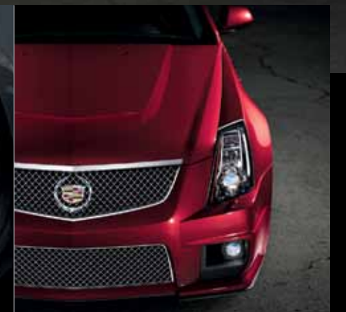
CTS-V POWER DOME HOOD