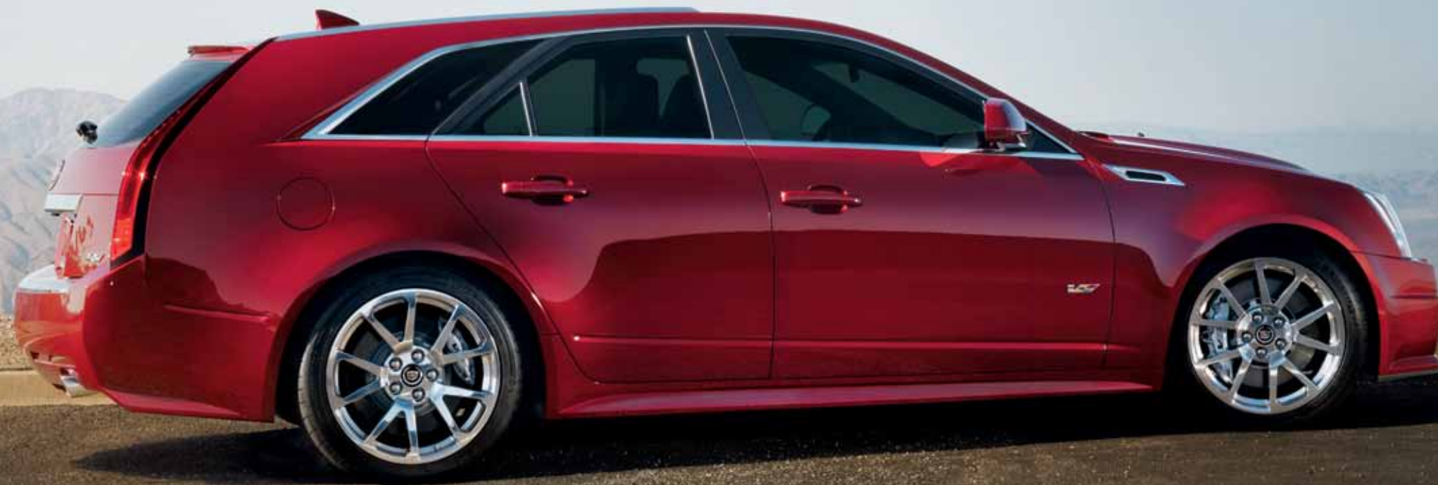
CTS-V WAGON / Crystal Red Tintcoat