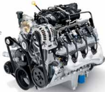
Vortec 5.3L V8

Kick it up a notch. The available Vortec 5.3L V8 engine cranks out a seat-clenching 300 horsepower. And with an EPA estimated 20 MPG highway on 2WD models, this engine offers better highway fuel economy than Dodge Dakota V8 7