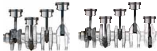
Vortec 2.9L I-4 engine