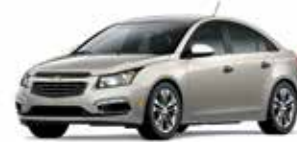
CHAMPAGNE SILVER METALLIC 3