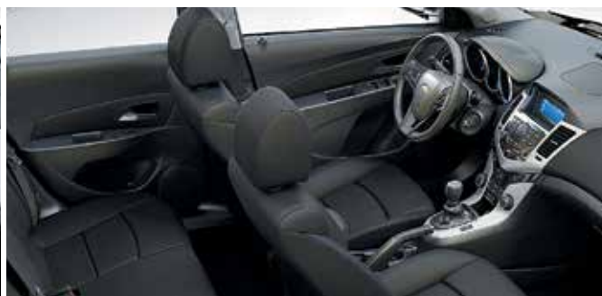
Jet Black Premium Cloth 3