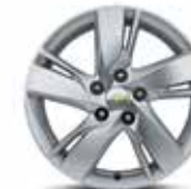
17" Aluminum (Standard on Diesel)