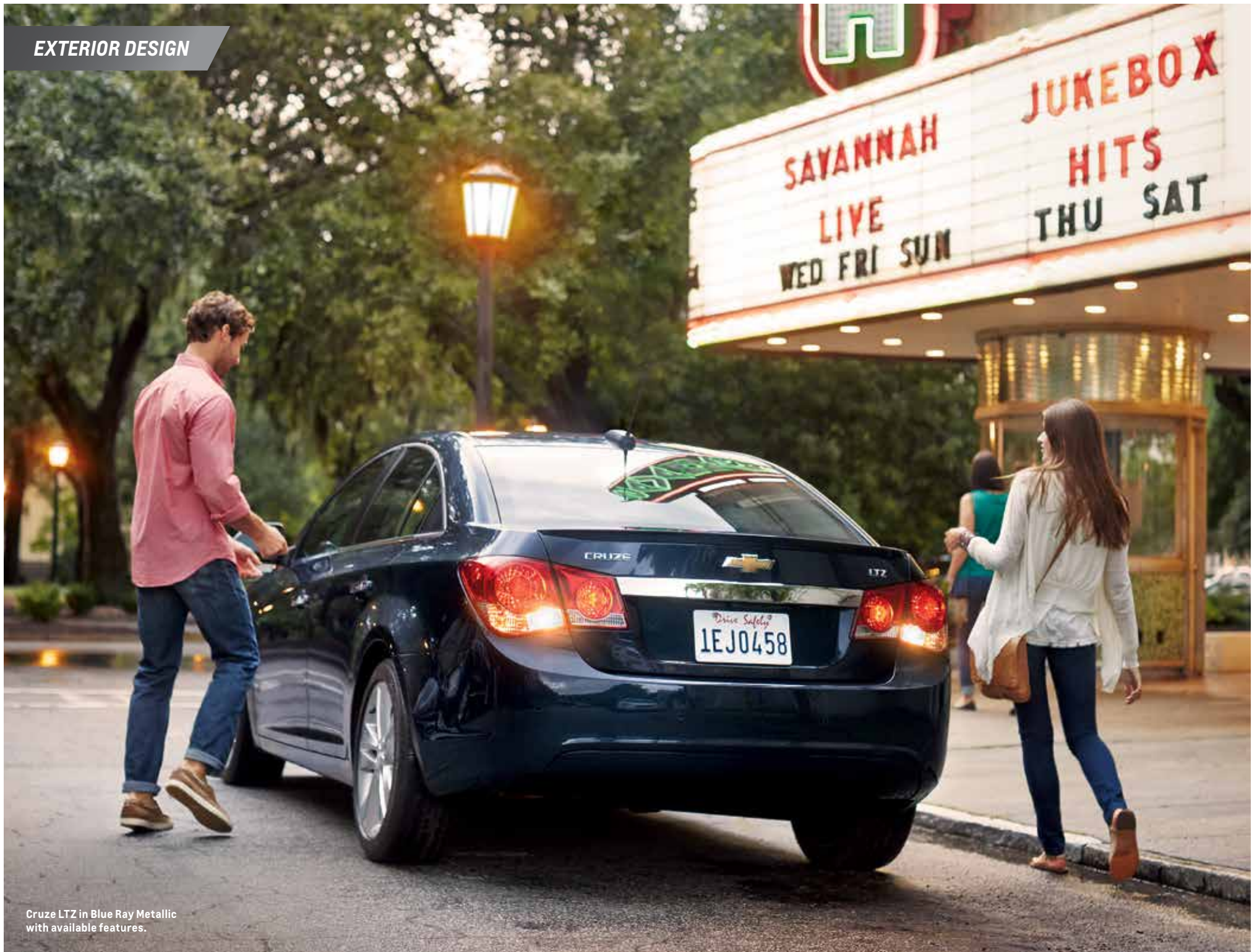
Cruze LTZ in Blue Ray Metallic with available features.