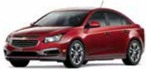
SIREN RED TINTCOAT 1,3,4