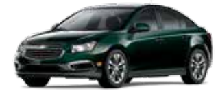
RAINFORREST GREEN METALLIC 1,3