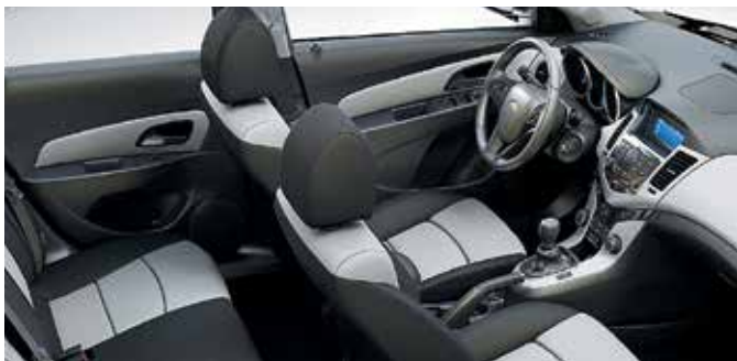
Jet Black/Medium Titanium-Color Premium Cloth 1