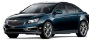
BLUE RAY METALLIC 2