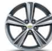
17" 5-Spoke Flangeless Aluminum (Standard on 2LT)