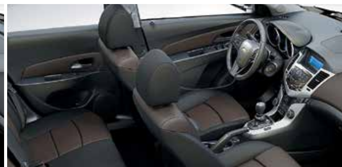
Brownstone Cloth 3,4