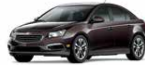
AUTUMN BRONZE METALLIC 1,3,4