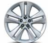
18" Split 5-Spoke Flangeless Silver-Painted Alloy (Standard on LTZ)