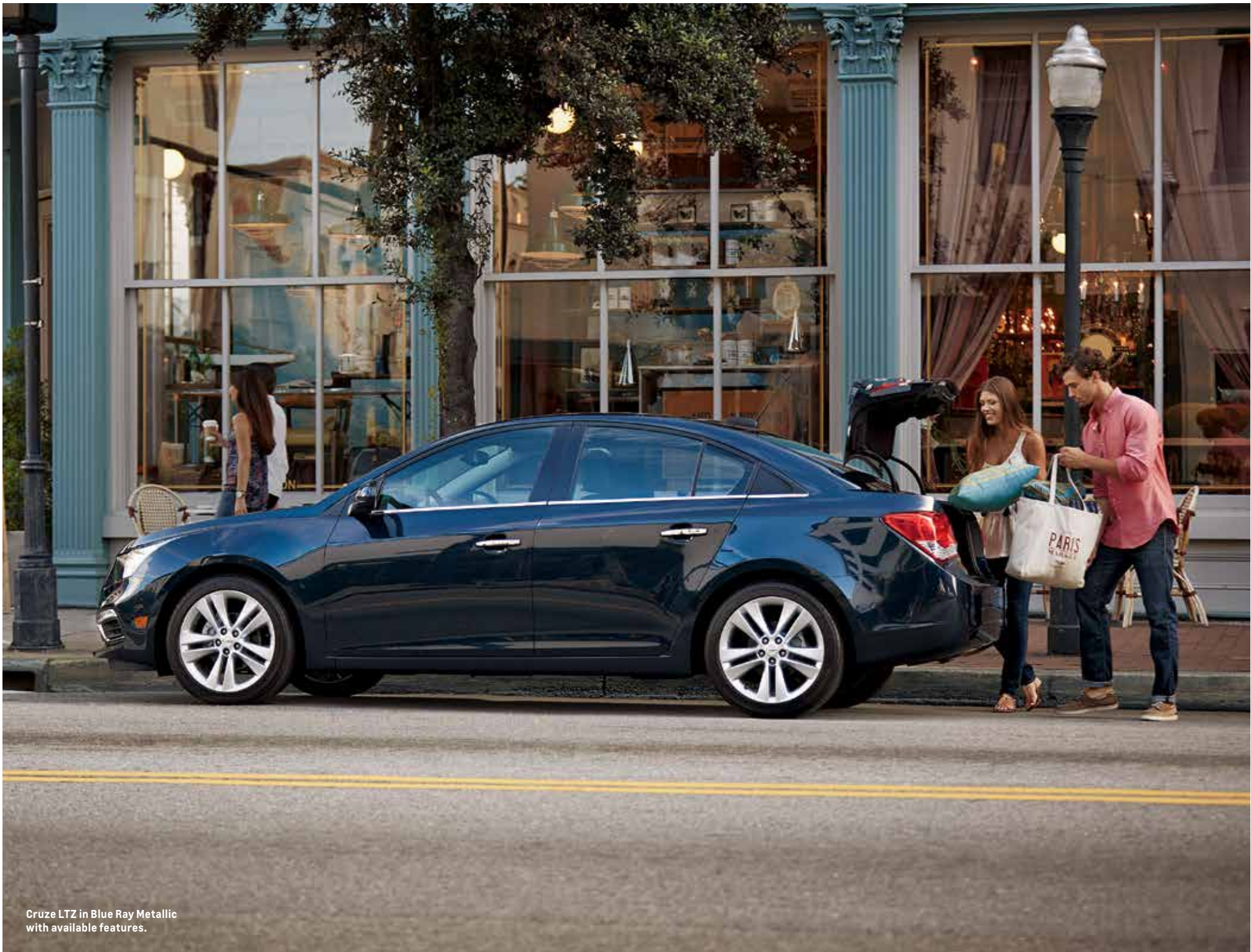
Cruze LTZ in Blue Ray Metallic with available features.