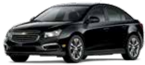
BLACK GRANITE METALLIC 1