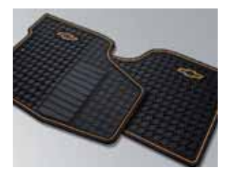
All-weather front floor mats