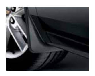
Molded front splash guards