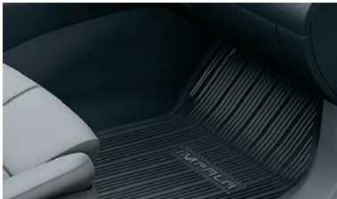
All-Weather Floor Mats

PERSONALIZE YOUR IMPALA AT CHEVROLET.COM/ACCESSORIES