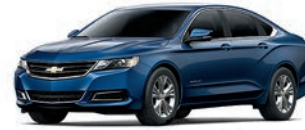
BLUE TOPAZ METALLIC 1,2,3