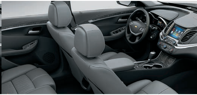
Jet Black/Dark Titanium-Color Premium Cloth/Leatherette 2