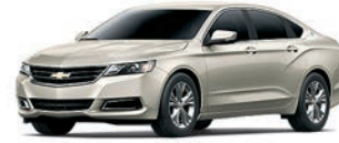
CHAMPAGNE SILVER METALLIC 2