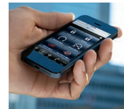
Available OnStar RemoteLink ® mobile app. 5

CHOOSE YOUR GRAPHICS This award-winning Chevrolet MyLink 1 system features four specific graphic appearances for the touch-screen and the Driver Information Center (Contemporary, Edge, Velocity and Main Street), selectable through the Settings menu.