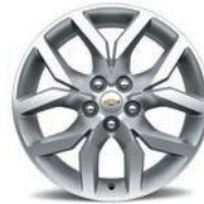
19" Machined-Face Aluminum (Standard on LTZ)