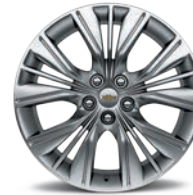
20" Aluminum (Available on LTZ) 9