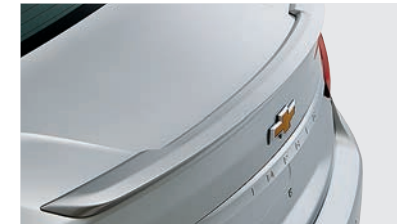
Spoiler (all body colors)

1 Interim availability. 2 Not available with Jet Black/Mojave interior. 3 Not available on Eco. 4 Extra-cost color. 5 Not available on LS. 6 Not available with Jet Black/Brownstone interior. 7 Not available on LTZ. 8 Requires available Premium Seating Package, Premium Audio and Sport Wheels Package, Advanced Safety Package, Convenience Package and sueded microfiber interior. 9 Requires available V6 engine, Premium Audio Package, Comfort and Convenience Package, and Chevrolet MyLink Radio with Navigation.