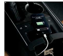
Available USB port 2