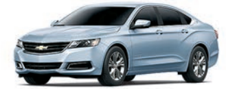
SILVER TOPAZ METALLIC 1,3