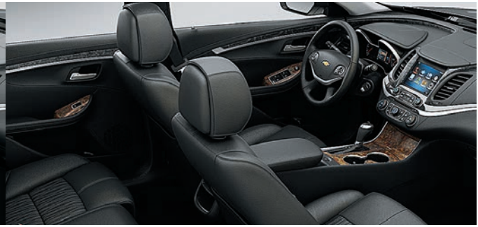
Jet Black Premium Cloth/Leatherette 2