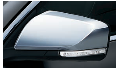
Chrome Mirror Caps