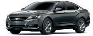
ASHEN GRAY METALLIC 6