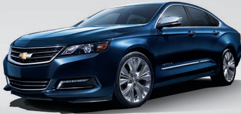
Impala LTZ in Blue Ray Metallic with available features.