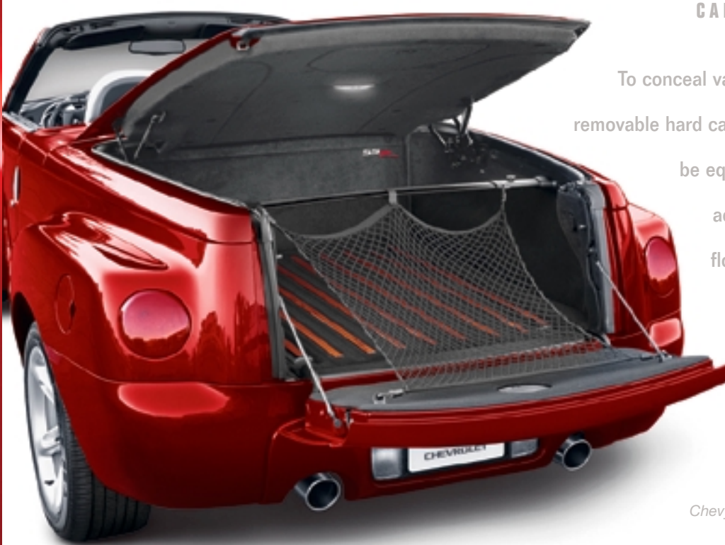
Chevy SSR shown with available features.

To conceal valuable items, SSR features a removable hard cargo-area cover. And SSR can be equipped with various available accessories like cargo netting, floor mats with the customized logo and sidesaddle storage which enhances the vehicle's versatility.