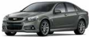
MYSTIC GREEN METALLIC