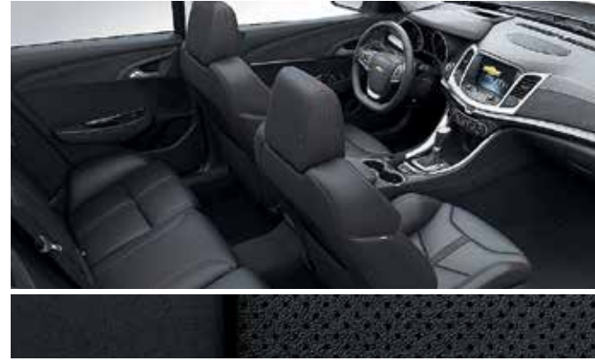
Jet Black Leather Appointments with Red Accent Stitching