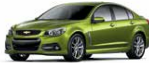
JUNGLE GREEN METALLIC