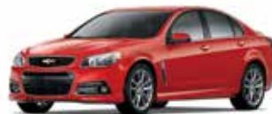
RED HOT 2