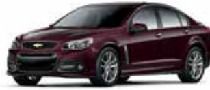
ALCHEMY PURPLE METALLIC