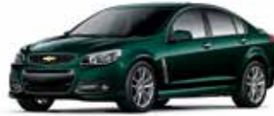
REGAL PEACOCK GREEN METALLIC