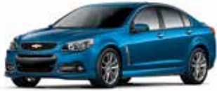
PERFECT BLUE METALLIC