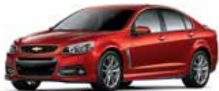
SOME LIKE IT HOT RED METALLIC