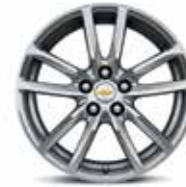
19" Polished Forged-Aluminum 1 (Standard)