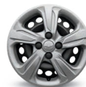
15" Steel with Bolt-On Wheel Cover (LS)