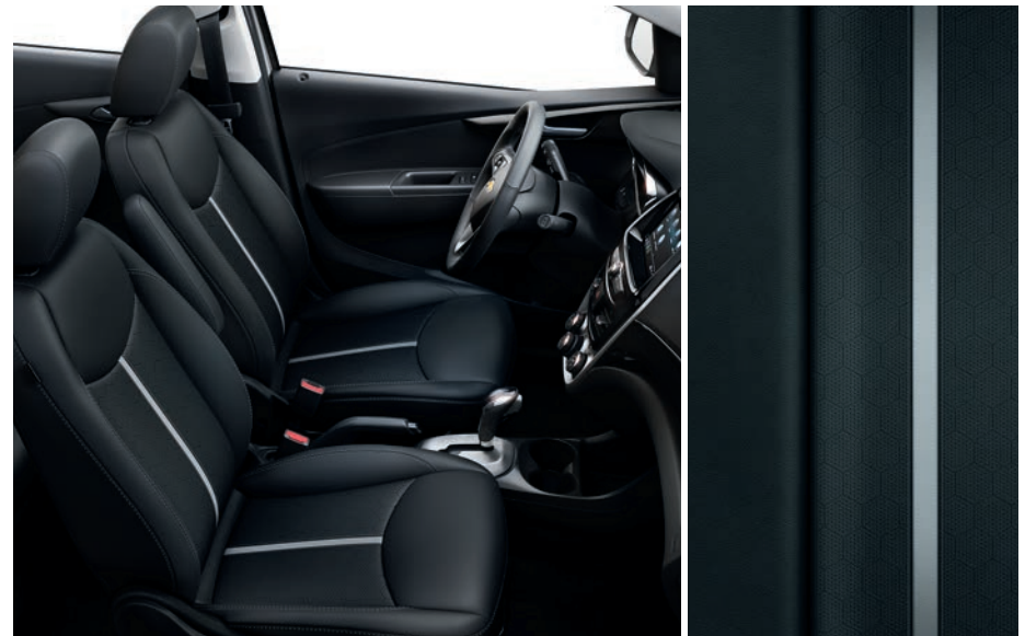
Jet Black Leatherette with Dark Anderson Silver Accent Stripe and Accent Trim 2