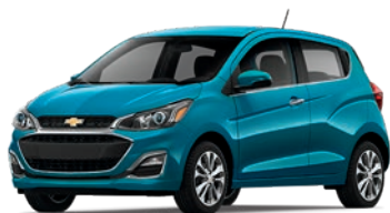
CARIBBEAN BLUE 1