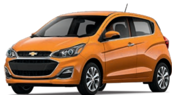
ORANGE BURST 1