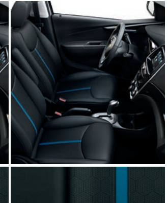
Jet Black Leatherette with Caribbean Blue Accent Stripe and Accent Trim 5