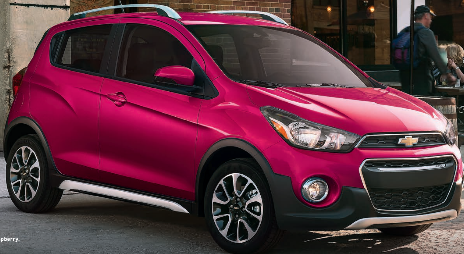
Spark ACTIV in Raspberry.

1 Service varies with conditions and location. Requires active OnStar service and paid AT&T data plan. Vehicle must be on or in accessory mode for Wi-Fi to function. Visit onstar.com for details and limitations. 2 Requires compatible Apple or Android device and data connection. Remote Services require paid plan. 3 Services are subject to User Terms and limitations. Plan does not include emergency or security services. Visit onstar.com for more details. 4 Visit onstar.com for coverage map, system limitations and details. OnStar plan, working electrical system, cell service and GPS signal required. OnStar links to emergency services. 5 If you decide to continue service after your trial, the subscription plan you choose will automatically renew thereafter and you will be charged according to your chosen payment method at then-current rates. Fees and taxes apply. To cancel you must call SiriusXM at 1-866-635-2349. See SiriusXM Customer Agreement for complete terms at siriusxm.com . All fees and programming subject to change.