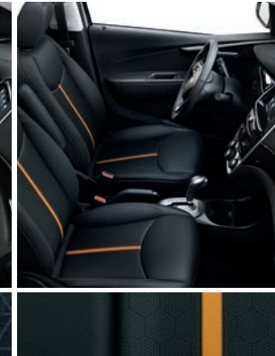
Jet Black Leatherette with Orange Burst Accent Stripe and Accent Trim 4