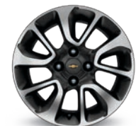
15" Gunmetal Silver-Painted Alloy (ACTIV)