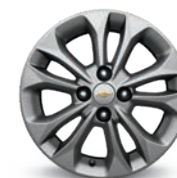
15" Silver-Painted Alloy (1LT and 2LT)