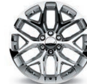
22" Chrome-Aluminum Multi-Feature Design (Available on LT and LTZ)