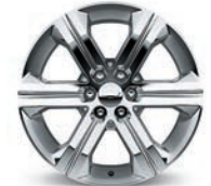
22" Chrome-Aluminum (Available on LT and LTZ)