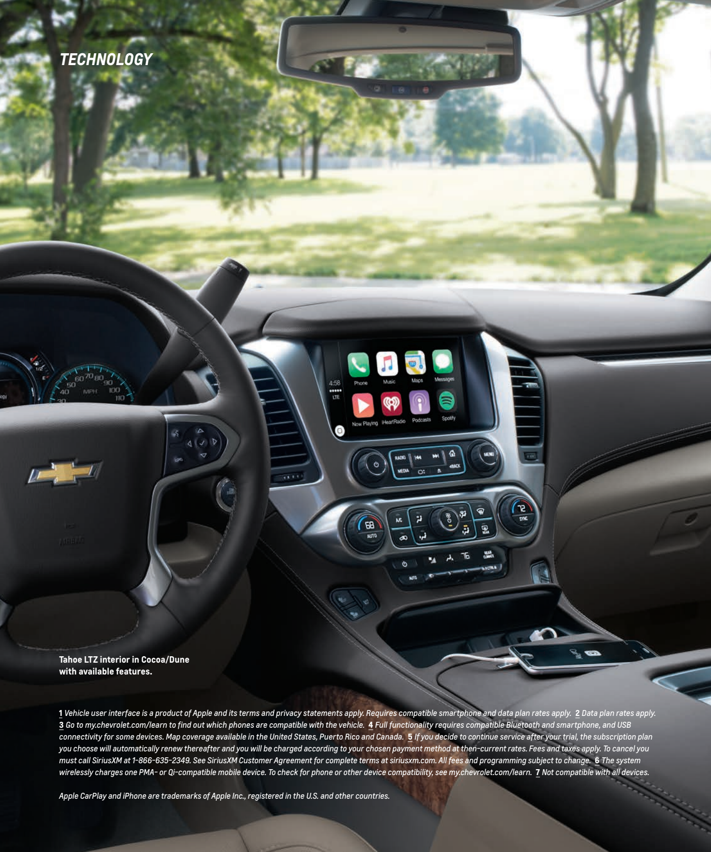
Tahoe LTZ interior in Cocoa/Dune with available features.

1 Vehicle user interface is a product of Apple and its terms and privacy statements apply. Requires compatible smartphone and data plan rates apply. 2 Data plan rates apply. 3 Go to my.chevrolet.com/learn to find out which phones are compatible with the vehicle. 4 Full functionality requires compatible Bluetooth and smartphone, and USB connectivity for some devices. Map coverage available in the United States, Puerto Rico and Canada. 5 If you decide to continue service after your trial, the subscription plan you choose will automatically renew thereafter and you will be charged according to your chosen payment method at then-current rates. Fees and taxes apply. To cancel you must call SiriusXM at 1-866-635-2349. See SiriusXM Customer Agreement for complete terms at siriusxm.com . All fees and programming subject to change. 6 The system wirelessly charges one PMA- or Qi-compatible mobile device. To check for phone or other device compatibility, see my.chevrolet.com/learn . 7 Not compatible with all devices.