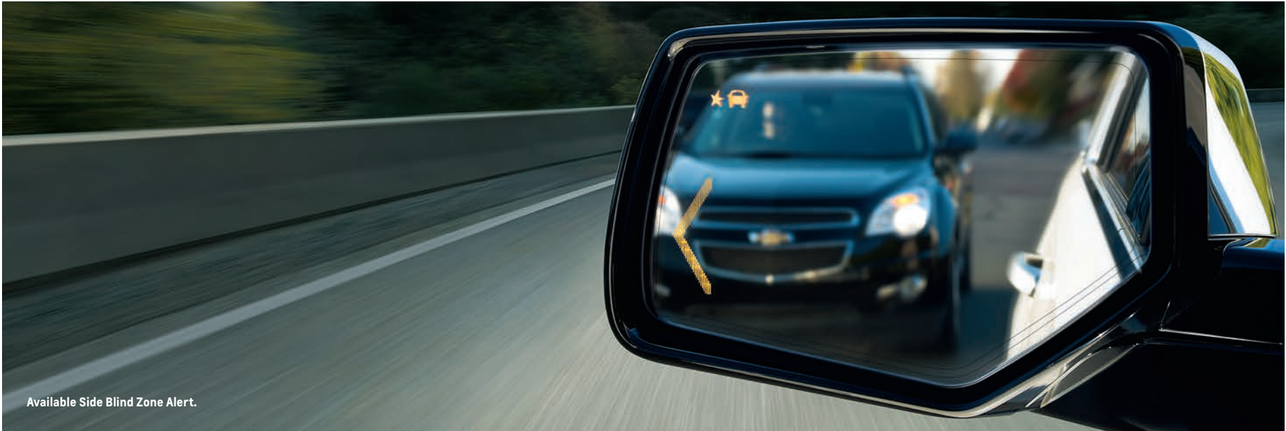
Available Side Blind Zone Alert.