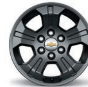
18" Painted-Aluminum (Available on LT; requires Z71 Off-Road Package)