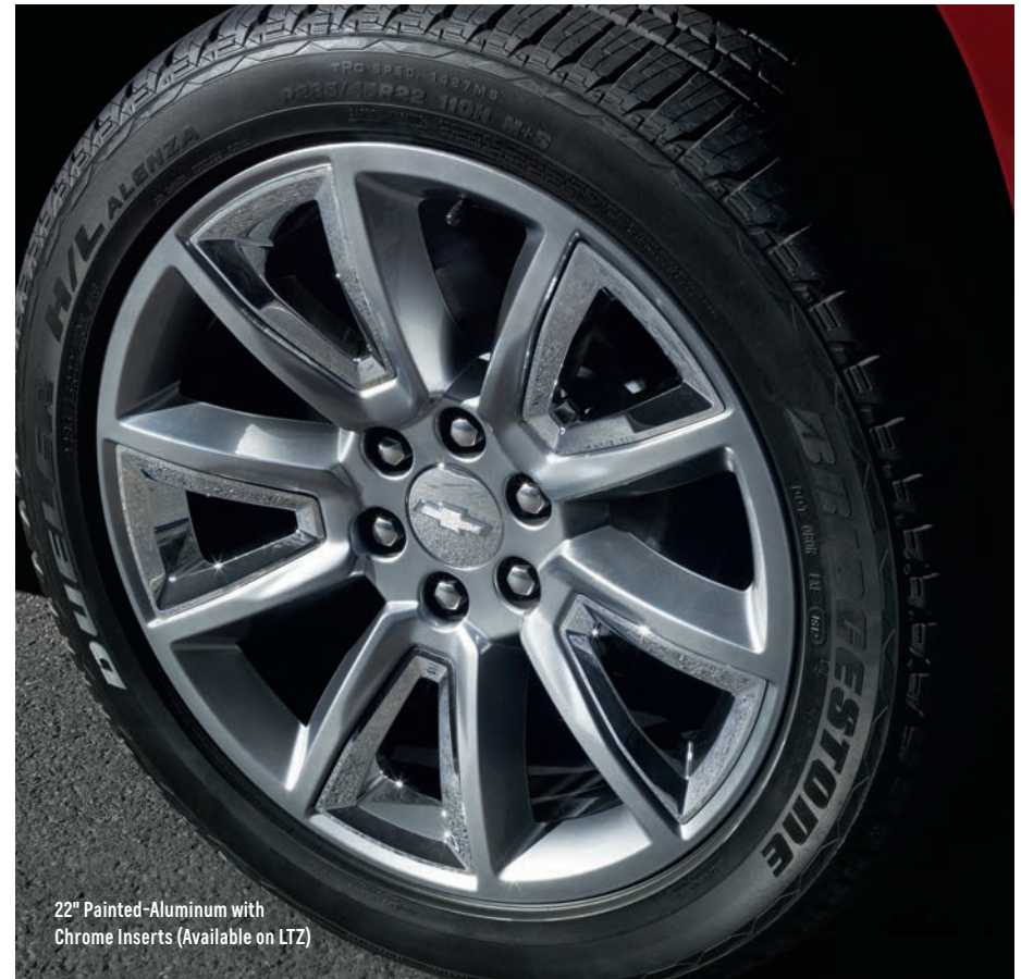
22" Painted-Aluminum with Chrome Inserts (Available on LTZ)