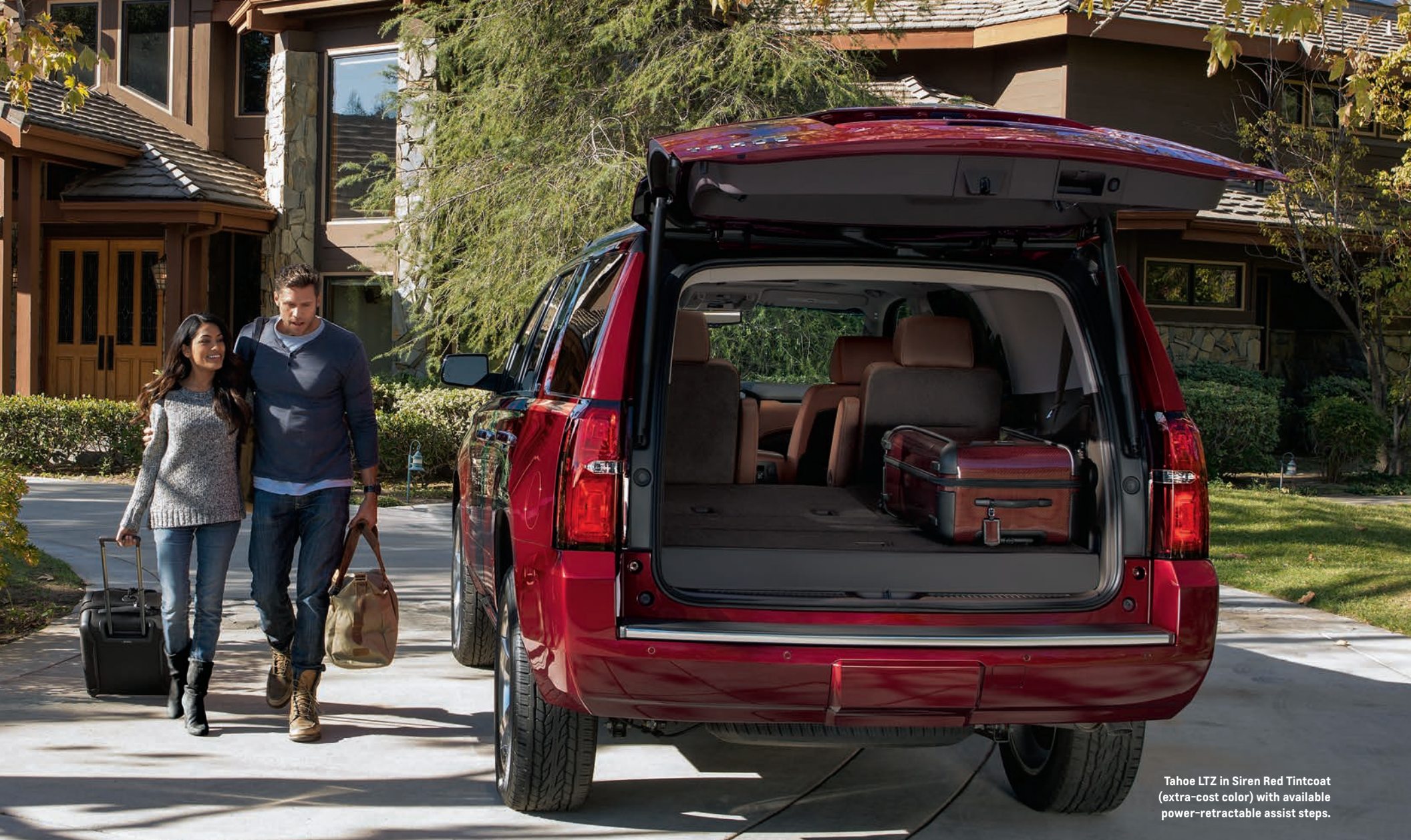
Tahoe LTZ in Siren Red Tintcoat (extra-cost color) with available power-retractable assist steps.

VERSATILITY DEFINED. How you use your Tahoe changes from day to day and even from trip to trip. The supremely quiet and comfortable interior provides spaciousness for up to nine passengers in LS models.