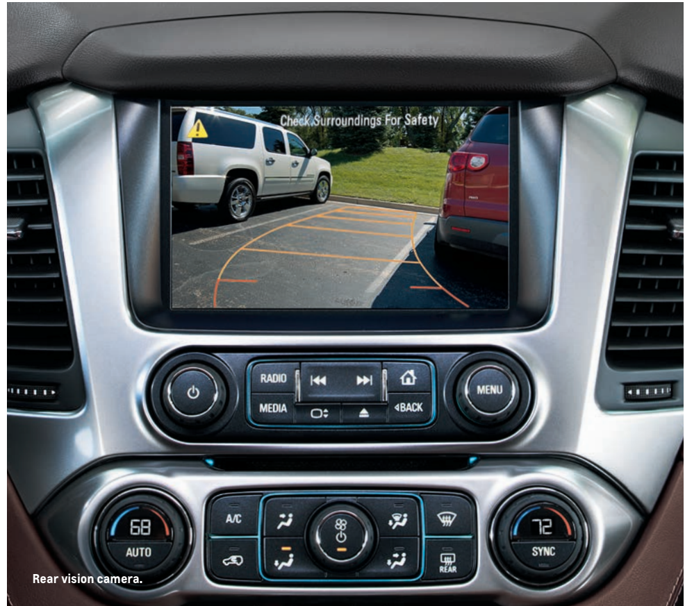
Rear vision camera.