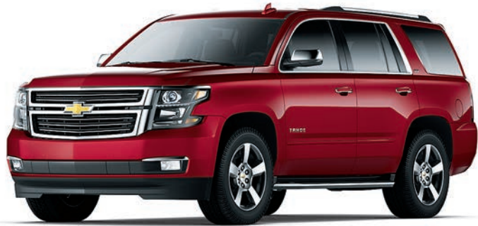
SIREN RED TINTCOAT 1