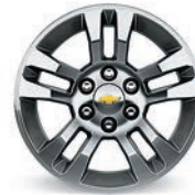
18" Aluminum with High-Polished Finish (Standard on LS and LT)