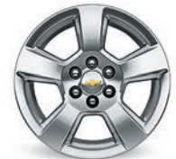
20" Polished-Aluminum (Standard on LTZ; available on LS and LT)