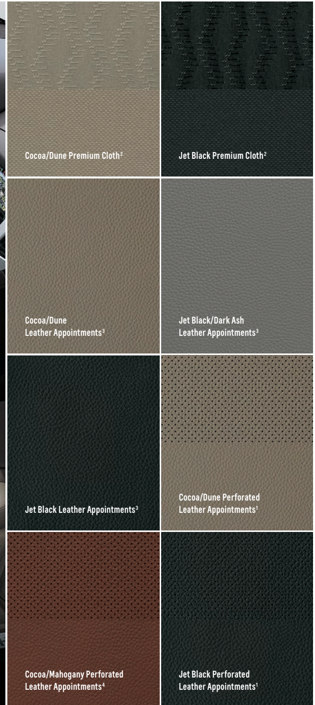
Cocoa/Dune Perforated Leather Appointments 1