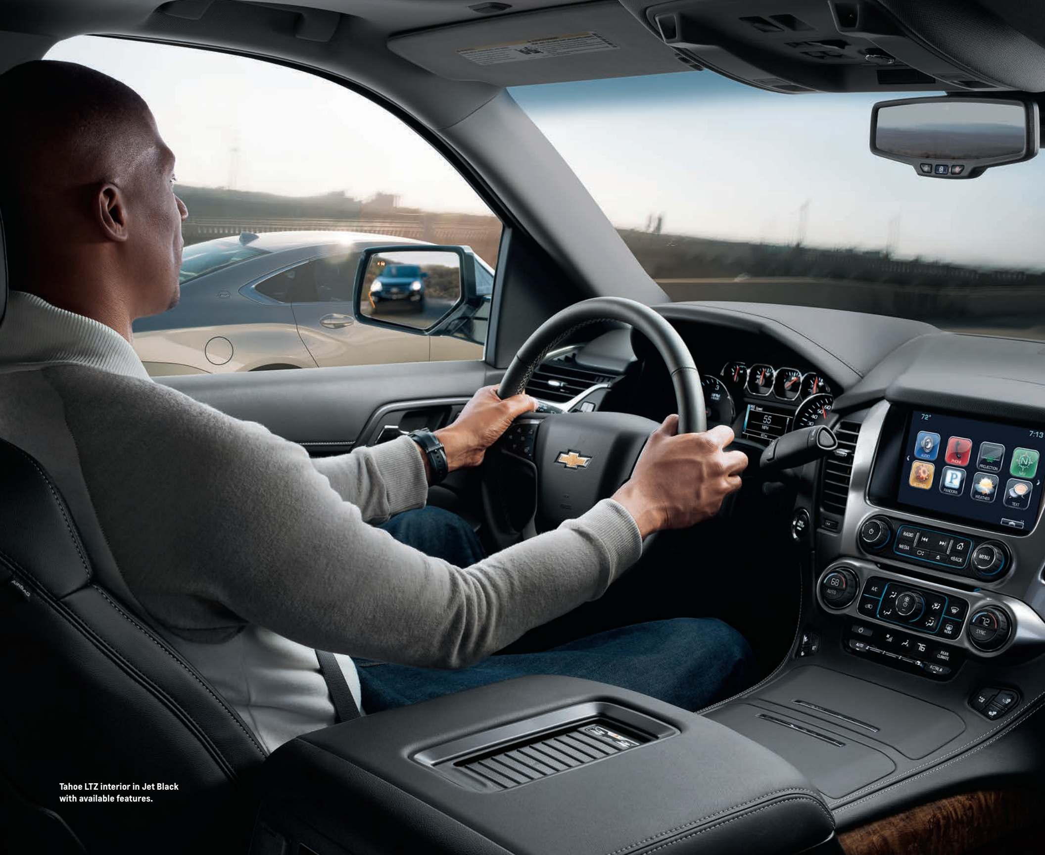
Tahoe LTZ interior in Jet Black with available features.