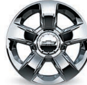
20" Chrome-Aluminum (Available on LTZ)