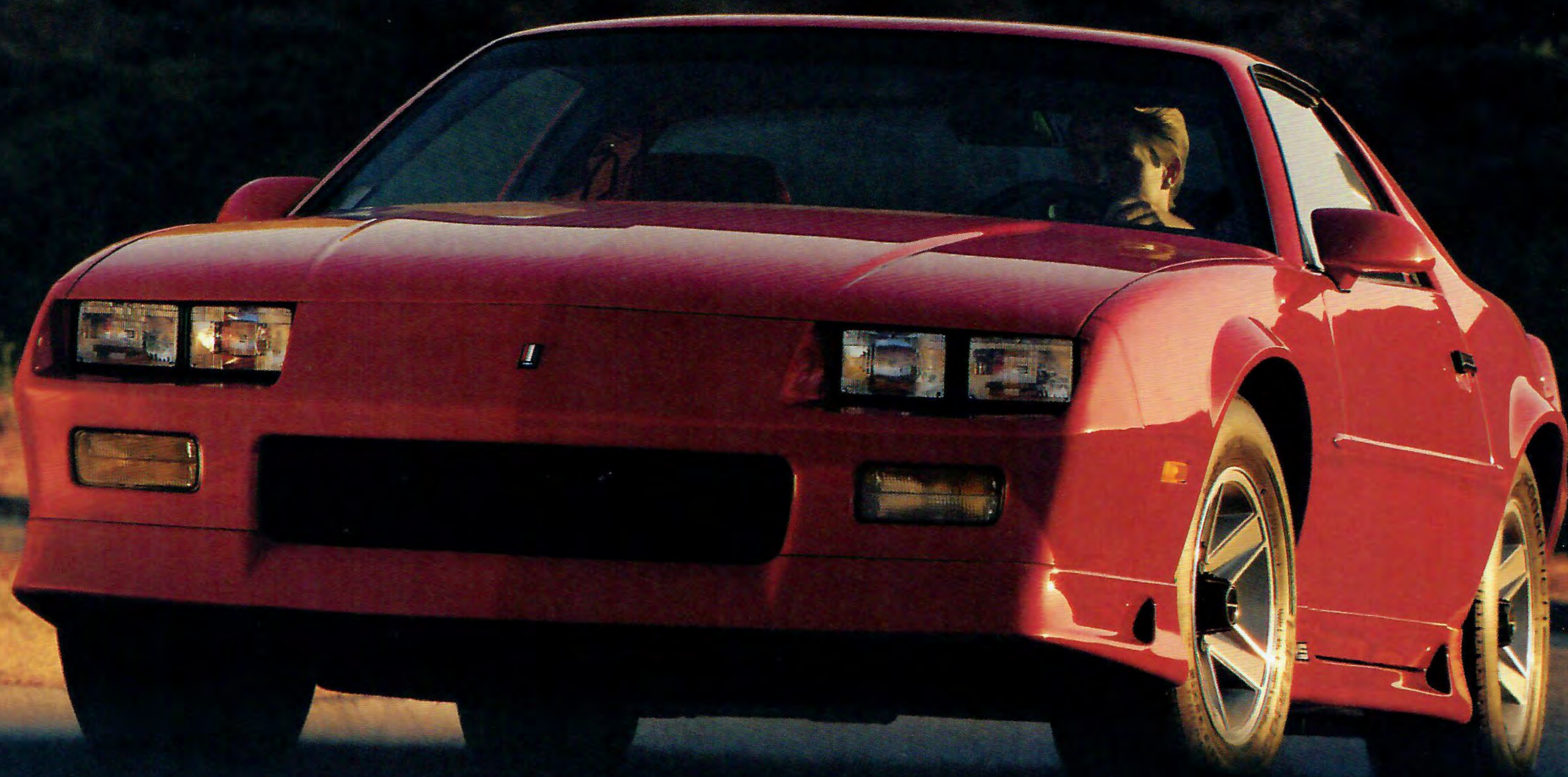
Camaro RS Coupe.