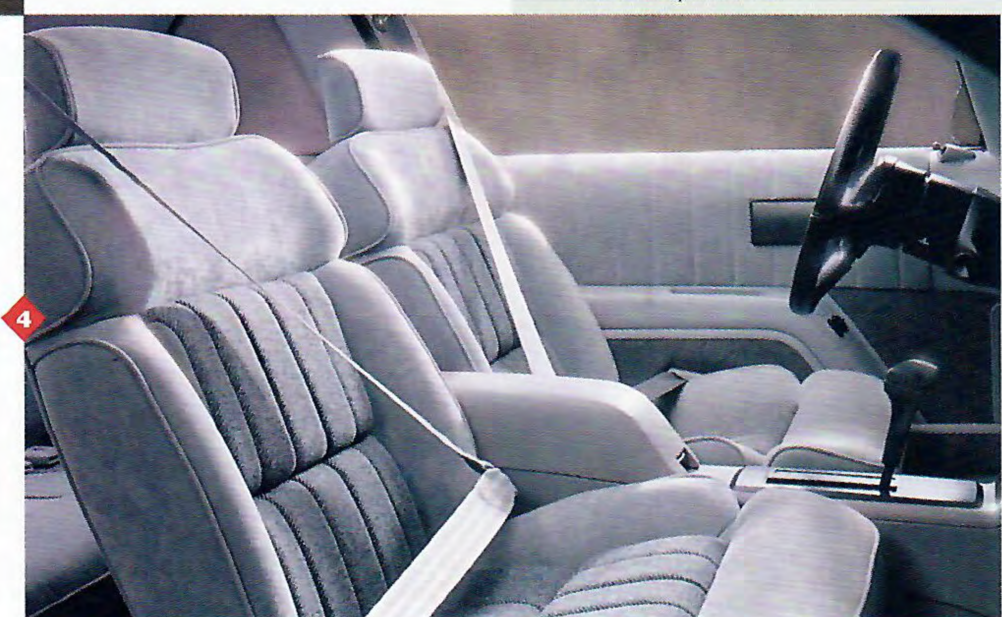
Lumina Z34 Coupe.