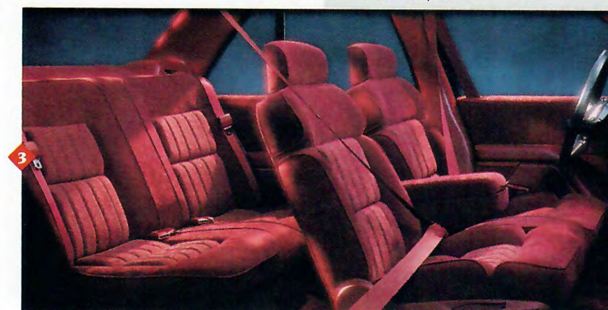
Lumina Euro Sedan.