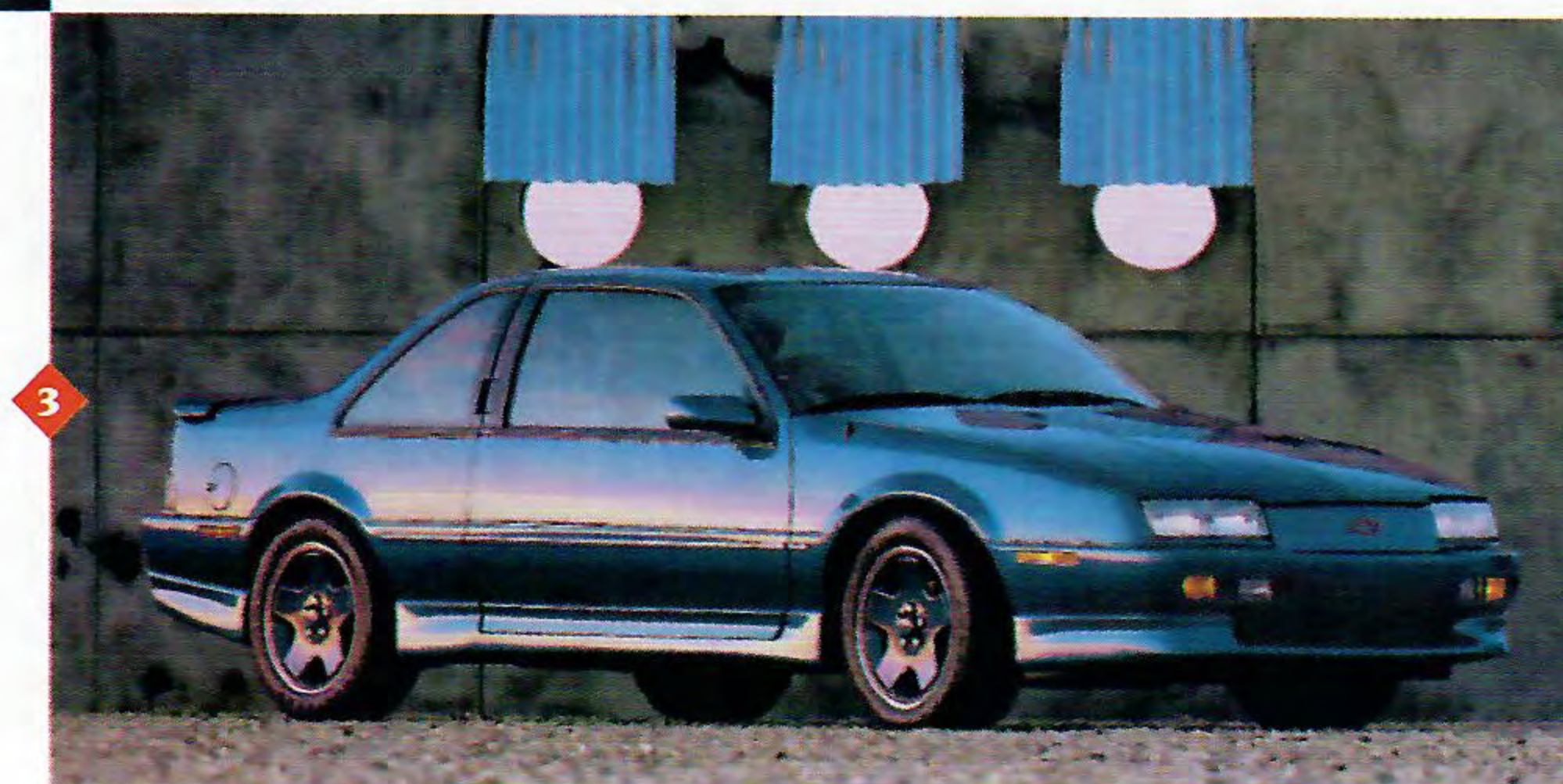
Beretta GT Coupe.