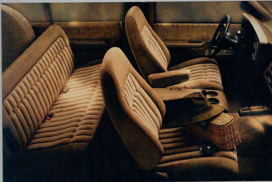
▲ Blazer Custom Cloth interior with optional luxury-level Silverado trim, shown in Beige. Optional 5-passenger seating is featured here, including high-back, reclining front bucket seats.

of The Year" by Four Wheeler magazine. Its standard 5.7 Liter (350 cu. in.) V8 cranks out 210 HP to handle big towing and hauling chores. Standard Insta-Trac 4x4 also lets you shift from 2WD to 4x4 High and back at any speed.