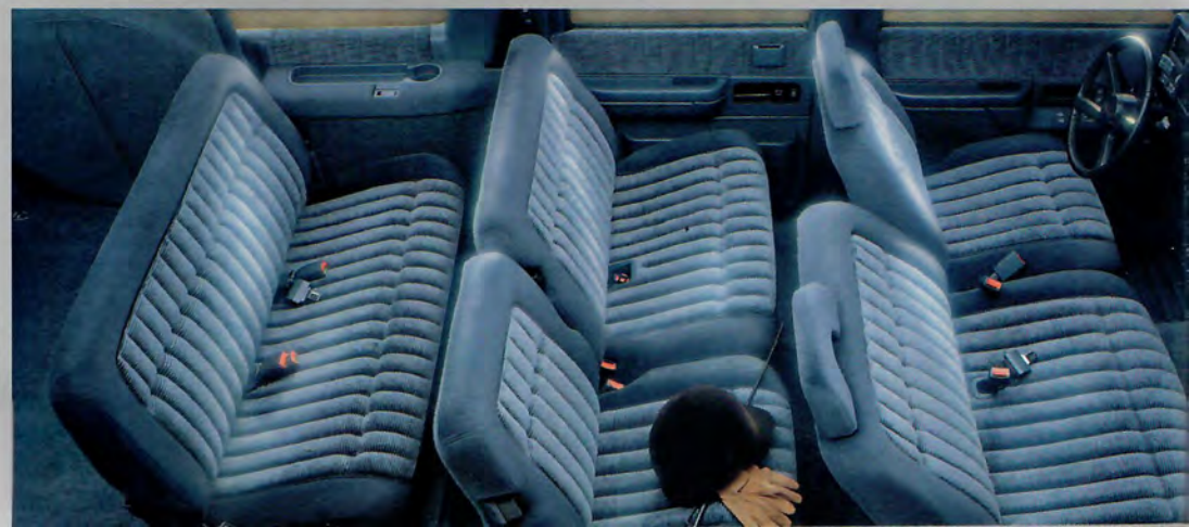
Suburban Custom Cloth interior in Blue with optional luxury-level Silverado trim. Also shown here: optional 9-passenger seating, including a 30" (30") lower bench seat and 50/50 center-row bench seat.