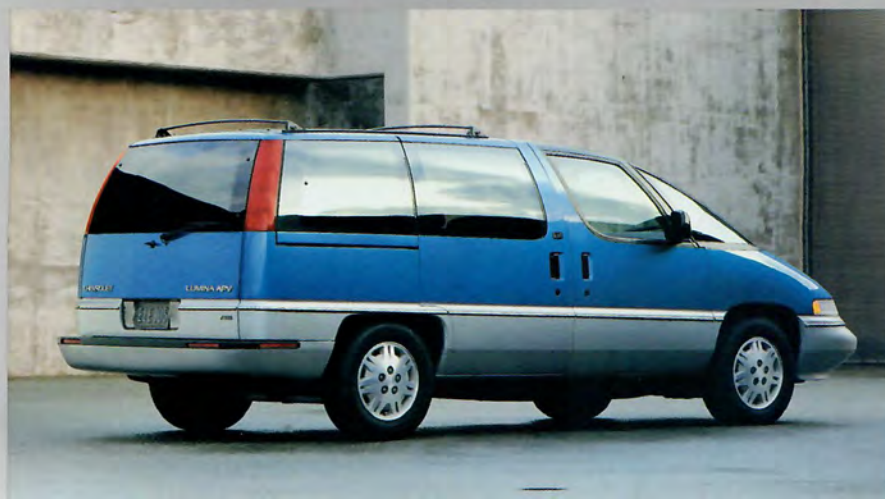
Lumina APV LS with optional Custom Two-Tone in Silver Blue Metallic and Silver Metallic. ▶