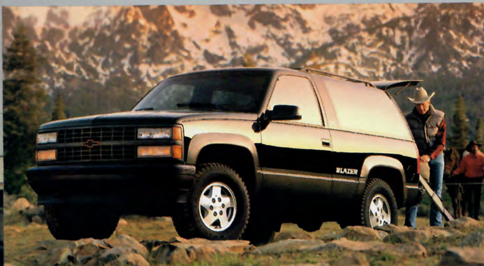
▲ Blazer's optional Sport trim package includes Sport Two-Tone paint (shown in Onyx Black and Gunmetal Gray), cast-aluminum wheels, "Sport" decals and much more.