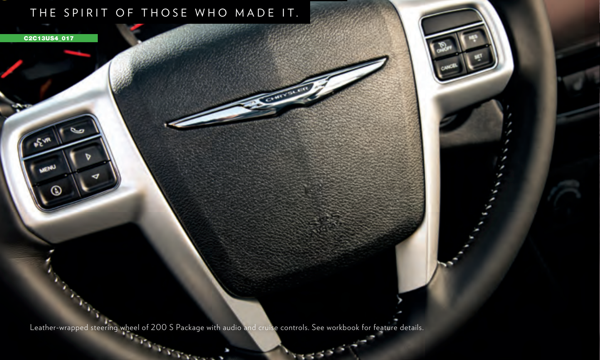
Leather-wrapped steering wheel of 200 S Package with audio and cruise controls. See workbook for feature details.

WHETHER IT IS CAST OR FORGED, STITCHED OR SCULPTED, IT IS SOMETHING BORN TO DELIVER THE SPIRIT OF THOSE WHO MADE IT.