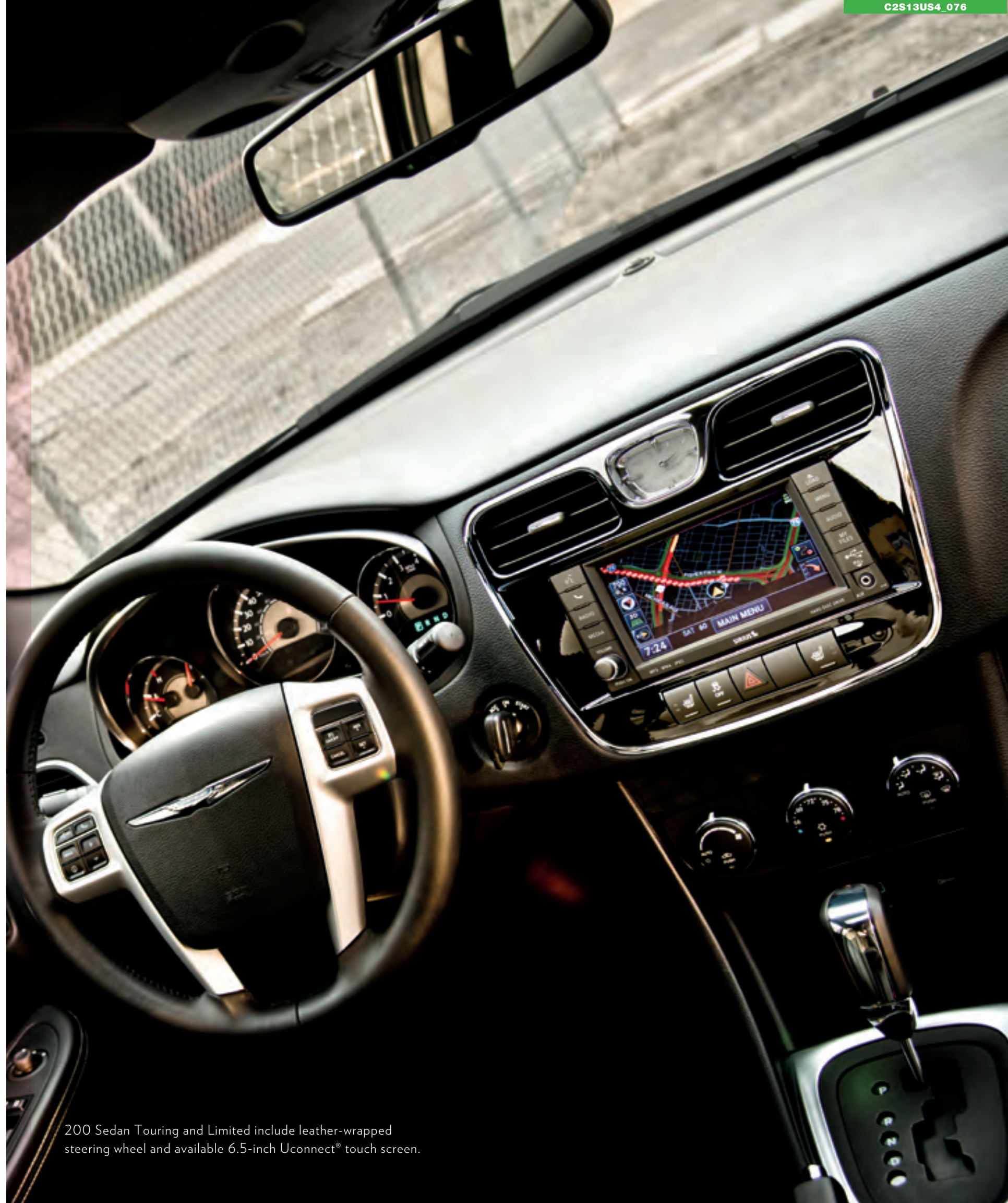
200 Sedan Touring and Limited include leather-wrapped steering wheel and available 6.5-inch Uconnect® touch screen.