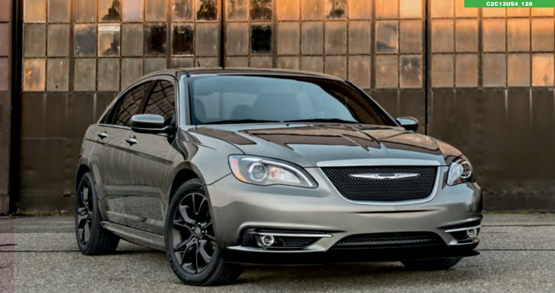
200 Super S Premium interior leather and chrome appointments as well as a unique mesh grille with integrated Chrysler wing design.