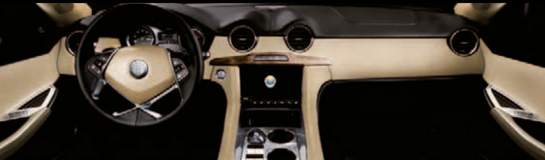
● Monsoon Tri-Tone™