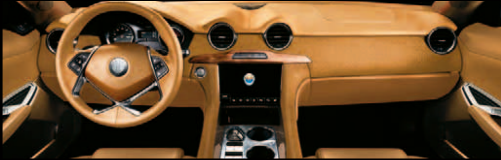
● Dune Monotone™