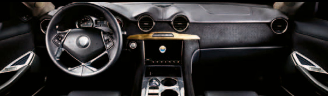
● Black Sand Monotone™