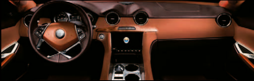
● Canyon Tri-Tone™