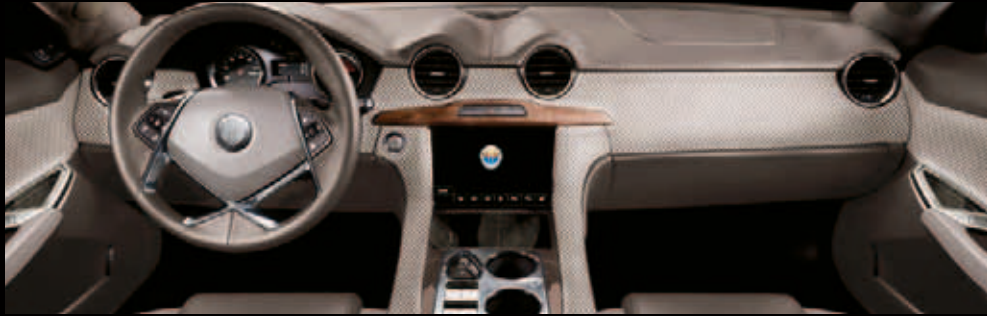
● Earth Tri-Tone™