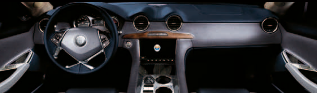
● Glacier Tri-Tone™