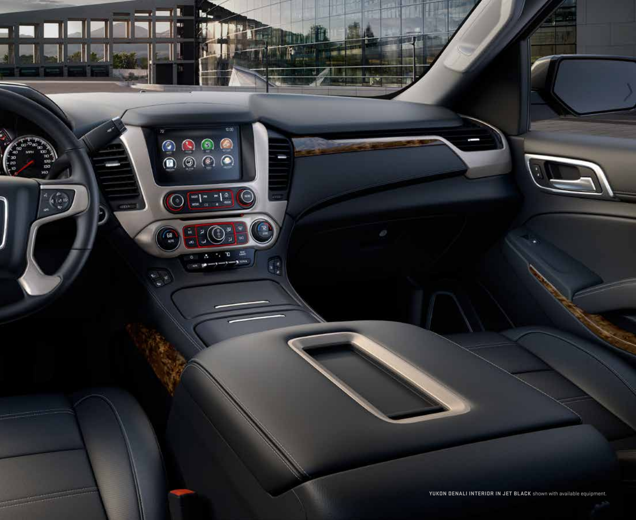
YUKON DENALI INTERIOR IN JET BLACK shown with available equipment.