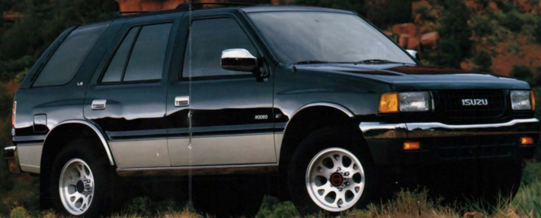
RODEO LS 4WD