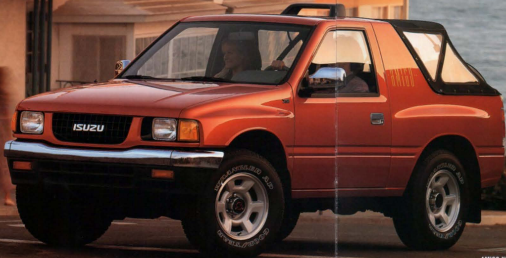
AMIGO XS 4WD

With Amigo's removable rear canvas top and optional removable sunroof, it's no hassle to suddenly make the most of the day's sunshine. And, Amigo's rear bench seat folds to help you carry a load of fun-filled cargo.