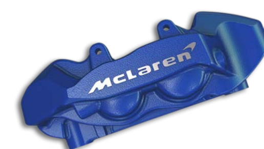
Azura Blue with silver machined McLaren Logo