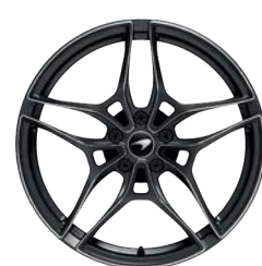
Satin Diamond cut finish

Lightweight 10-Spoke forged alloy wheels