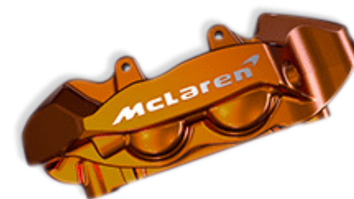
Azores with machined McLaren logo