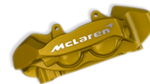
Yellow with machined McLaren logo