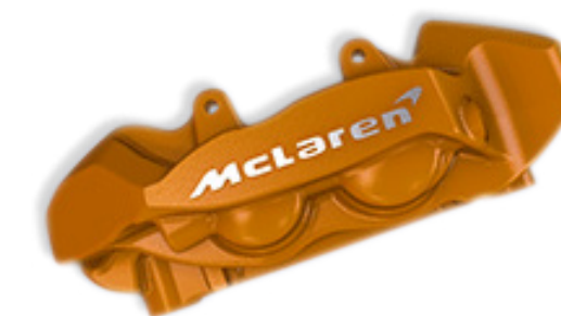
McLaren Orange with machined McLaren logo