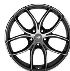
Satin Diamond cut finish

Super-Lightweight 10-Spoke forged alloy wheels