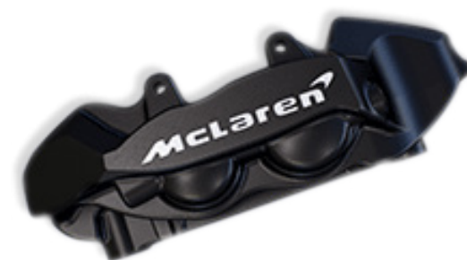
Black with printed McLaren logo