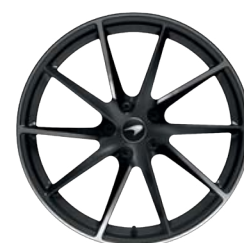
Satin Diamond cut finish