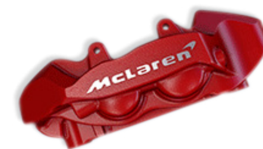
Red with machined McLaren logo