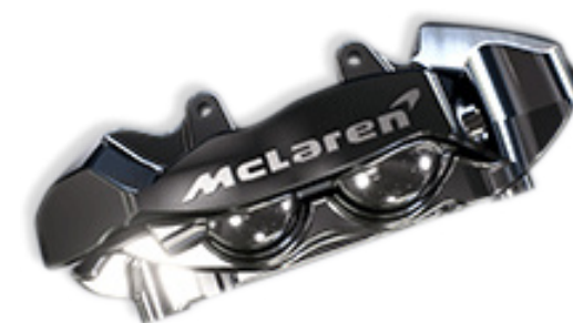
Polished with machined McLaren logo