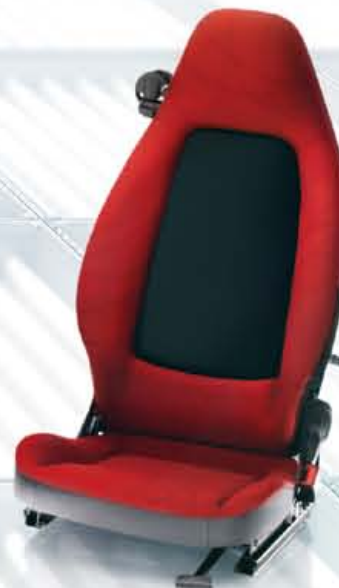
The new passion