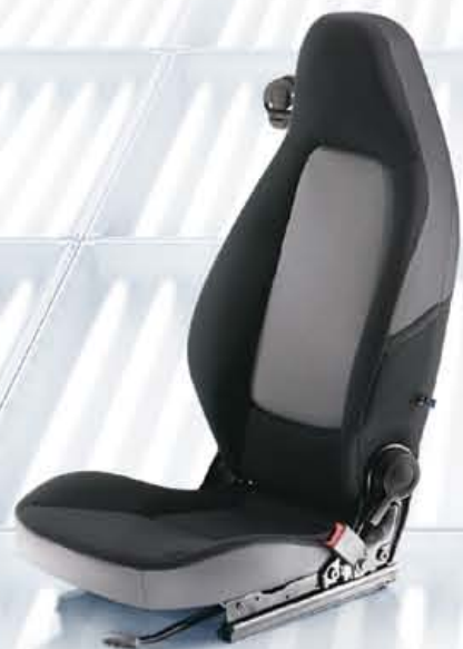
The new pure