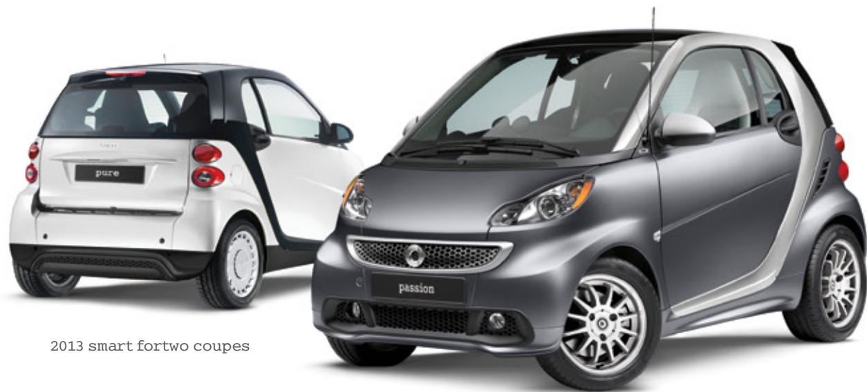
2013 smart fortwo coupes