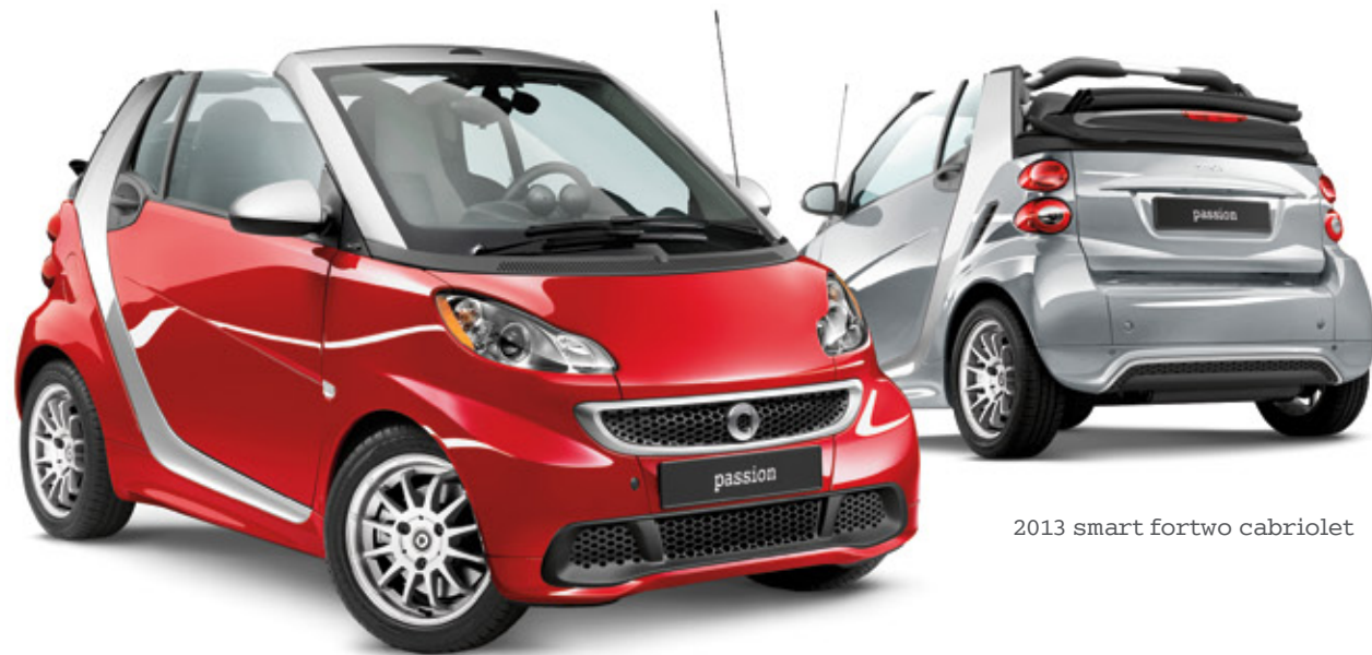
2013 smart fortwo cabriolet