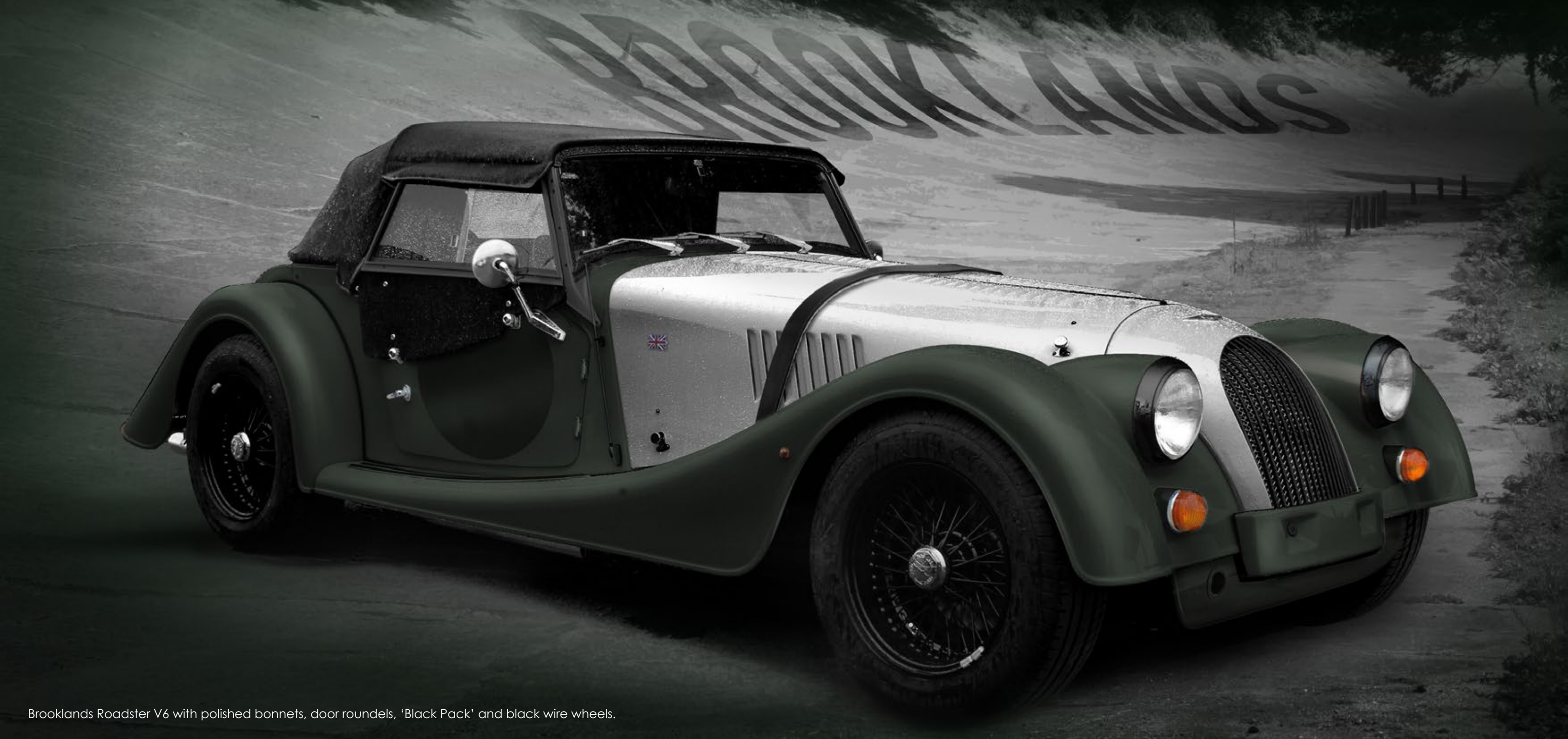
Brooklands Roadster V6 with polished bonnets, door roundels, 'Black Pack' and black wire wheels.