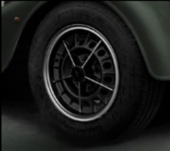
Alloys with Silver accents