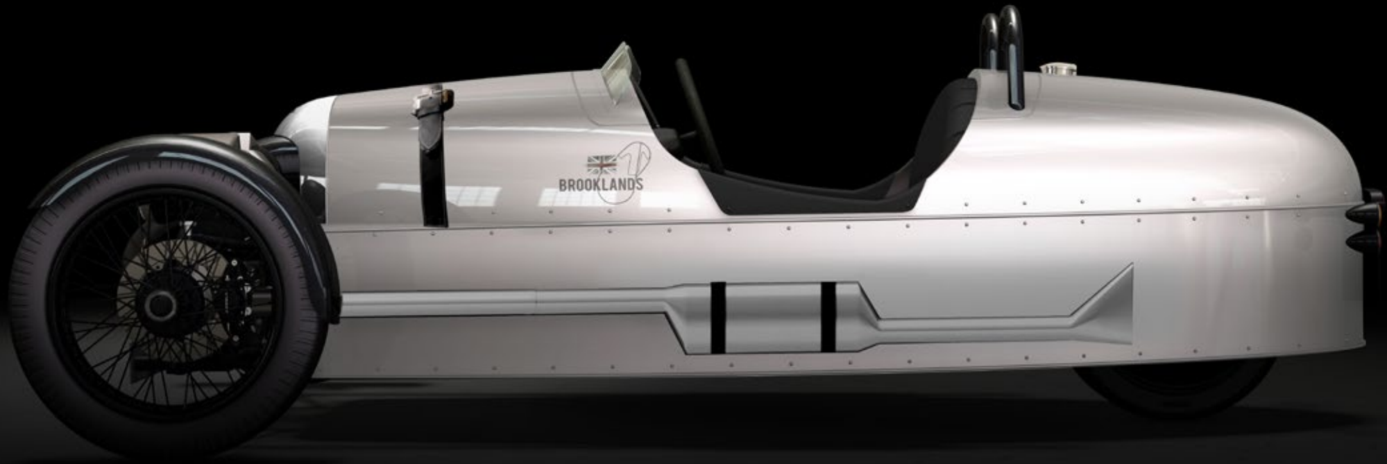
Polished body option