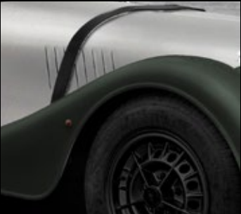
Standard Satin Bonnets