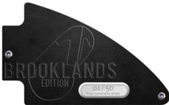
Dash detail with numbered plaque