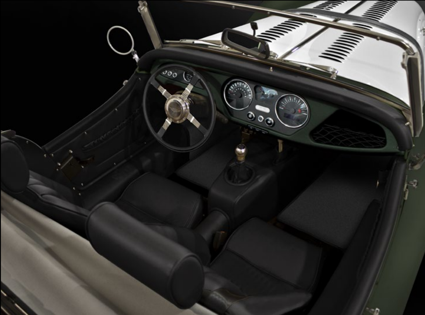
Standard car includes Brooklands steering wheel and NEW perforated Sports seats