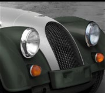
Std. polished headlights