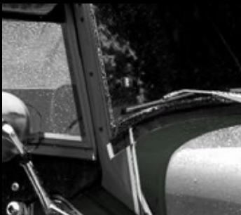
'Black pack' Trims