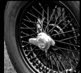
Black wire wheels