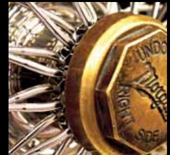
Polished wire wheels