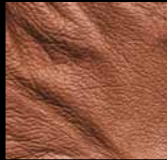
Saddle Brown Leather