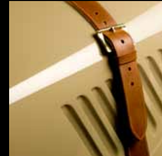
Bonnet strap detail

Whichever route you choose the excitement will begin the day you decide to buy a Morgan sports car.