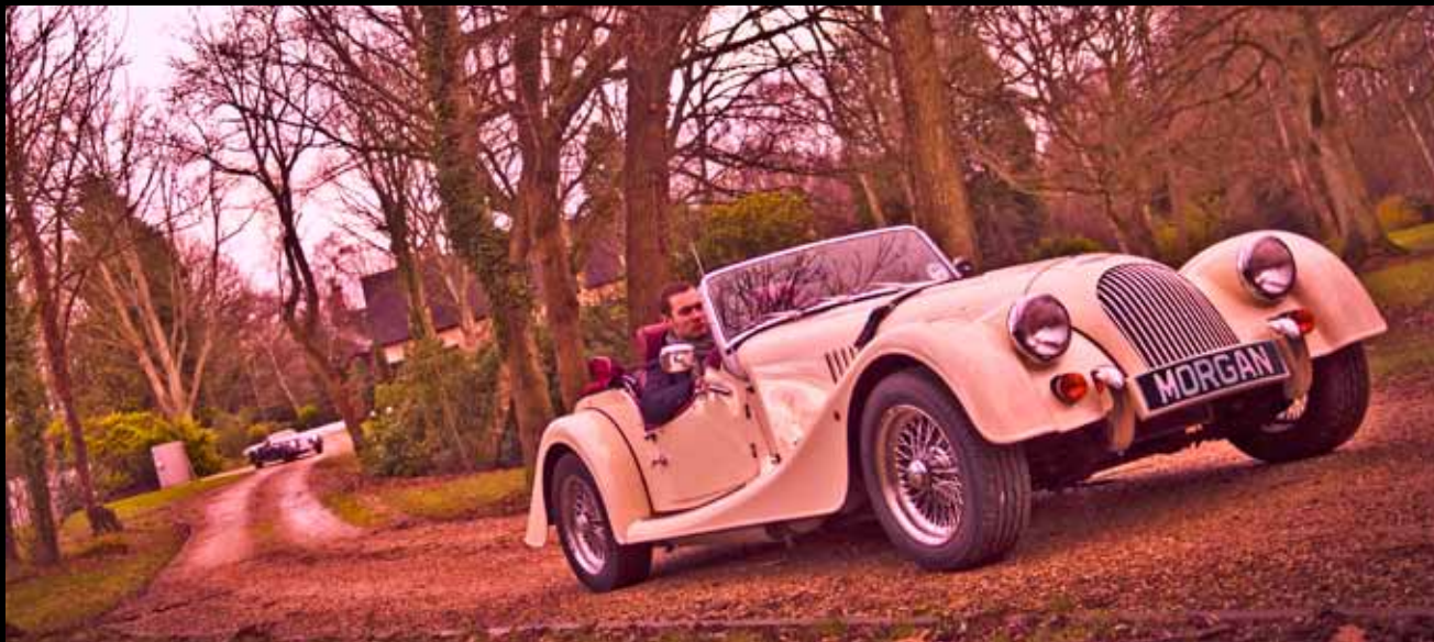
Bespoke specification Plus 4