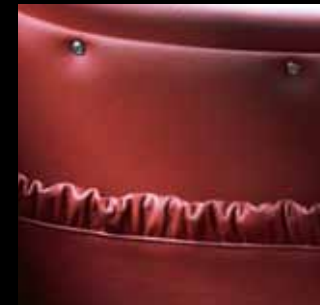
Tan or black leather