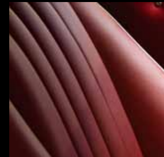
Several leather choices