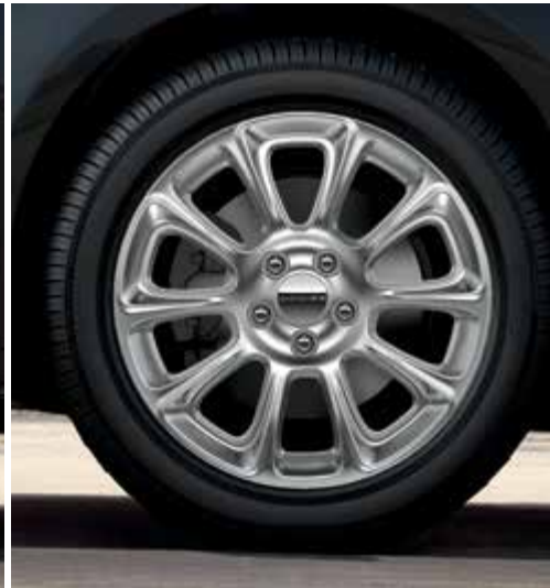
17-inch Satin Silver aluminum (standard on Limited)