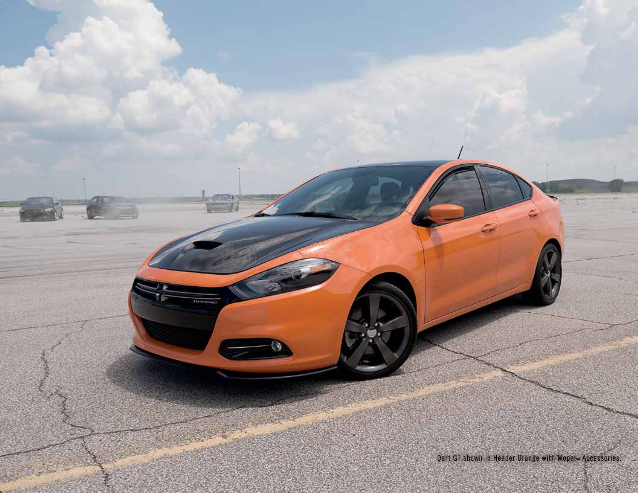
Dart GT shown in Header Orange with Mopar® Accessories.