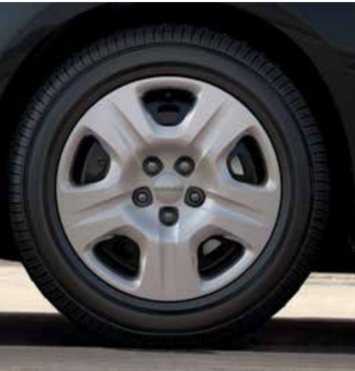
16-inch wheel cover (standard on SE)