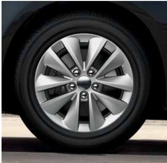
16-inch Tech Silver aluminum (standard on SXT and Aero)