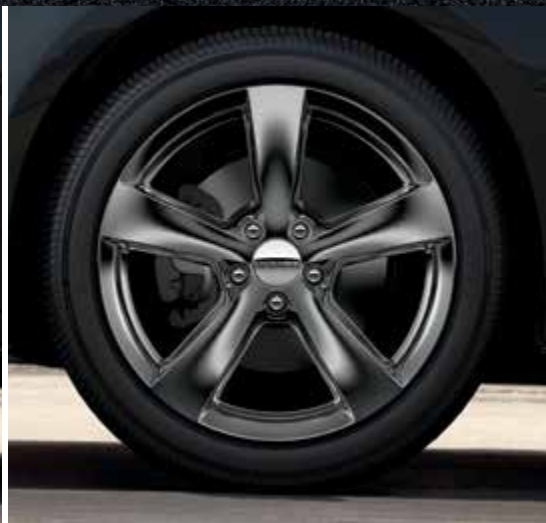
18-inch Hyper Black aluminum (optional on GT)