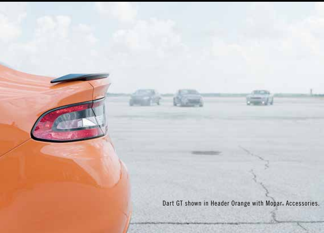
Dart GT shown in Header Orange with Mopar® Accessories.

/// MOST AWARD-WINNING VEHICLE IN ITS CLASS (1)*