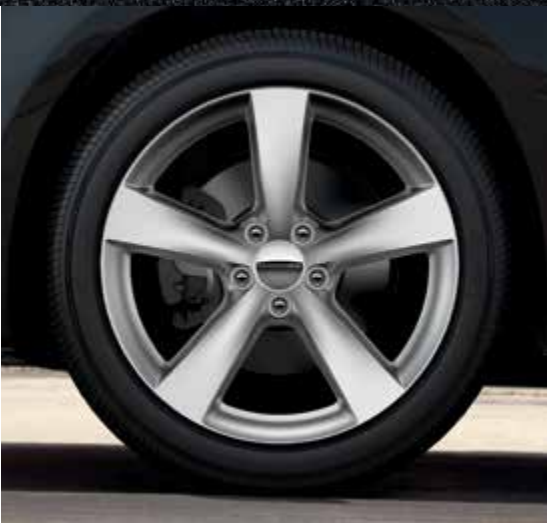
18-inch Satin Silver aluminum (standard on GT)