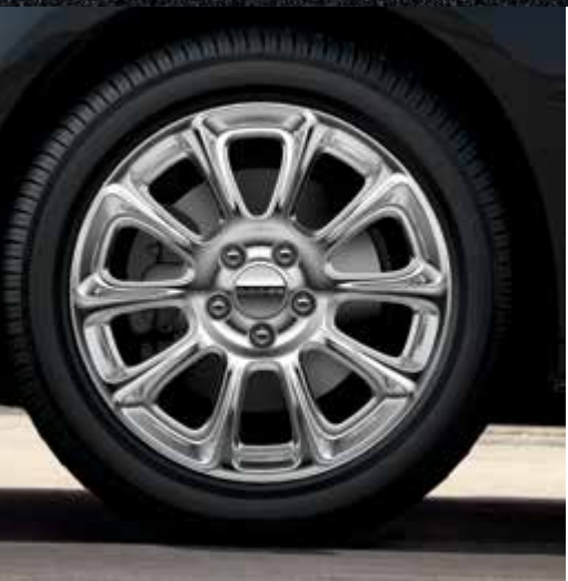
17-inch polished aluminum (optional on Limited)