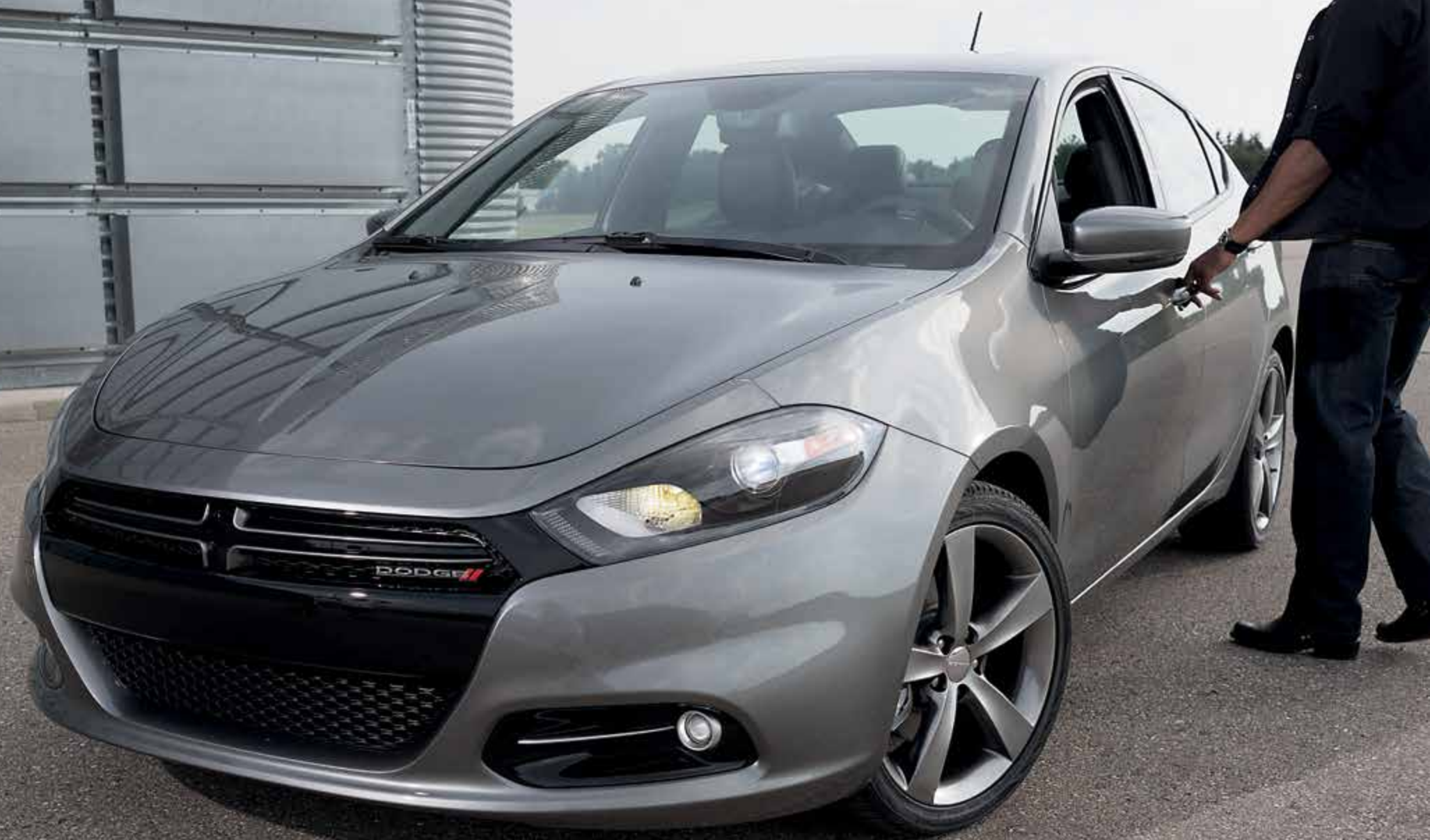
Dart GT shown in Granite Crystal Metallic.