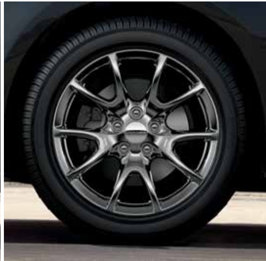
17-inch Hyper Black aluminum (included in Rallye Appearance Group on SXT)