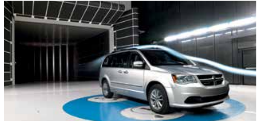
WIND TUNNEL TESTING