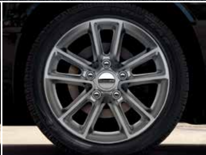
17-inch polished aluminum with Satin Carbon pockets (standard on SXT 30 th Anniversary Edition)