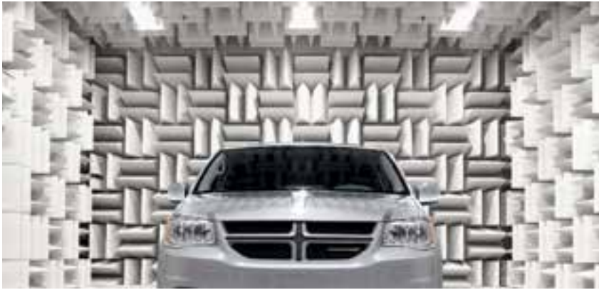
ANECHOIC CHAMBER — NOISE, VIBRATION AND HARSHNESS (NVH) TESTING