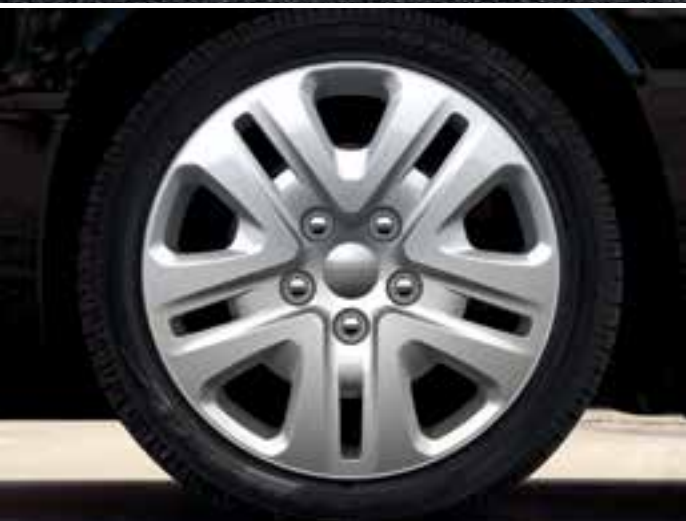
17-inch wheel cover (standard on AVP and SE)