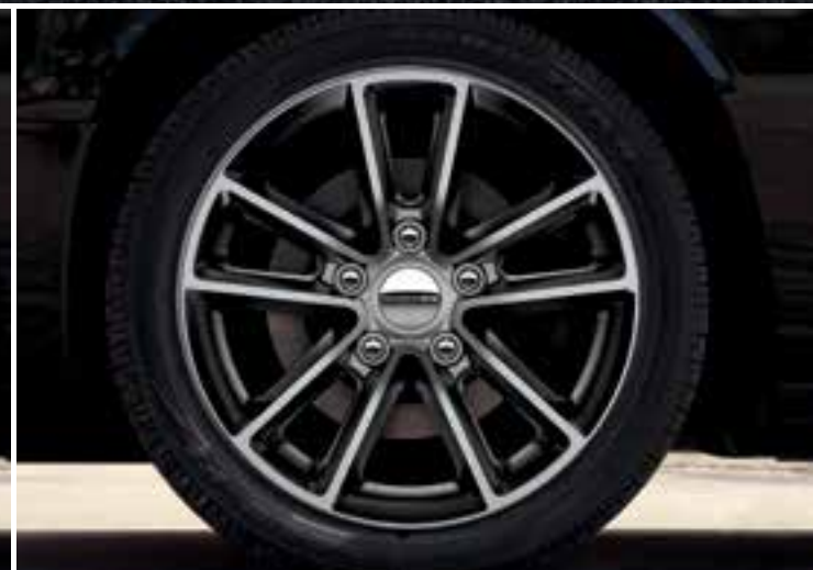
17-inch polished aluminum with Gloss Black pockets (included in Blacktop Package on SE and SXT)