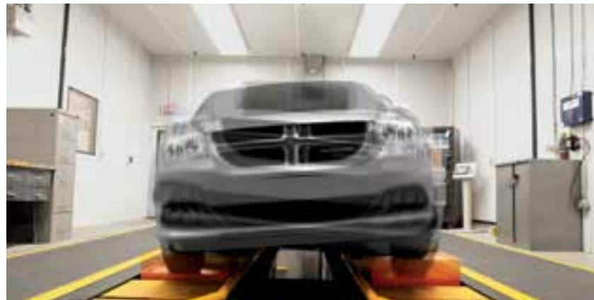
FOUR-POST SHAKER — SUSPENSION TESTING