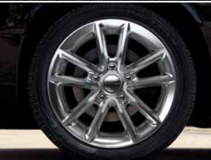
17-inch Satin Carbon aluminum (standard on SE 30 th Anniversary Edition* and R/T)