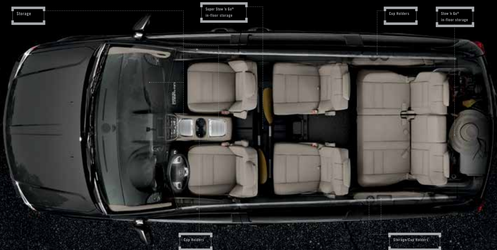
GRAND CARAVAN SXT SHOWN WITH SANDSTORM CLOTH INTERIOR.