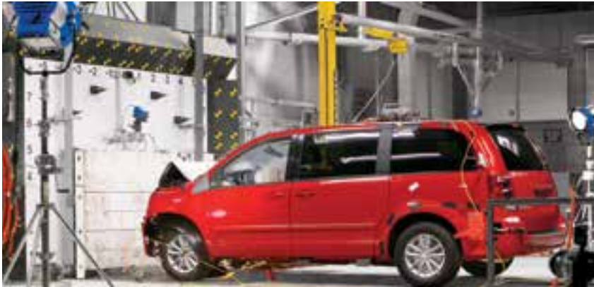
CRUSH ZONE TESTING