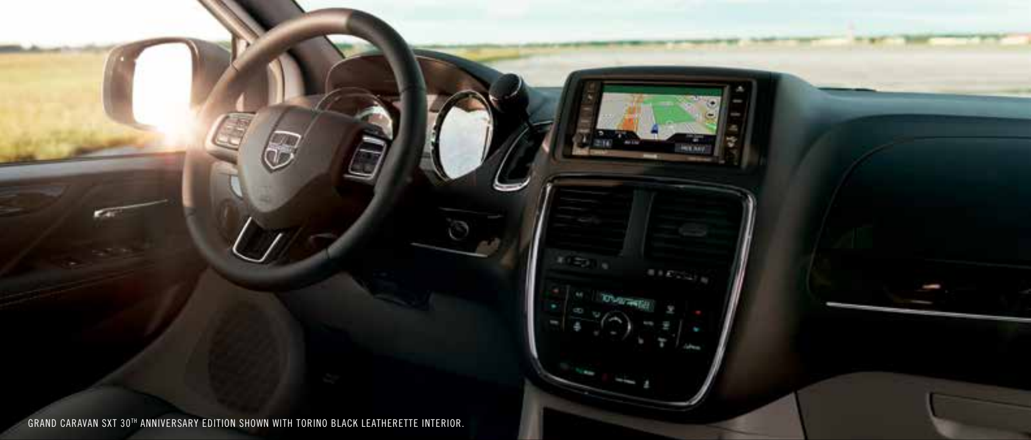
GRAND CARAVAN SXT 30 TH ANNIVERSARY EDITION SHOWN WITH TORINO BLACK LEATHERETTE INTERIOR.

INTUITIVE, DRIVER-FRIENDLY TECHNOLOGY. It starts with the standard Uconnect ® 130 radio/CD player with auxiliary jack and builds up to the available Uconnect 430N system with 6.5-inch touch screen and Garmin ® Navigation that lets you launch a playlist from your MP3 player, request directions and make a call, all without taking your hands off the wheel. From the simple to the fully advanced, Grand Caravan and Uconnect offer technology that keeps you connected.