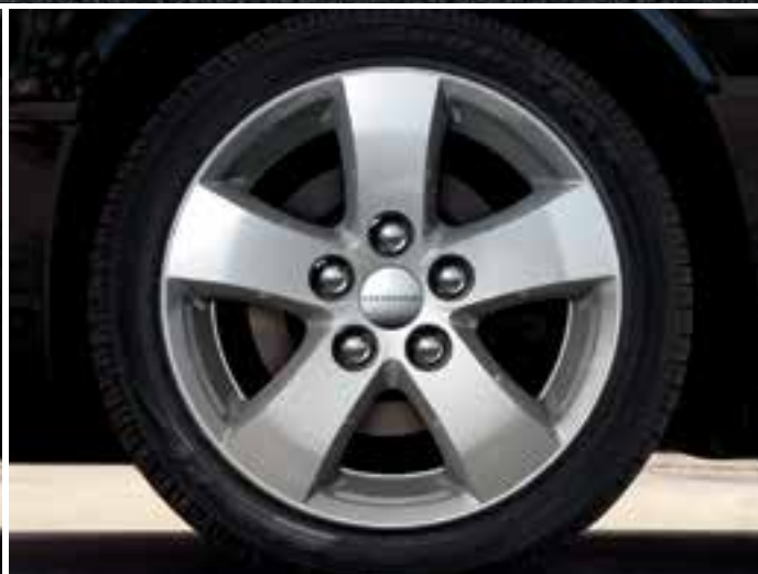
17-inch aluminum (optional on SE)