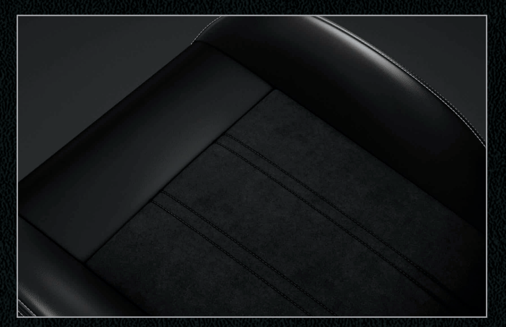
Premium seats in Black with suede inserts and Silver accent stitching — standard on SXT; included with Blacktop Package on SXT