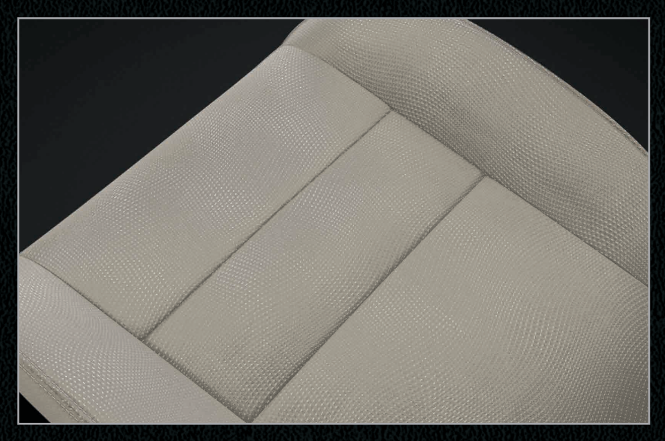
Hudson cloth in Light Graystone (also available in Black) — standard on SE \,