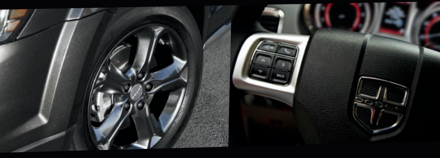
//// MOST VERSATILE CROSSOVER IN ITS CLASS[1]*