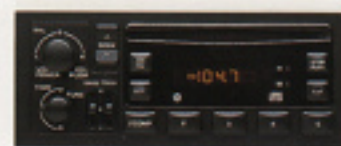
▲ An optional AM/FM stereo CD player features 100 watts of power plus eight premium speakers in six locations.