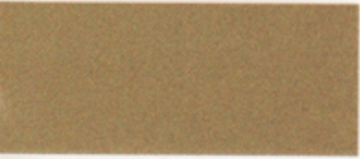
Light Gold Pearl Coat