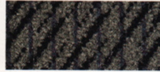
Pulsar cloth fabric (ES model only), shown in Silver Fern