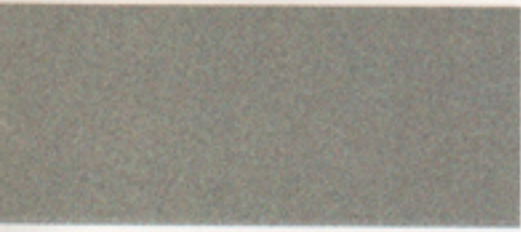
Light Silver Fern Pearl Coat