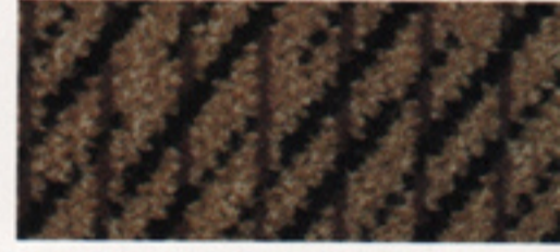
Pulsar cloth fabric (ES model only), shown in Camel