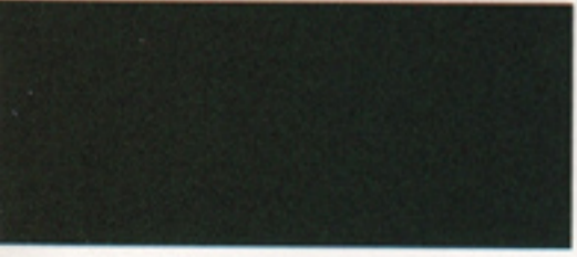
Forest Green Pearl Coat