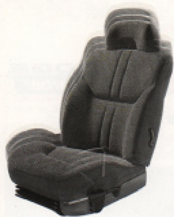
▲ The Stratus ES driver's seat (optional on Stratus) can be adjusted up or down for maximum comfort. Manually adjustable lumbar support individualizes the seat even more.