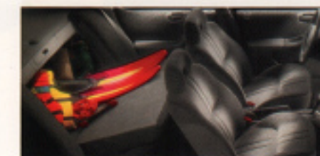
▲ Stratus' rear seatback folds down, providing increased cargo area.