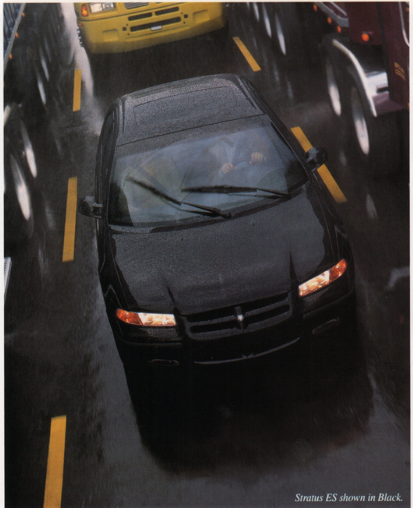
Stratus ES shown in Black.