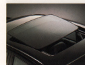
▲ Optional sunroof. From the closed or vent position, simply touch Stratus' available power sunroof control once to move it to its full open position. (Sunroof late availability.)