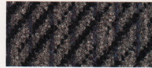
Pulsar cloth fabric (ES model only), shown in Mist Gray