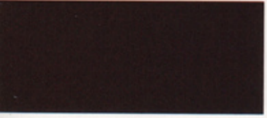
Dark Rosewood Pearl Coat