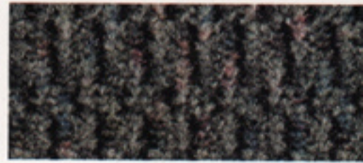
Joliett cloth fabric (Stratus model only), shown in Mist Gray