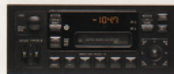
▲ An optional 100-watt AM/FM stereo cassette player offers eight premium speakers and is equipped with controls on the faceplate that operate the optional in-dash-mounted CD changer.