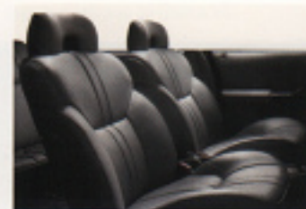
▲ Leather-trimmed seats and an eight-way power driver's seat are available as a package option on Stratus ES.