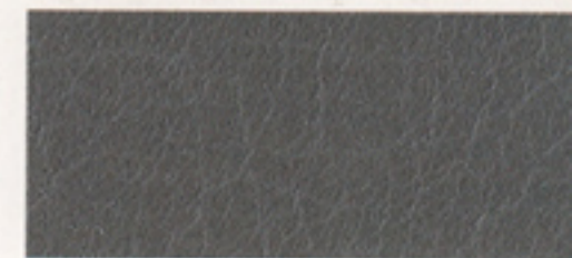
Leather trim (ES model only), shown in Mist Gray