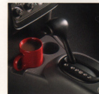
▲ A standard center console includes storage, two cup holders and a power outlet. An available Smoker's Package replaces the left cup holder with an ash receiver and adds a lighter to the power outlet.