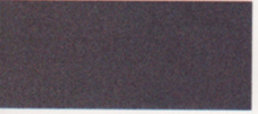
Orchid Pearl Coat