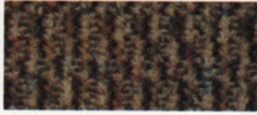
Joliett cloth fabric (Stratus model only), shown in Camel