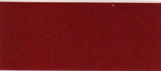
Candy Apple Red Metallic Tint