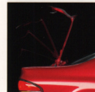
▲ Stratus' large trunk (15.7 cubic feet) features a low liftover for easy loading and unloading. Spring-operated hinges help by positioning the trunk lid up and out of the way.