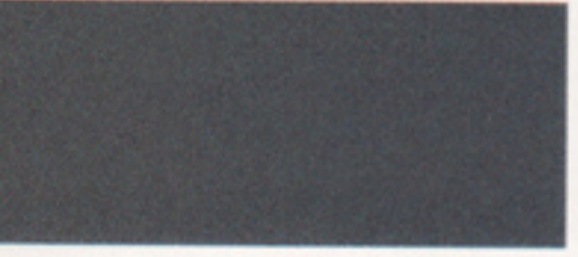
Light Iris Pearl Coat