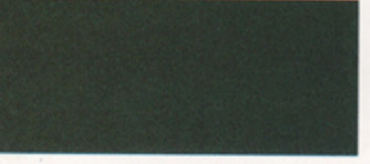
Medium Fern Pearl Coat