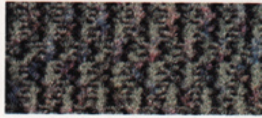
Joliett cloth fabric (Stratus model only), shown in Silver Fern