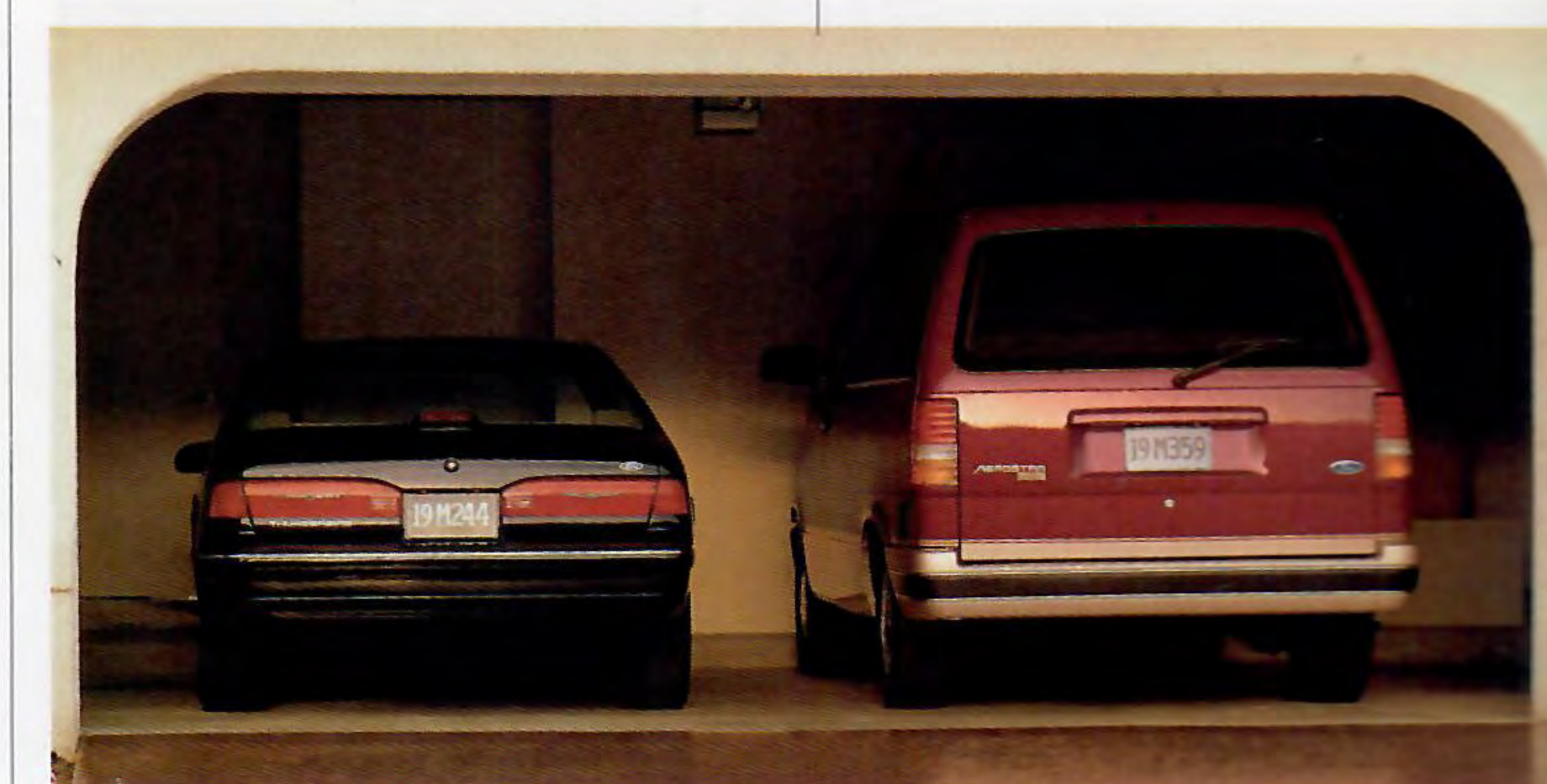
Sized-right Aerostar fits into most garages with sedan-like ease.