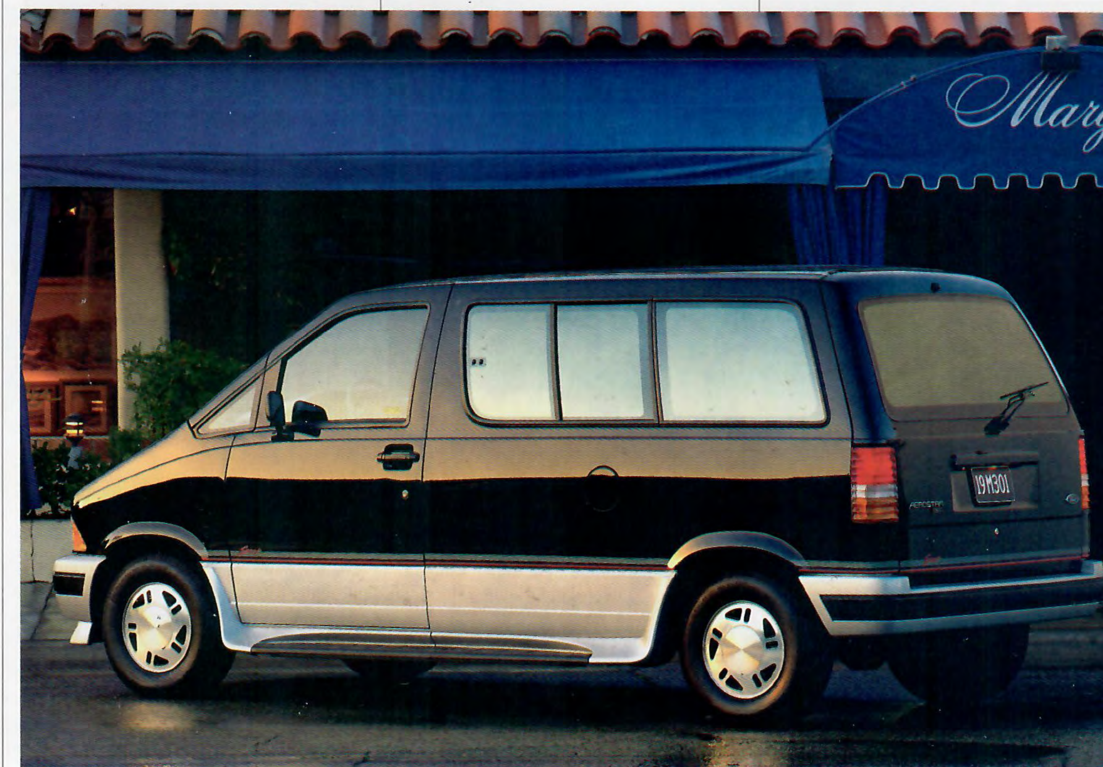
Top: Aerostar XL Plus with optional two-tone Electric Red Clearcoat Metallic with Medium Platinum Clearcoat accent.