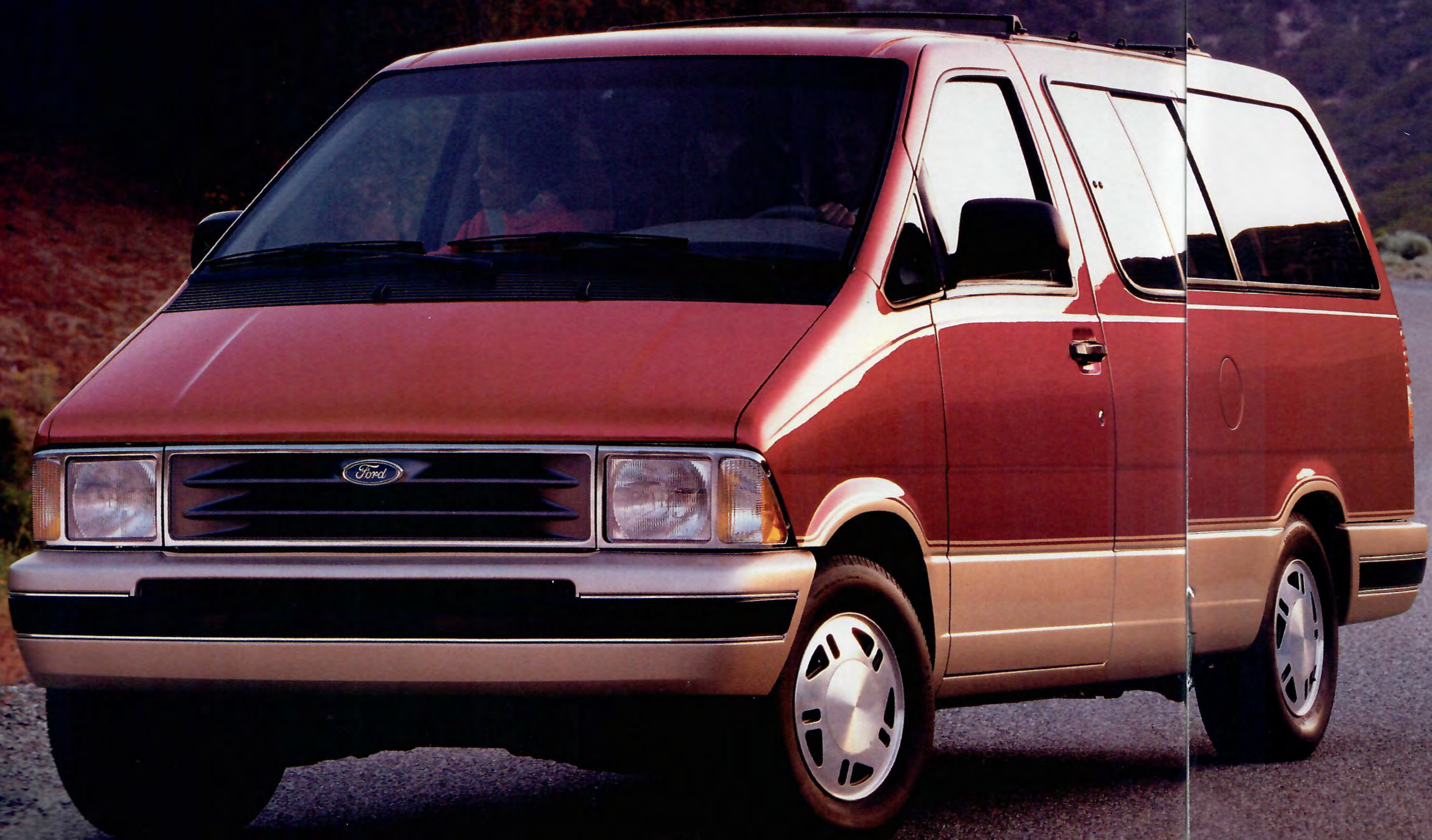
Left: The unique Eddie Bauer paint scheme includes a Mocha Frost Clearcoat Metallic lower accent, shown here with Electric Red Clearcoat Metallic. Additional upper body choices are Medium Mocha Clearcoat Metallic, Currant Red, Twilight Blue Clearcoat Metallic, Deep Emerald Green Clearcoat Metallic, Raven Black and Oxford White.

The Eddie Bauer is a very special Aerostar. The reclining captain's chairs feature power lumbar supports. The 2- and 3-passenger rear benches fold down to form a bed — ideal for overnight stops on trips (or choose the quad captain's chairs, available at no extra charge). Special cloth trim covers the seats. The floor mats are carpeted (front mats are monogrammed) and the steering wheel is wrapped in leather.