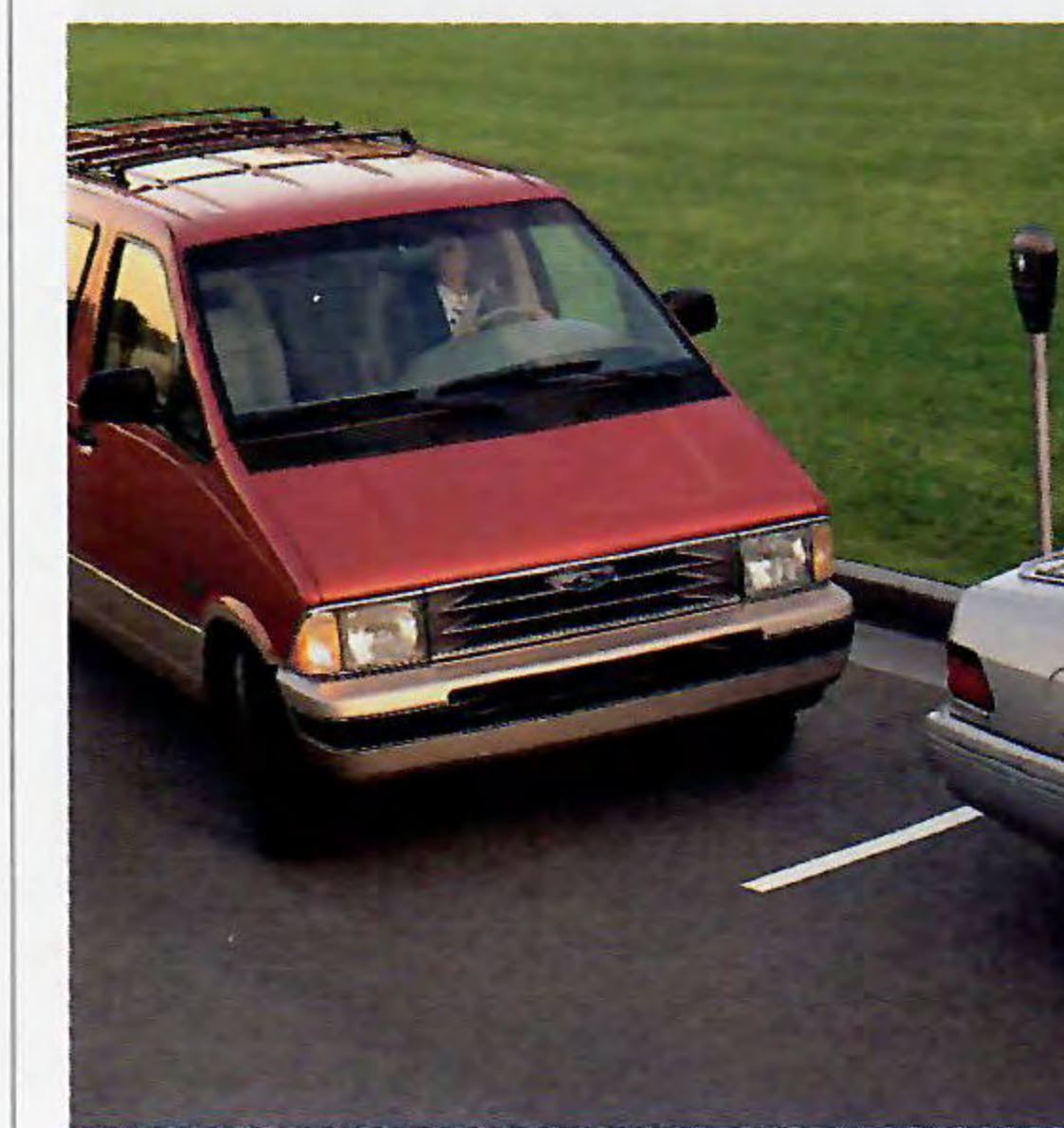
Regular-length Aerostar's compact exterior helps it get in and out of the tight spots — a big benefit when space is limited.

See the back cover for packages. Content is subject to change and your dealer is always your best source for current product information.