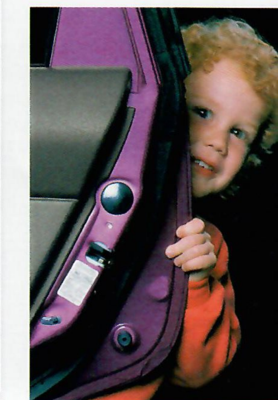
Above: Aspire 5-door models feature childproof locks in the rear doors which, when activated, prevent accidental opening.