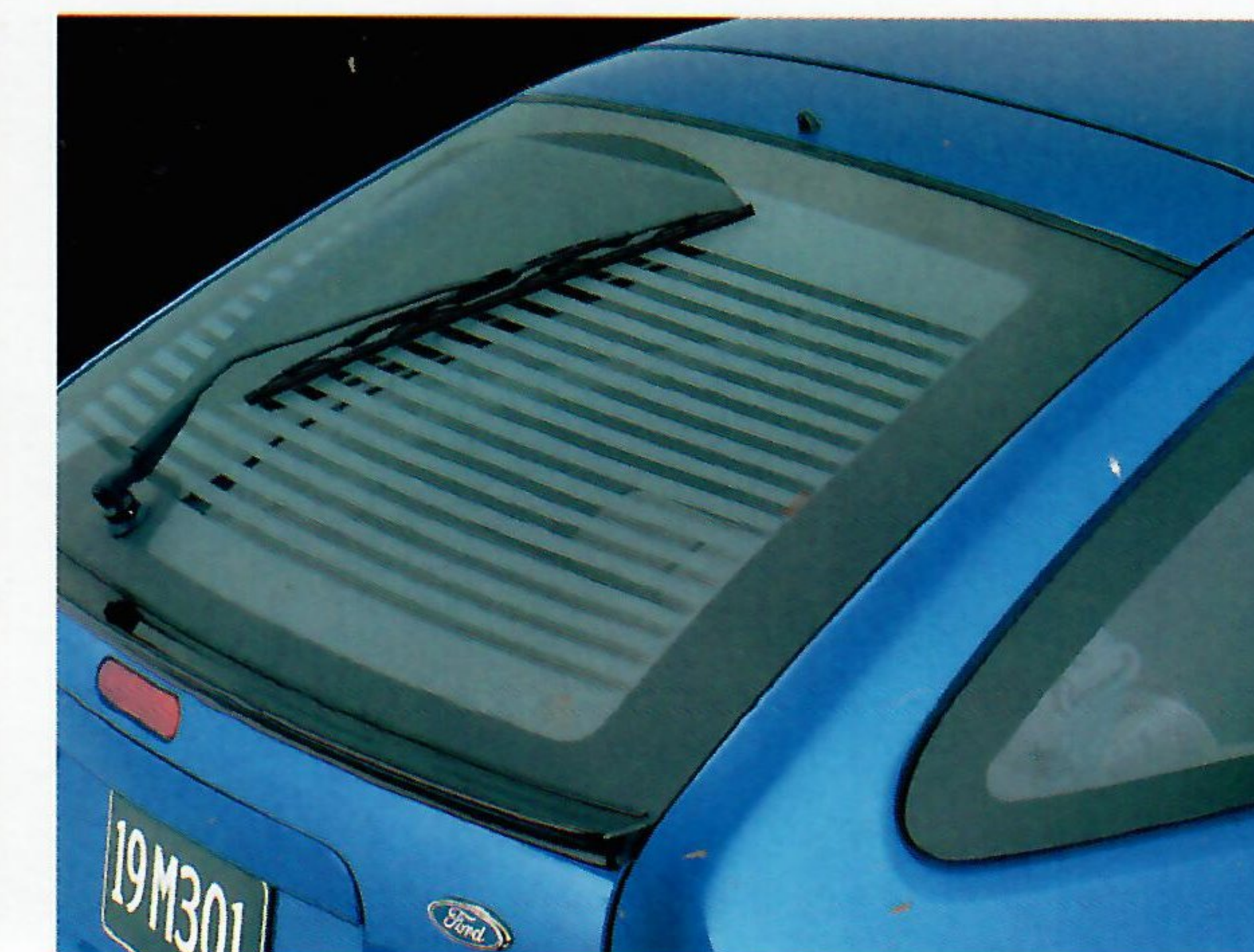
The optional rear window wiper/washer helps clear the view behind in inclement weather.