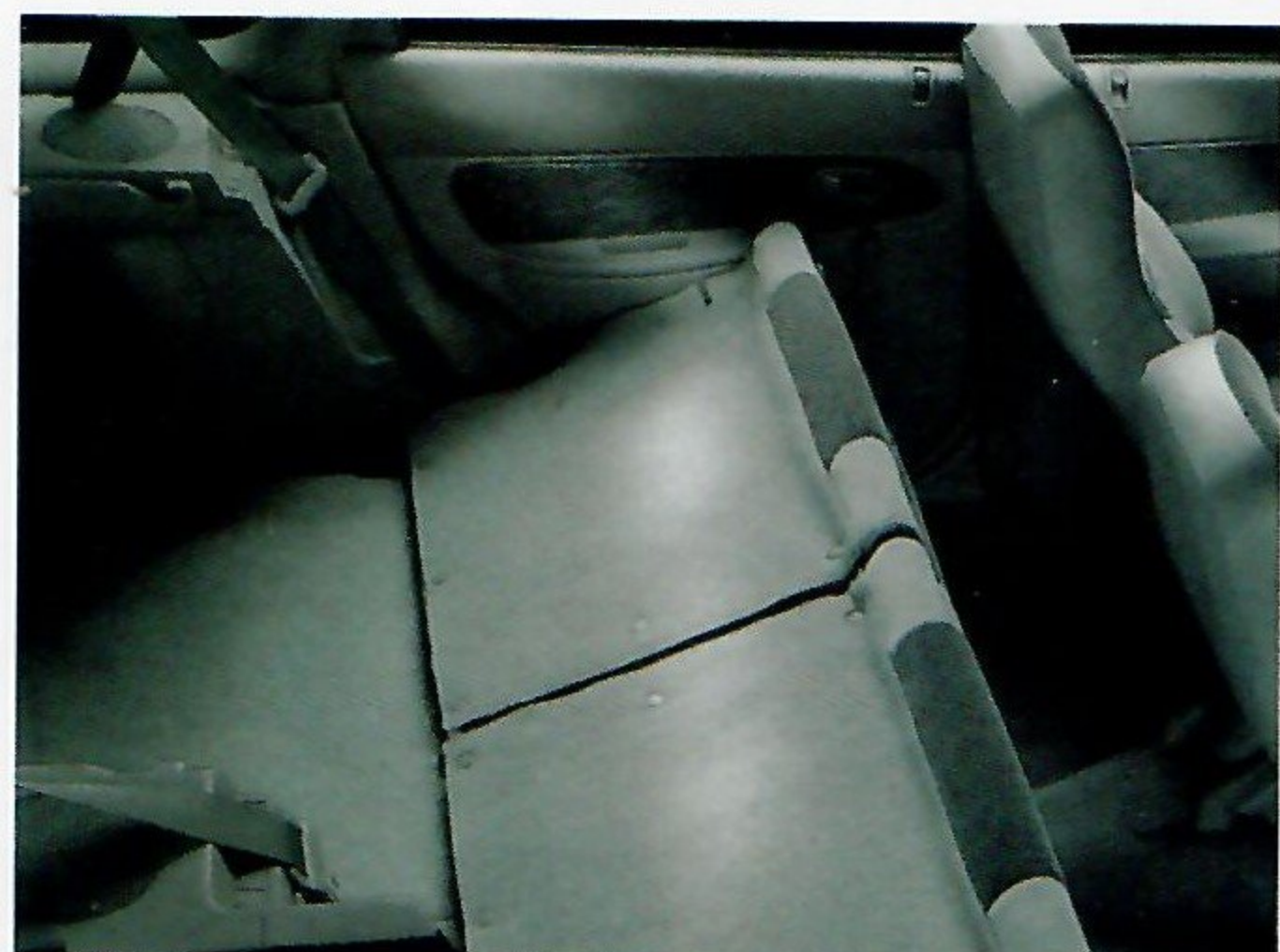
Aspire 3-Door's rear seat back (split seat backs in SE and with interior decor and convenience group) can be folded forward to accommodate stowage.