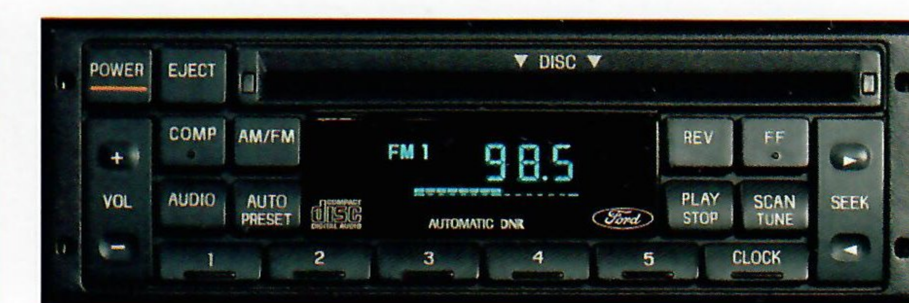
Enjoy the superb reproduction technology of digital sound with Aspire's optional AM/FM stereo radio with compact disc player.