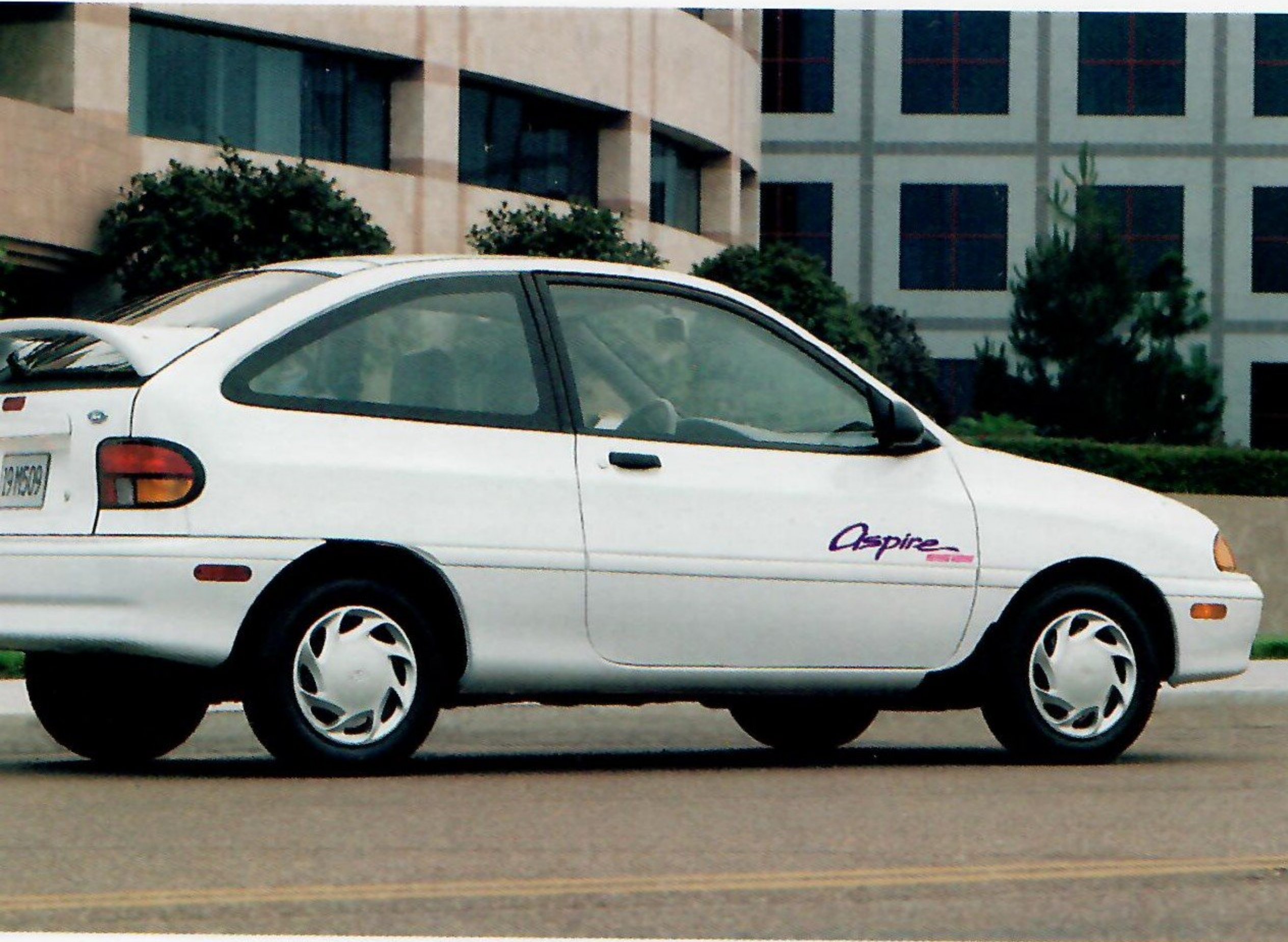
Aspire SE shown in Crystal White. The sport-minded 3-door features fog lamps and a rear spoiler.

pension includes a stabilizer bar to help prevent vehicle sway. The torsion-beam rear suspension (with a stabilizer bar built in) is engineered to maintain the proper camber angle whether turning or going straight. Its simple, space-efficient design also allows a low trunk floor for increased luggage capacity.