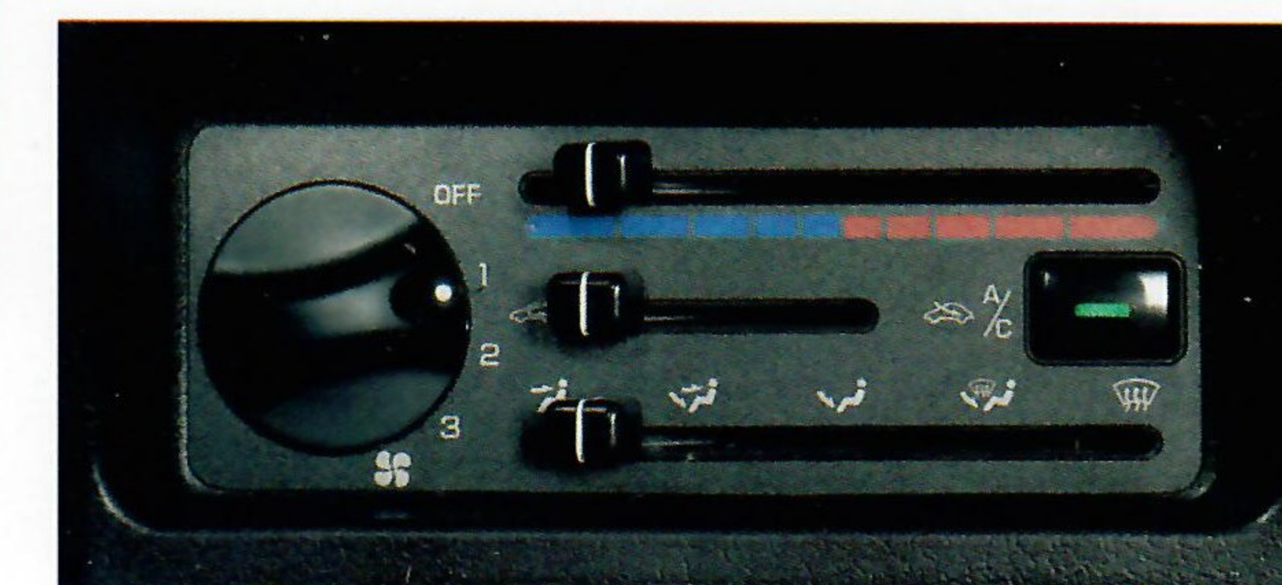
The cool comfort of air conditioning is optional with all Aspire models. And it's free of CFCs.