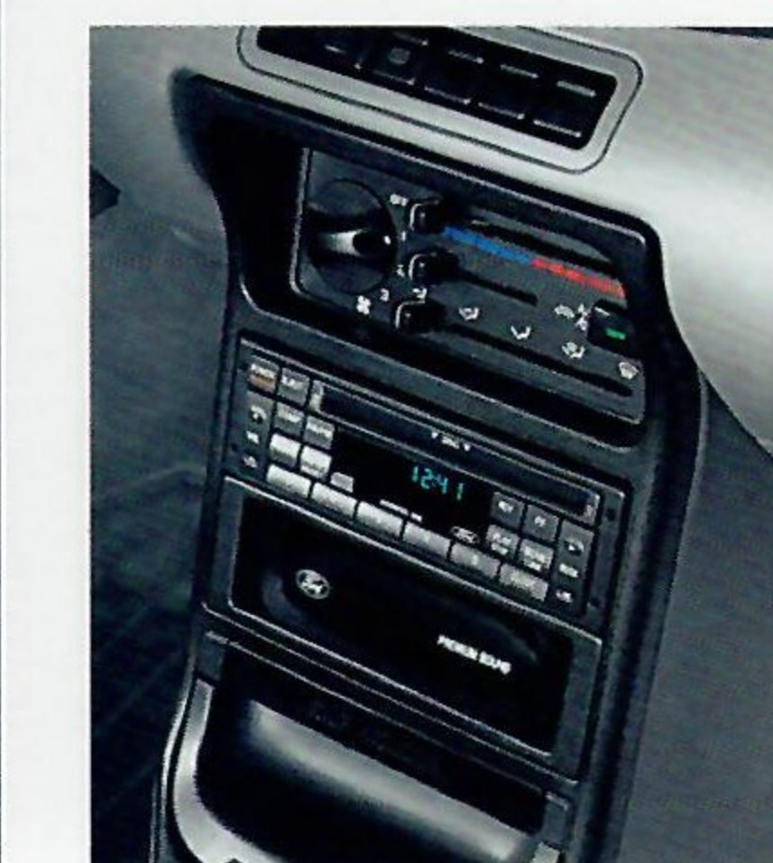
Shown above: The passenger seat back has a memory feature (3-door models) for personalized comfort (top). The standard full-length console features handy cup holders (center). Radio and climate controls are conveniently located in the console's front panel (bottom).

Another thoughtful feature is Aspire's optional air conditioning system. Available with all models, it's CFC free for the benefit of the environment. It helps to prevent further ozone depletion while it keeps things cool and pleasant for passengers.