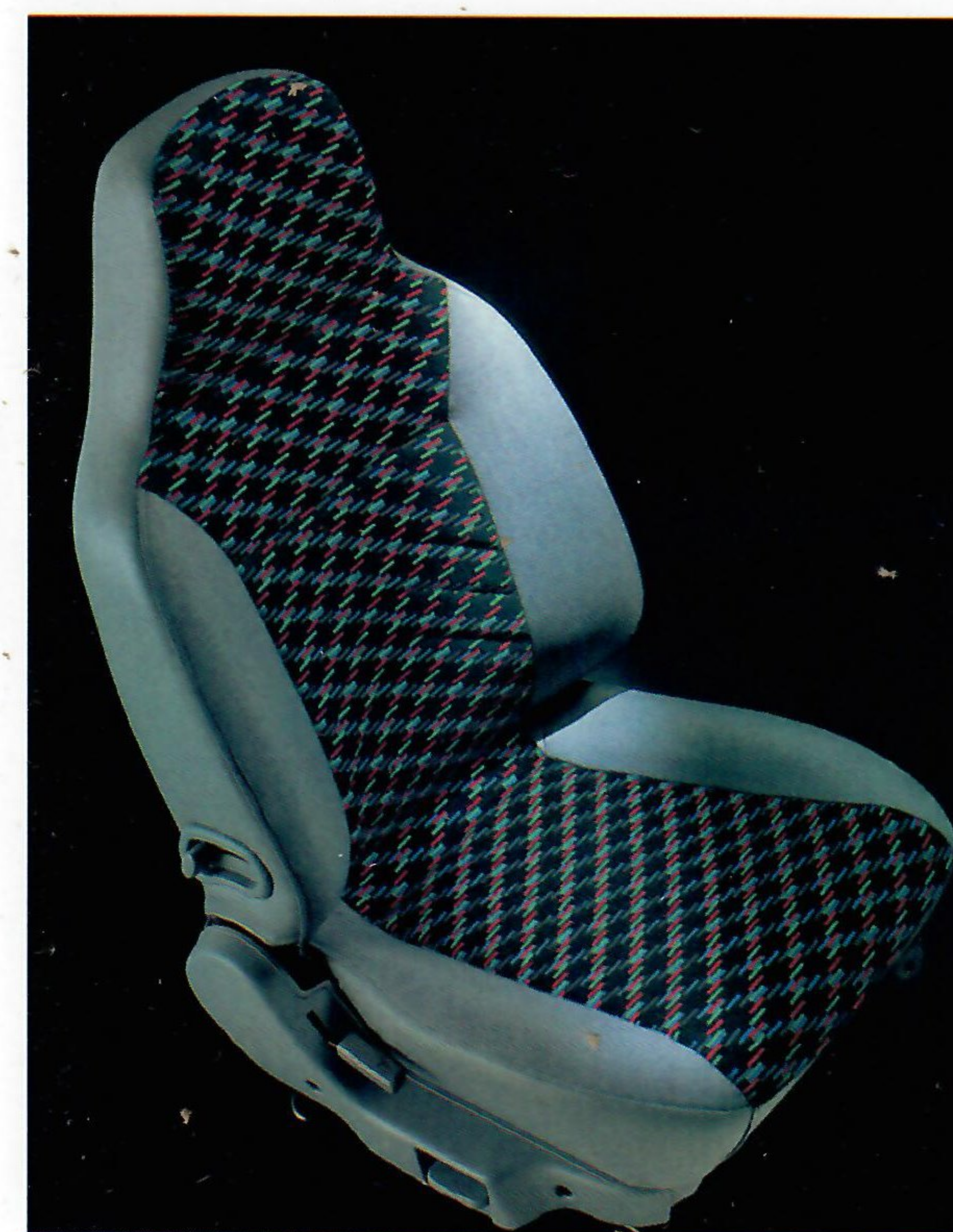
Aspire SE features front sport cloth and vinyl reclining bucket seats which include the convenience of a passenger-side memory seat back.

Color-keyed carpeting on floor and in luggage compartment Color-keyed luggage compartment with molded side trim Soft-feel shift knob Inside hood release Cigarette lighter and front and rear ashtrays Maintenance-free battery