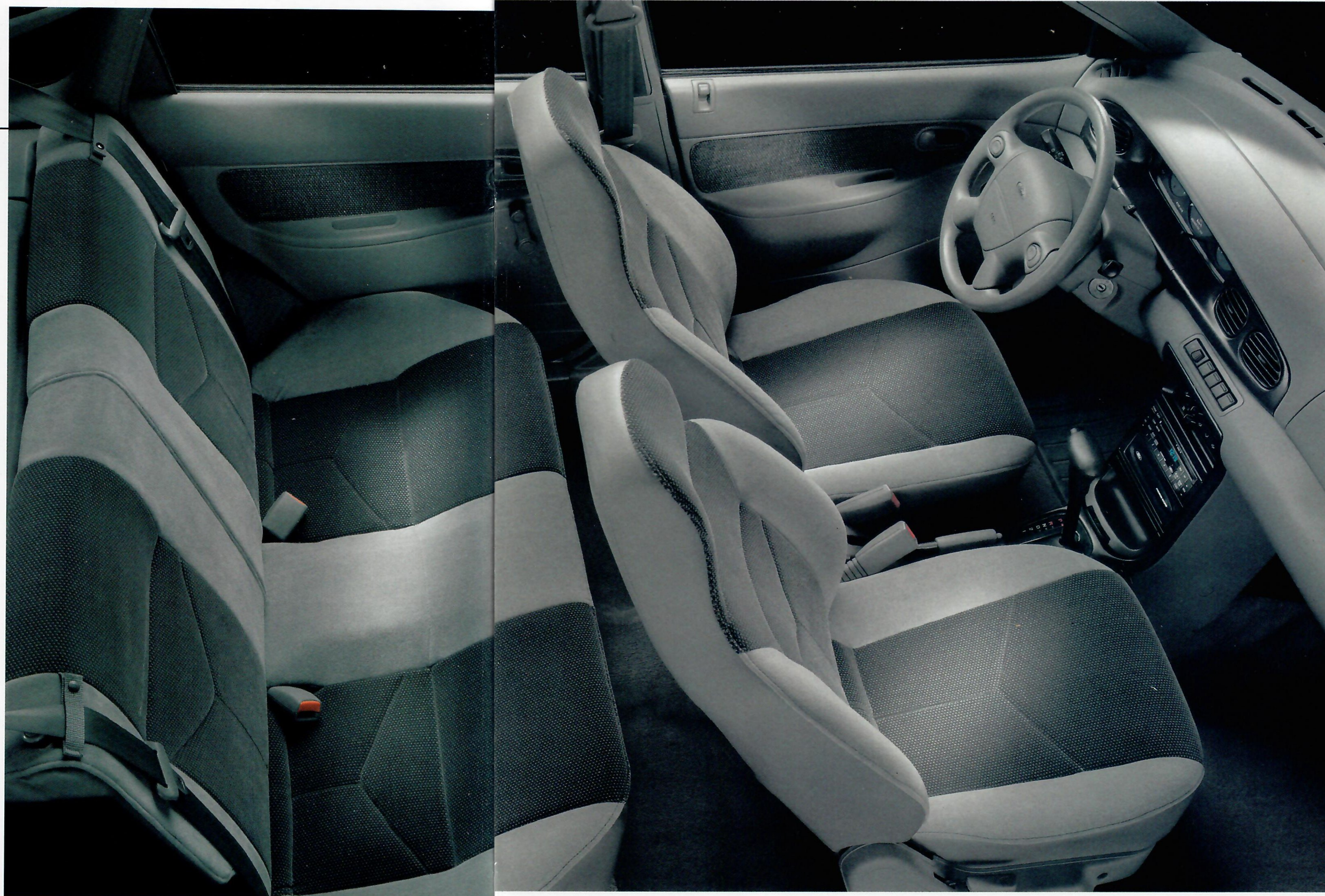
Left: Aspire interior shown with the interior decor and convenience group and other optional equipment.