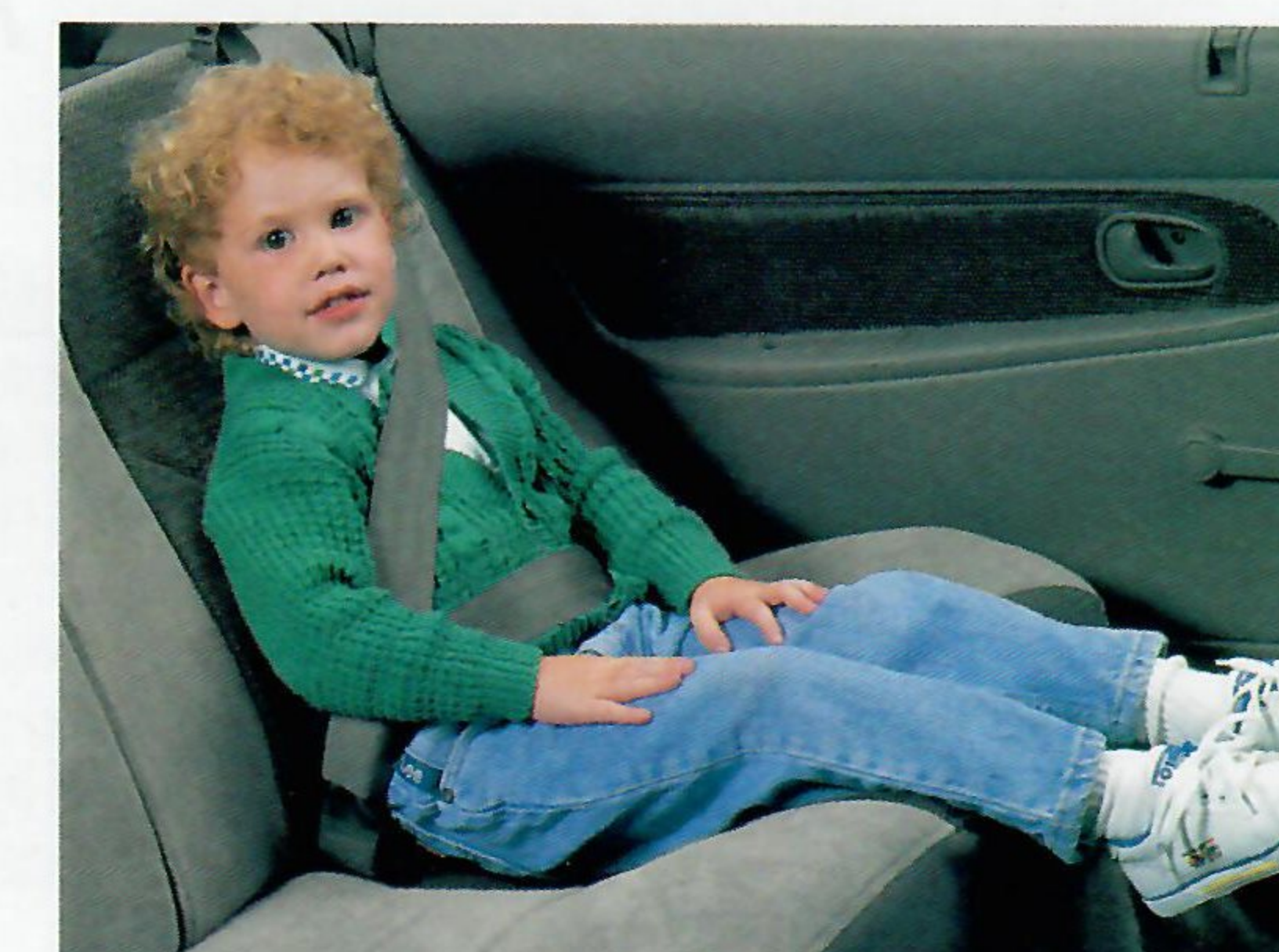
Rear seat passengers are provided full lap/shoulder safety belts which offer better overall protection than simple lap belts.

Aspire's "childproof" rear door locks on 5-door models help keep curious little fingers out of mischief. When the locks are activated, the rear doors can't be opened from inside. And as a measure to help increase visibility, Aspire is the first in its class to offer dual outside mirrors as standard.