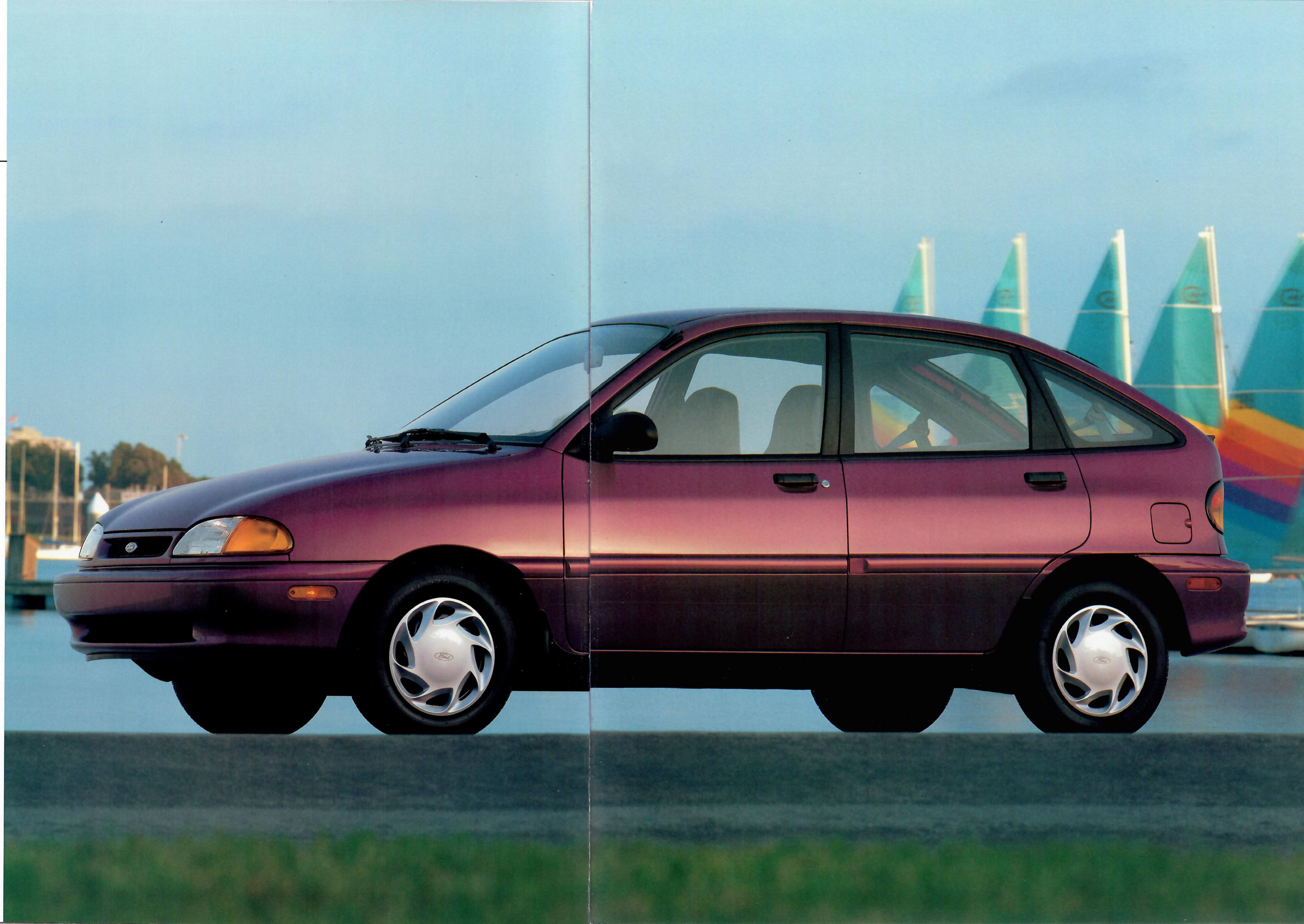
Aspire 5-Door in Wild Iris Clearcoat Metallic.