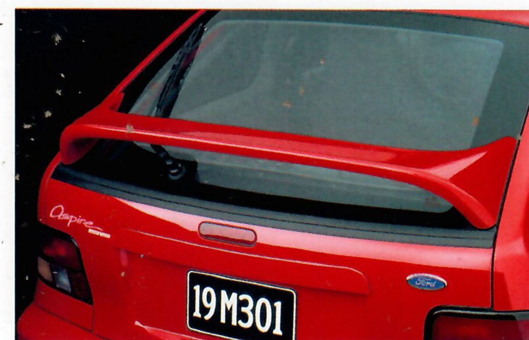
A rear spoiler complements the sporty flair of the Aspire SE.