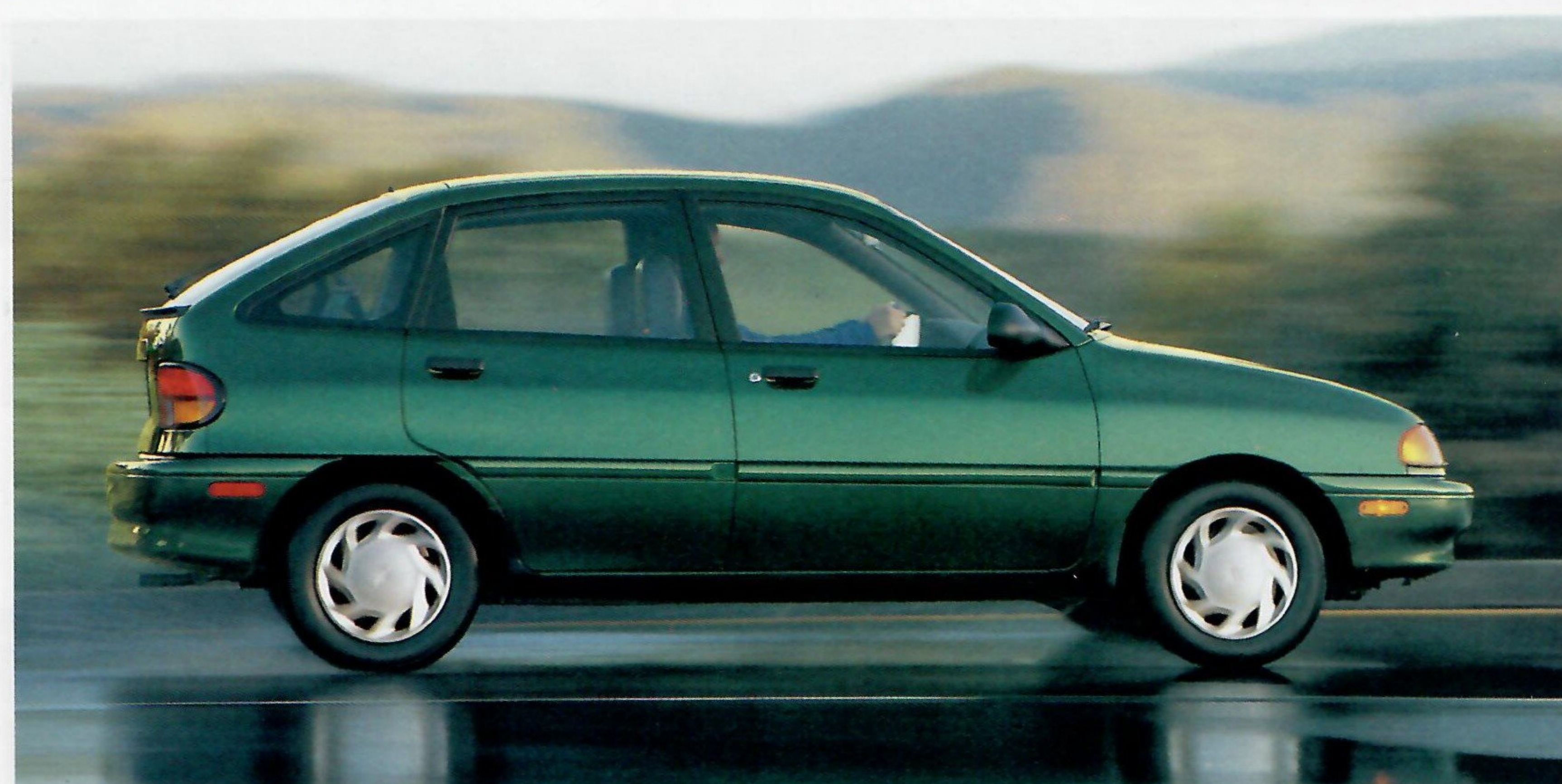
Front-wheel drive gives Aspire good traction in adverse driving conditions such as snow or mud. Optional anti-lock brakes help to provide more controlled stops when hard braking may otherwise cause the wheels to lock up.

released repeatedly in the same way you were probably taught to "pump your brakes." But the speed of the anti-lock braking system far exceeds human capability, providing the driver a much greater degree of steering control in hard braking situations on a variety of slippery surfaces.