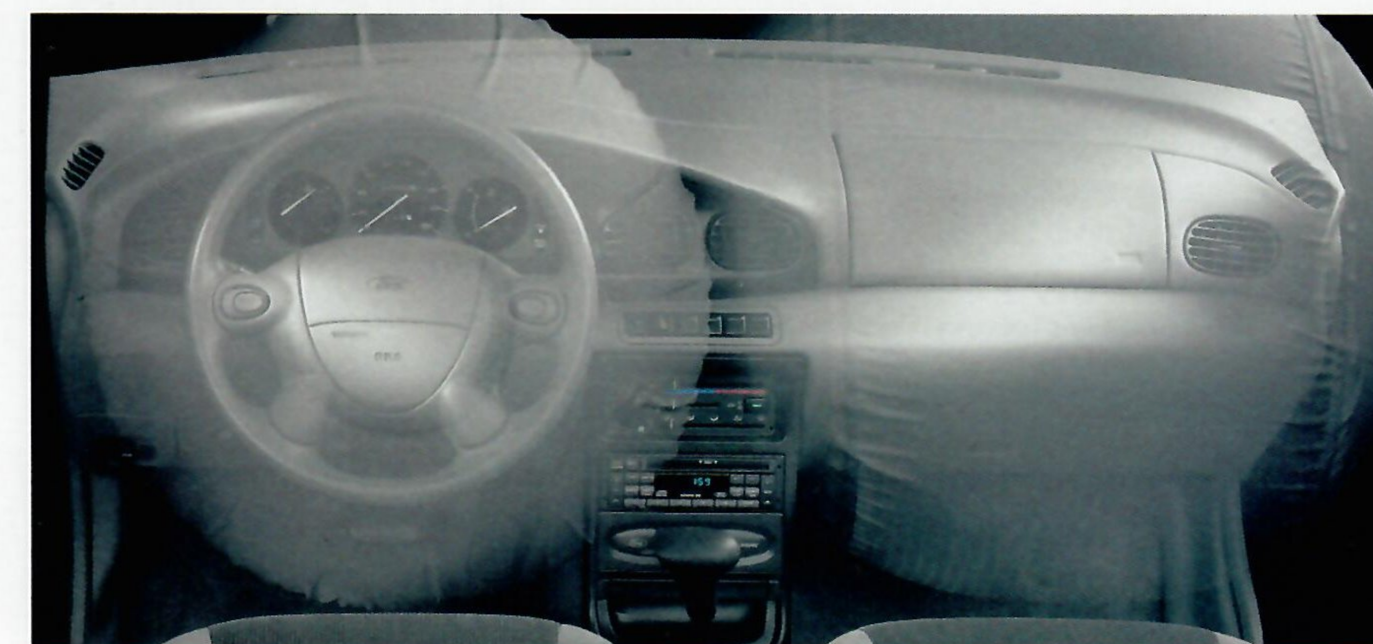
Right: The standard driver and front passenger air bag supplemental restraint system is provided for use in addition to the lap/shoulder belts. It's the first such system offered by an automobile in Aspire's class.

Another thoughtful feature is Aspire's optional air conditioning system. Available with all models, it's CFC free for the benefit of the environment. It helps to prevent further ozone depletion while it keeps things cool and pleasant for passengers.