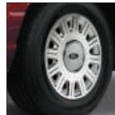
16" Deluxe Locking Wheelcovers Standard on Crown Victoria