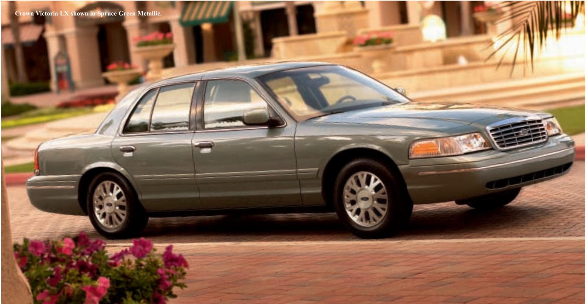
Crown Victoria LX shown in Spruce Green Metallic.

Today, it's rare to find "V8," "full-size" and "agile" in the same sentence, much less in the same luxurious car.