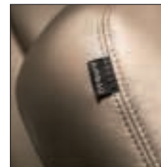
The new optional driver and front passenger side airbag supplemental restraint system enhances front-passenger protection.