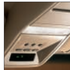
The new overhead console includes individual map lights, a compass, valet clip and sunglass storage.