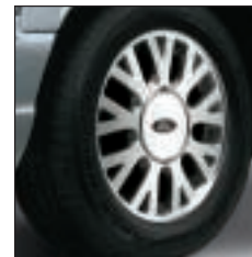
16" Alloy Wheels Standard on LX