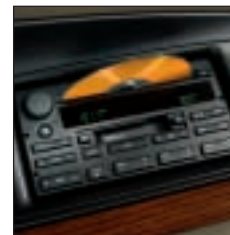
The new dual media AM/FM stereo sound system plays either a cassette or CD.