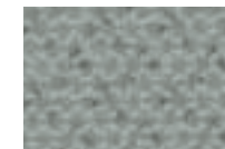
Light Flint Cloth