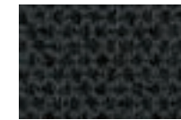
Dark Charcoal Cloth