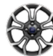
17" PAINTED MACHINED ALUMINUM Standard