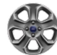
16" LOW-GLOSS MAGNETIC-PAINTED MACHINED-FACE ALUMINUM Standard