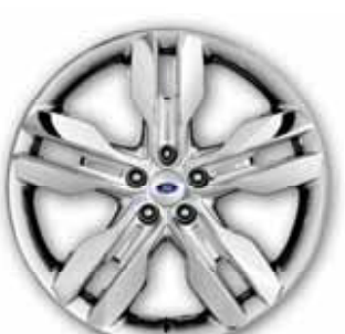
20-in. Chrome-Clad Aluminum Wheels Available