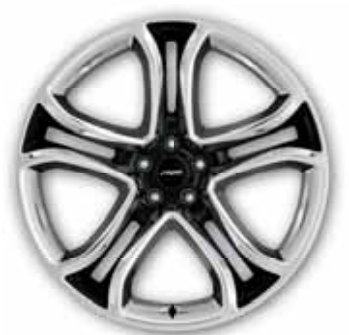
22-in. Polished Aluminum Wheels with Tuxedo Black Spoke Accents Standard

Colors are representative only. See your dealer for actual paint/trim options.