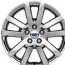
18" Chrome-Clad Aluminum Available on SEL