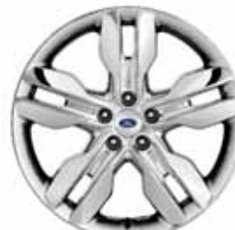
20" Chrome-Clad Aluminum Available on SEL