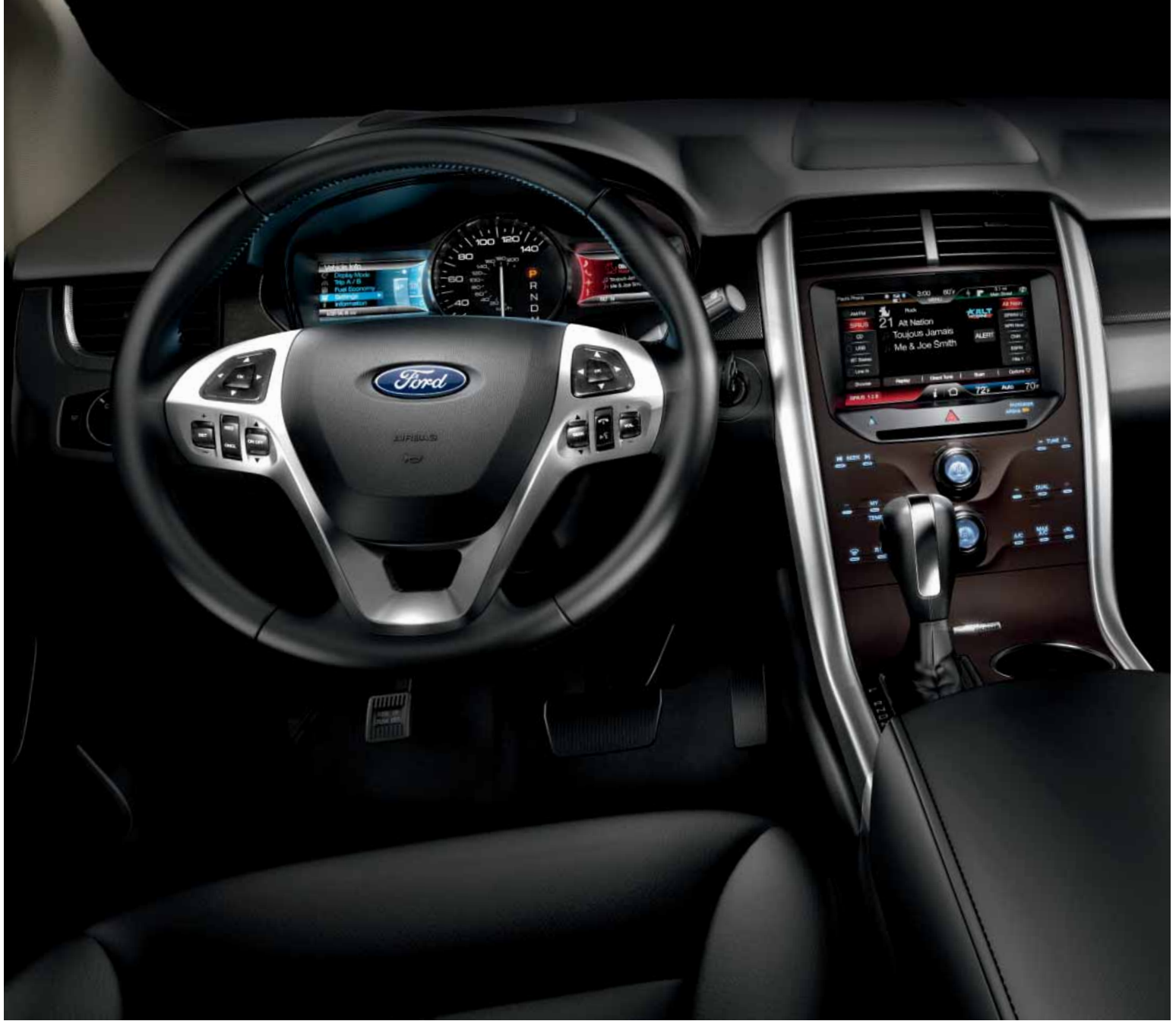
SEL. Charcoal Black leather trim. Available equipment. | 2.0L EcoBoost® I-4 engine! | MyFord® 4.2" color LCD display. | SEL. Charcoal Black cloth trim. | 12-volt powerpoint, one of 4 in Edge.