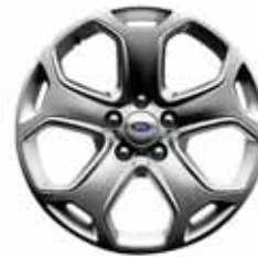
18" Painted Aluminum Standard on SEL