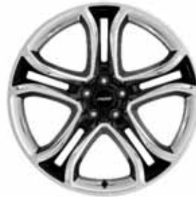
22" Polished Aluminum with Black Spoke Accents Standard