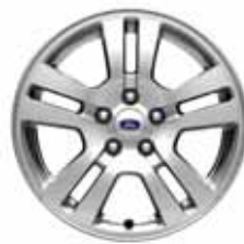
17" Painted Aluminum Standard on SE