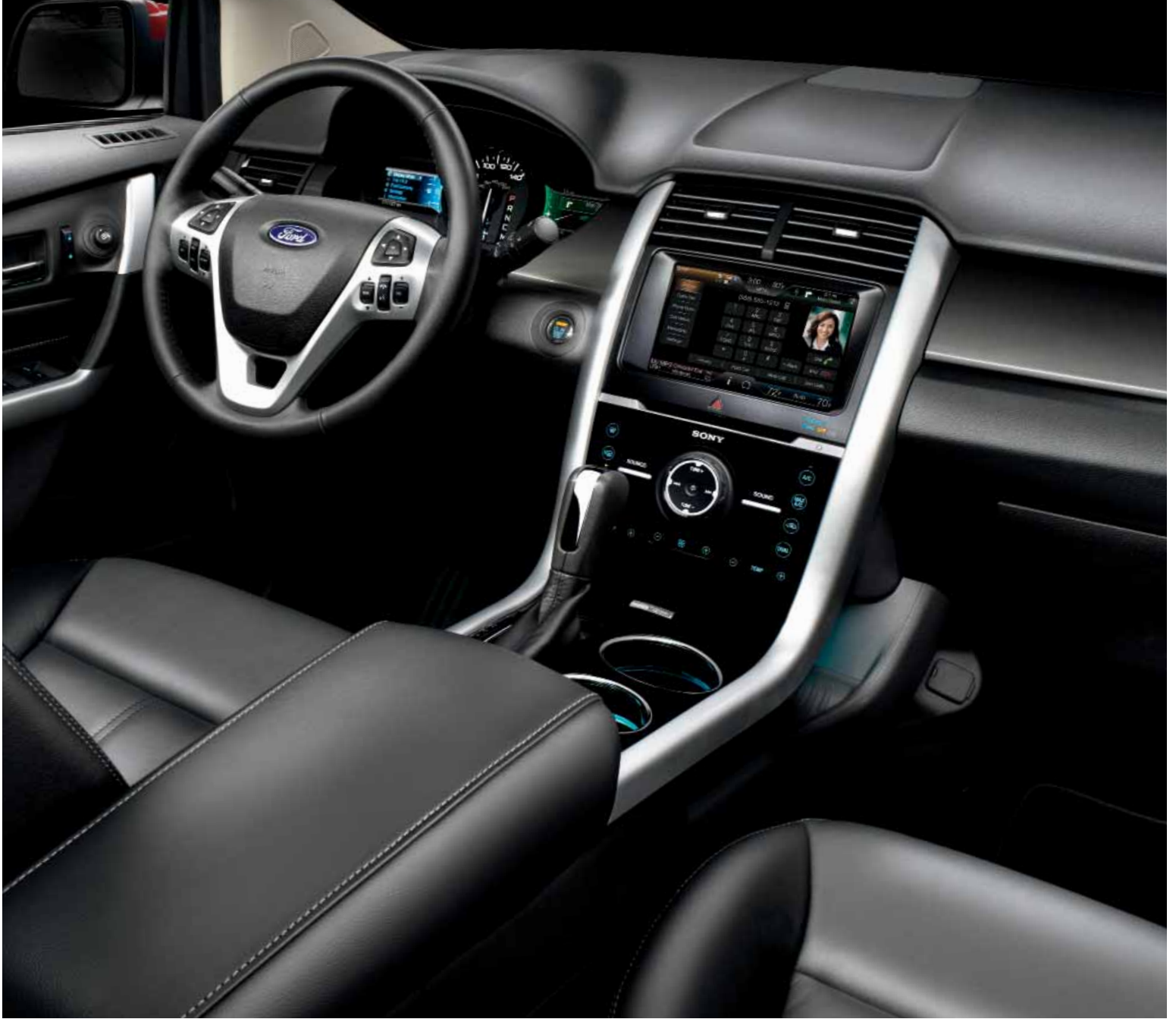
Charcoal Black leather trim. Available equipment. | Ambient lighting. | Chrome, oval exhaust tips. | Paddle shifters.