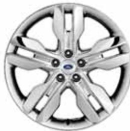
20" Chrome-Clad Aluminum Available