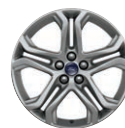
19" Premium Luster Nickel- Painted Aluminum Standard