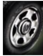
17" Steel Wheel Standard with Chromed-Clad Finish on NBX (Shown)

**Always wear your safety belt and secure children in the rear seat. †Requires leather-trimmed seats and 1st-row captain's chairs. ††Requires premium stereo with 6-disc in-dash CD changer and 1st-row captain's chairs. ‡Requires Safety Canopy™ System and 1st-row captain's chairs.