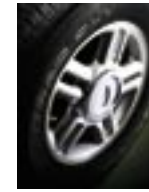
17" Bright Alloy Wheel