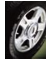
17" Machined Alloy Wheel