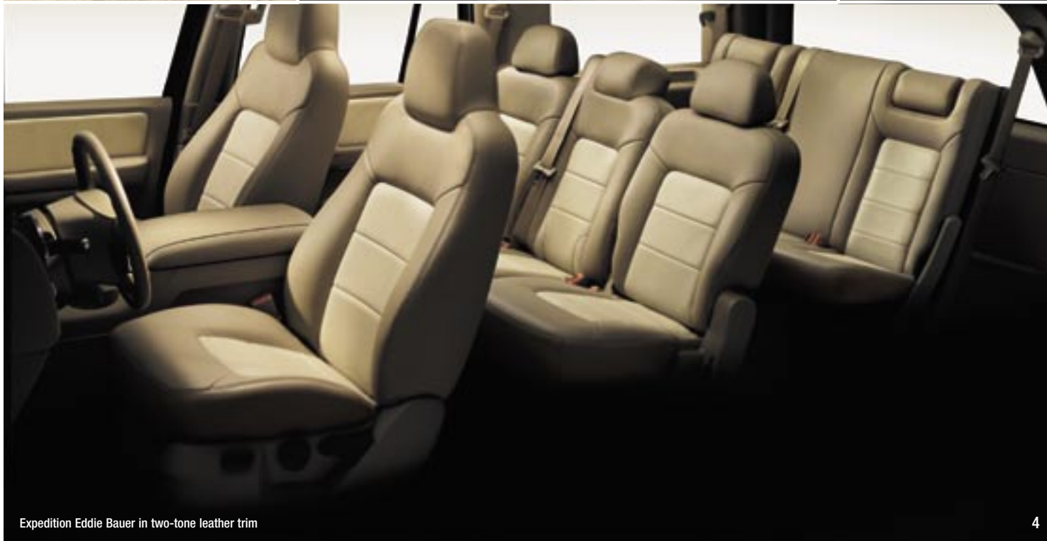
Expedition Eddie Bauer in two-tone leather trim

1 The first-in-class, double-wishbone, fully Independent Rear Suspension allows each wheel to respond to the road independently, deliver a smooth ride and precise handling. 2 No other full-size SUV offers an available PowerFold™ third-row seat which disappears into the floor at the touch of a button. 3 The available AdvanceTrac® Electronic Stability Enhancement