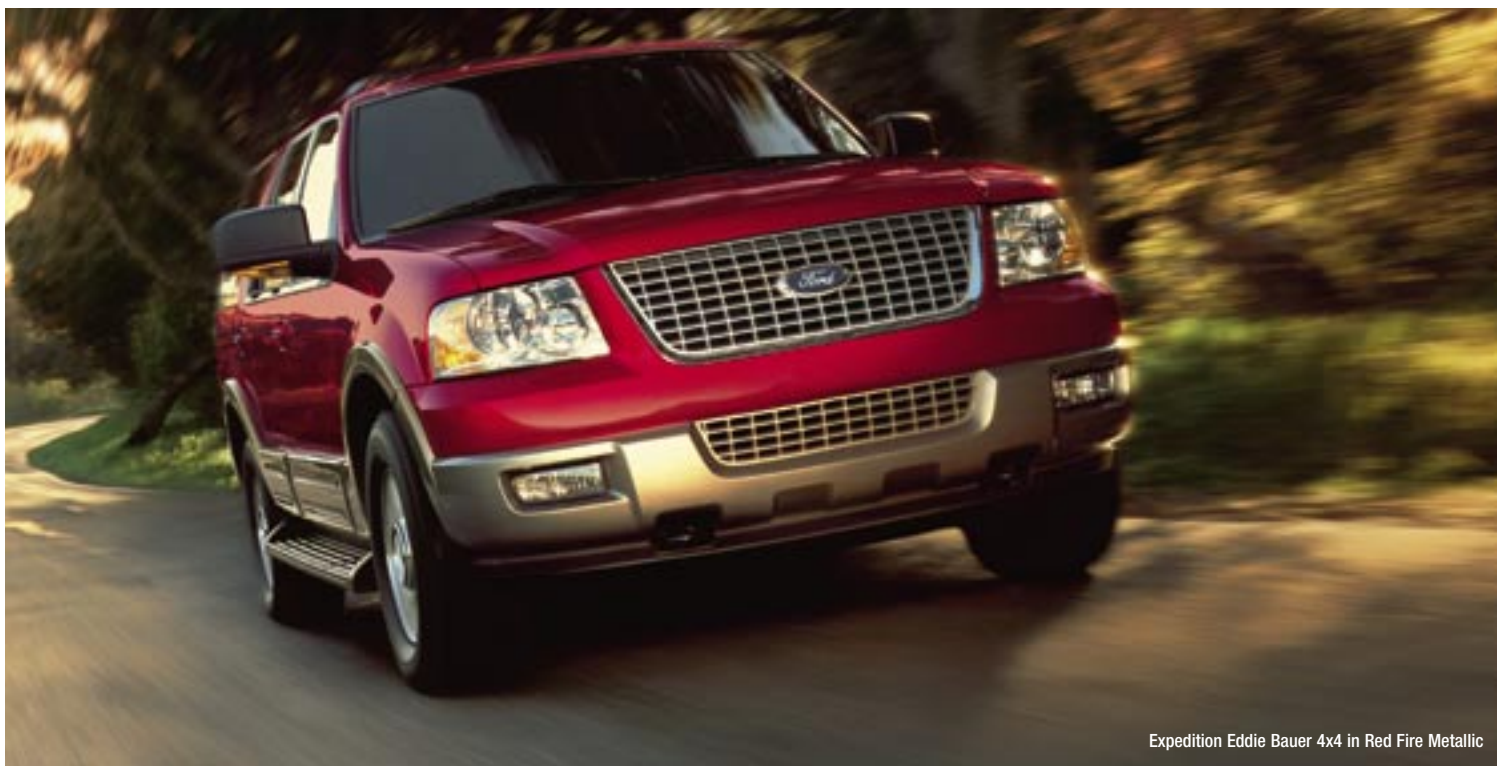
Expedition Eddie Bauer 4x4 in Red Fire Metallic

But there's more to being a Ford owner than just driving a great vehicle. There are perks like the My Ford owner website where you can manage all of your vehicle information in one place. Register today at www.fordvehicles.com . Come in for a test-drive today and see how Expedition is flexible enough to fit any lifestyle.