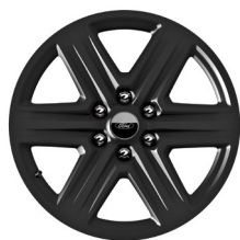
20" 6-SPOKE GLOSS BLACK-PAINTED ALUMINUM Optional 3 Not available with 302A, or Stealth Edition (303A), FX4 Off-Road, Special Edition or Texas Edition Packages