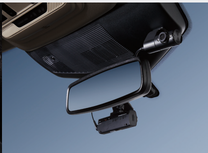
Dash cam systems 1

SHOP THE COMPLETE COLLECTION | accessories.ford.com