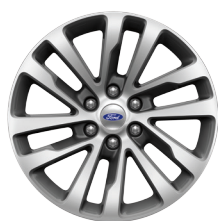
20" PREMIUM DARK TARNISH-PAINTED ALUMINUM Standard

Voice-Activated Touchscreen Navigation System with pinch-to-zoom capability (includes SiriusXM Traffic