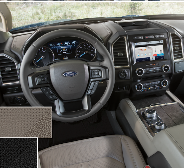
LEATHER-TRIMMED SEATING SURFACES: Medium Stone, Ebony