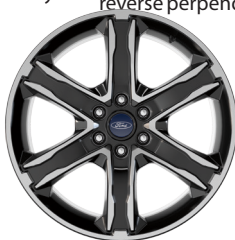
22" PREMIUM BLACK-PAINTED ALUMINUM Included with Stealth Edition (303A), Special Edition and Texas Edition Packages