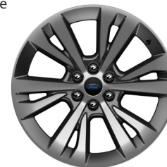
22" 6-SPOKE PAINTED MACHINED-FACE ALUMINUM WITH DARK TARNISH- PAINTED POCKETS Standard

Heavy-Duty Trailer Tow Package: heavy-duty radiator, Pro Trailer Backup Assist™ 3.73 electronic limited-slip rear differential (eLSD), integrated trailer brake controller, and 2-speed automatic 4WD (4x4 only) with Neutral towing capability 2nd-row power-folding tip-and-slide captain's chairs 4-wheel drive (4WD) (includes 1-speed transfer case, Terrain Management System™, Hill Descent Control and front tow hooks) Dual-Headrest Rear Seat Entertainment System 4 Engine block heater Floor liners for 1st and 2nd rows Reversible