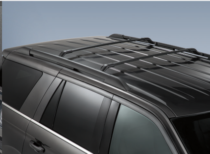
Roof crossbars 2