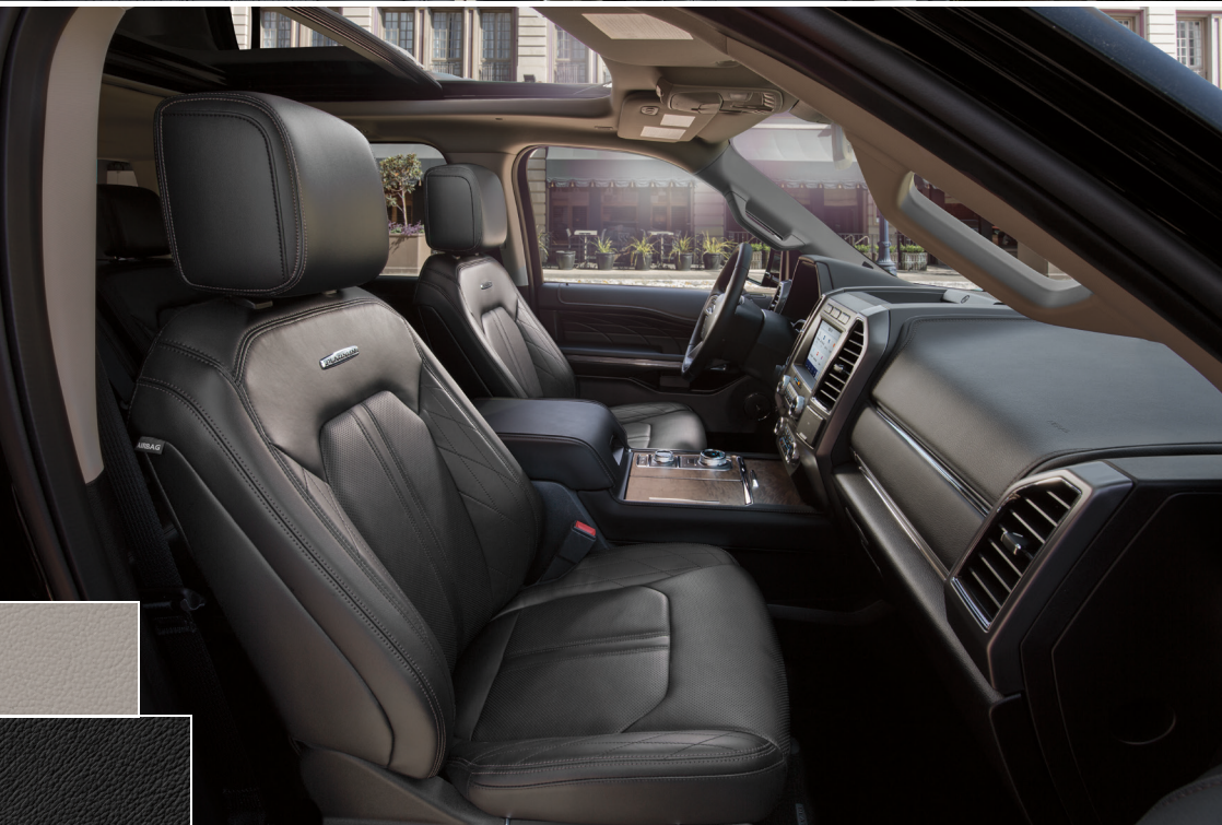
LEATHER-TRIMMED SEATING SURFACES: Medium Soft Ceramic, Ebony

ENHANCED 3.5L ECOBOOST V6 WITH AUTO START-STOP TECHNOLOGY 10-SPEED AUTOMATIC TRANSMISSION