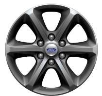
18" MAGNETIC-PAINTED CAST-ALUMINUM

Always consult the owner's manual before off-road driving. Follow all laws and drive on designated off-road trails and recreation areas.