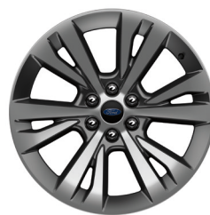
22" 6-SPOKE PAINTED MACHINED-FACE ALUMINUM WITH DARK TARNISH-PAINTED POCKETS Included with 302A