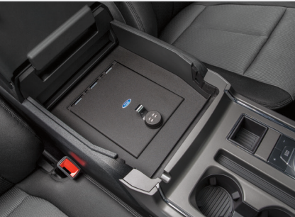
In-vehicle safe 1

Expedition MAX Platinum in Rapid Red Metallic Tinted Clearcoat accessorized with hood deflector, side window deflectors, 1 splash guards, 1 roof crossbars, and