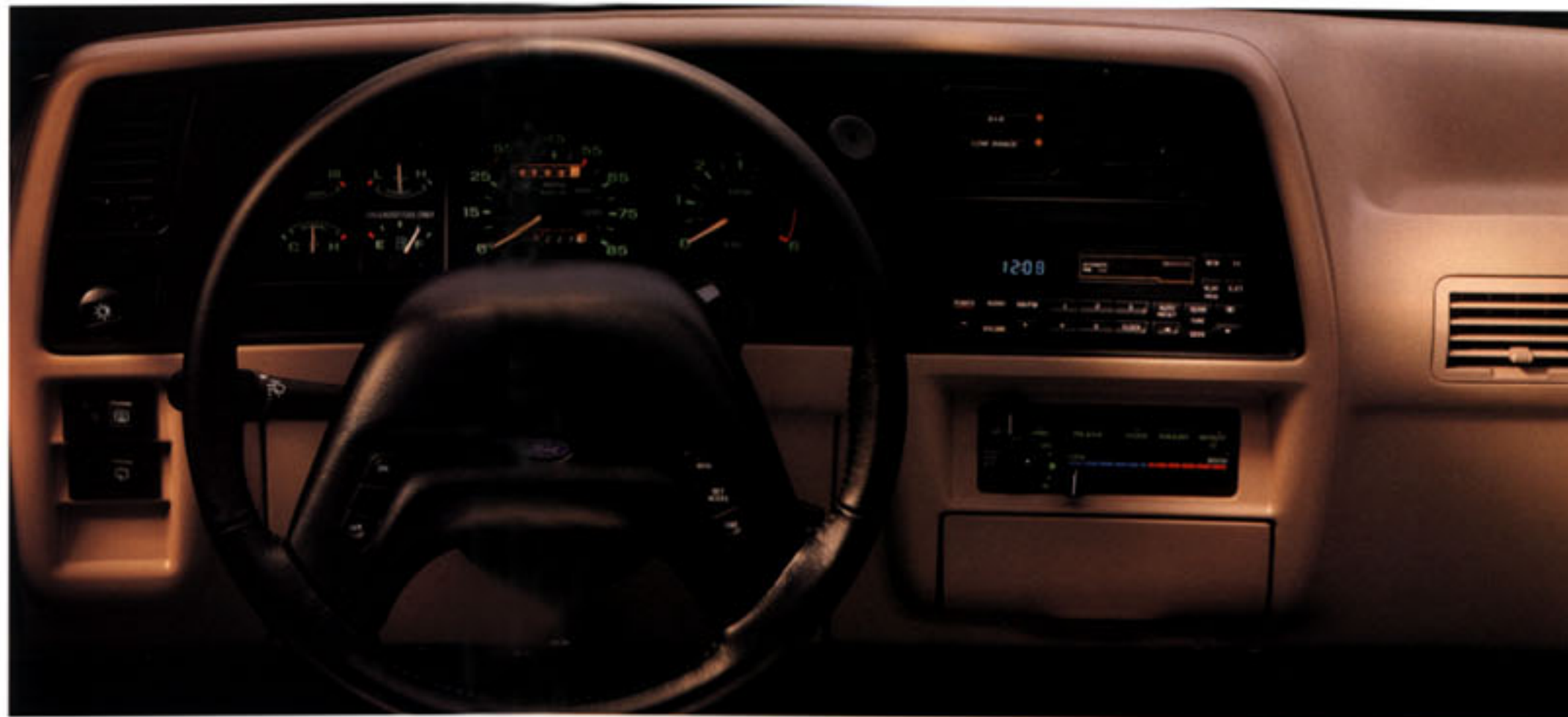
At left: The ergonomic instrument cluster includes a full gauge package including tachometer. In a pod to the right of the cluster are (1) the Touch Drive 4x4 control module; (2) the stereo system; and (3) the heating/cooling/defroster controls.

Some equipment shown on these pages is optional.