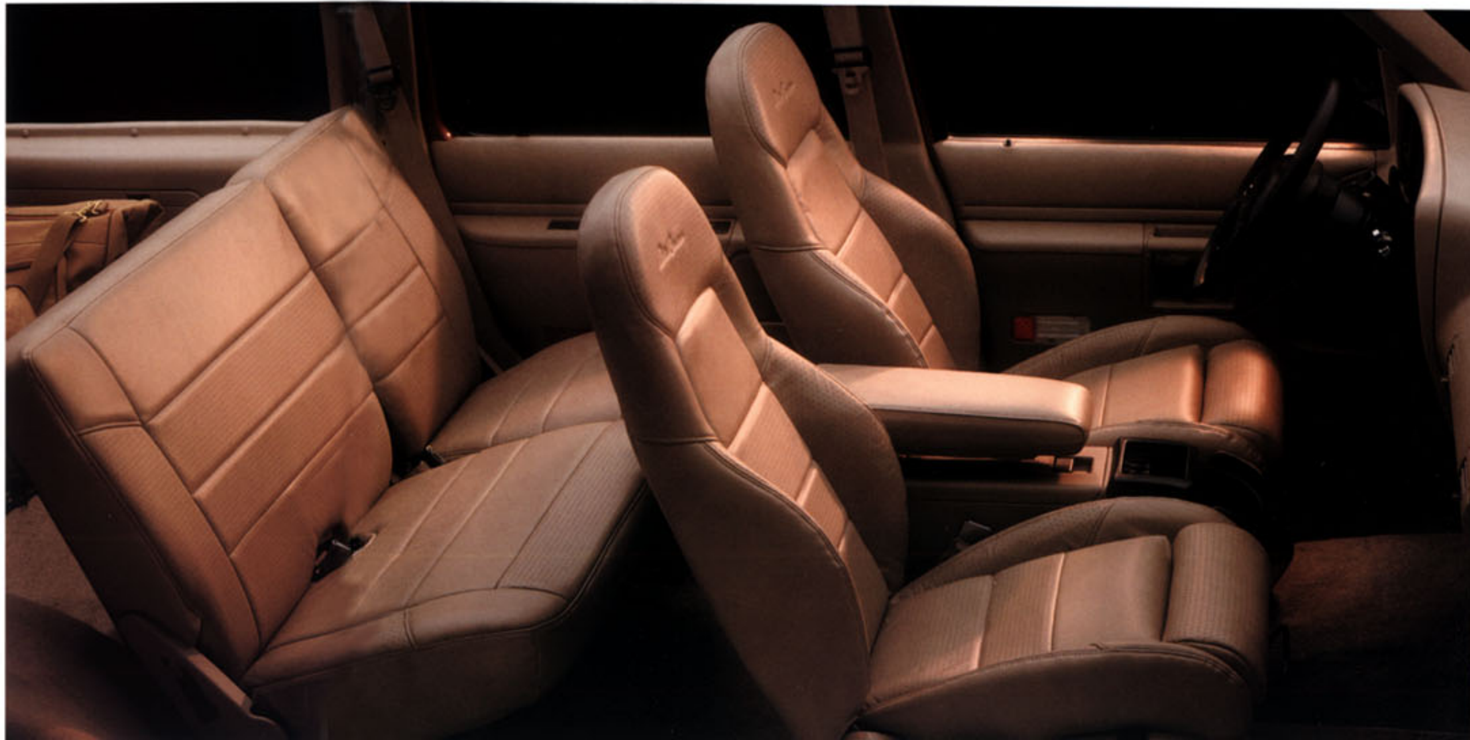
Below: The Eddie Bauer 4-Door interior with reclining sport bucket seats and leather seating surfaces. Garment and duffel bags are shipped to you from Eddie Bauer.

Some equipment shown on these pages is optional.