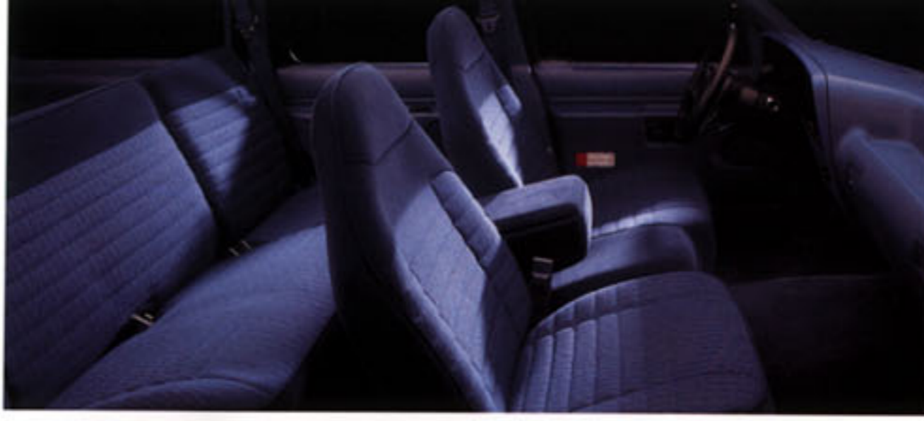
Left: Explorer XLT interior in Royal Blue with Preferred Equipment Package 941A and optional 3-passenger 60/40 split bench front seat.