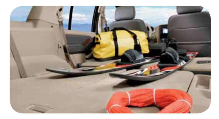
Explorer's 7-passenger models now feature a Flatter Loadfloor than many key competitors.* And with its 2nd- and 3rd-row seats folded flat, this Explorer can carry up to 83.7 cu. ft. of cargo.

Built to handle just about anything you can dream up, the new 2006 Explorer is ready for your next adventure. After a long day of activity, you'll be especially thankful for its all-new rear liftgate. It's so light and easy to operate that it can be closed with just one hand. A flip-open rear window makes packing small stuff easy, while the power lock/unlock button in the rear cargo area allows you to secure the vehicle in an instant.