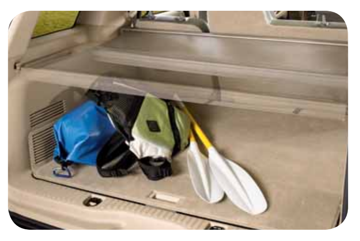
Explorer's Rear Cargo Shade, available on all 5-passenger models, is perfect for storing things away from prying eyes and keeping appearances tidy. With the rear seat folded down, 5-passenger models can handle up to a whopping 85.8 Cu. Ft. of gear - just imagine the possibilities.

Cargo and load capacity limited by weight and weight distribution. *As compared to Chevy TrailBlazer, Dodge Durango, Honda Pilot, Nissan Pathfinder and Toyota 4Runner.