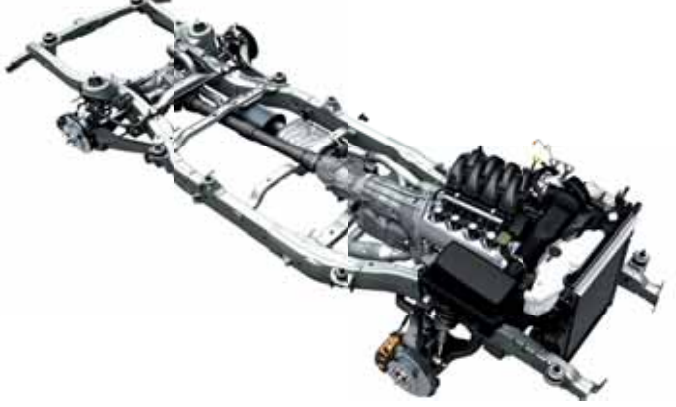
The 2006 Explorer's All-New, Fully Boxed Frame is a remarkable 63% stiffer than previous models. This solid foundation works with Explorer's refined powertrains and redesigned 4-wheel independent suspension (including new monotube shocks) to help deliver a smoother, quieter ride than ever.