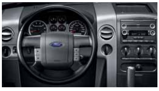
FX4 Gauge Group