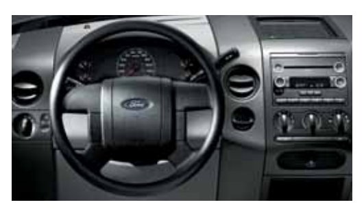
XL Gauge Group