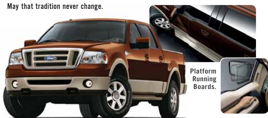
F-150 KING RANCH in Mahogany/Pueblo Gold two-tone with optional equipment.