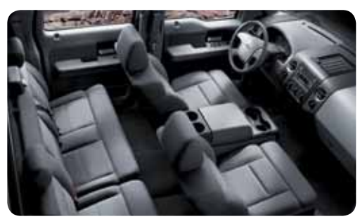
Step up to optional premium cloth captain's chairs with driver manual lumbar and center console.