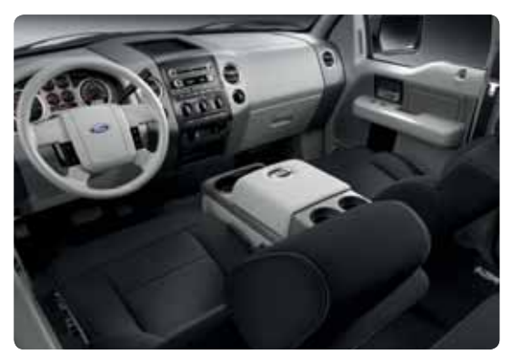
60<sup>TH</sup> ANNIVERSARY EDITION interior with front Black Sport Cloth captain's chairs and center console with optional equipment.