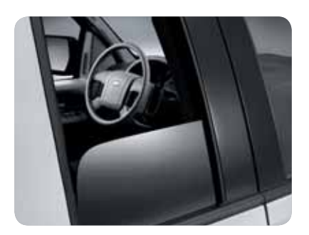
F-150 was the first pickup to offer 2nd-row power windows on a SuperCab.

HAVE IT YOUR WAY. XLT simply gives you the most flexibility in the F-150 lineup, along with an impressive list of standard features. It's available with every cab size, body style, box size and engine option, in 4x2 or 4x4. From the exclusive 4-door Regular Cab, to the spacious SuperCab and SuperCrew, XLT is ready to take on your busy life. If hauling and towing are high priorities, the optional Heavy-Duty Payload Package equips XLT to handle king-size loads. Any way you want it, that's F-150 XLT.