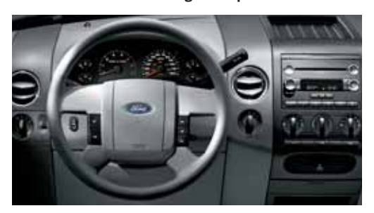
XLT Gauge Group