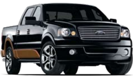
Optional Black/Vintage Copper two-tone