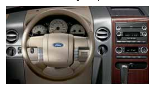
LARIAT Gauge Group