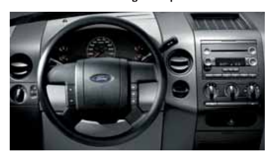
STX Gauge Group