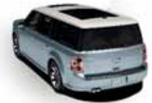
Light Ice Blue Metallic with White Suede roof (SEL and Limited only)