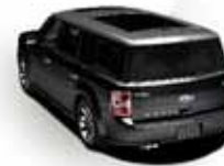
Black with Brilliant Silver Metallic roof (SEL and Limited only)