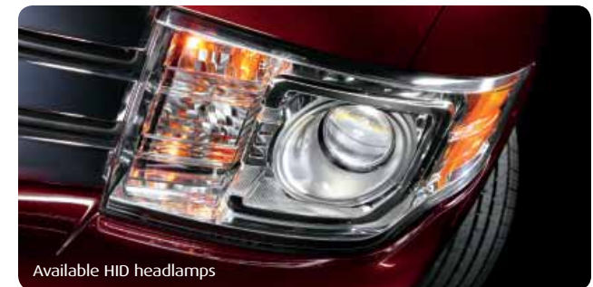
Available HID headlamps