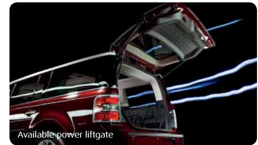
Available power liftgate