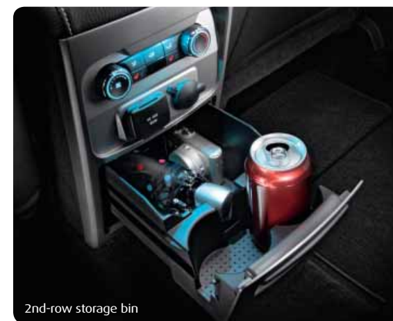
2nd-row storage bin