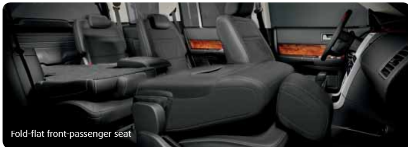
Fold-flat front-passenger seat

Continue building your Flex on the next page.