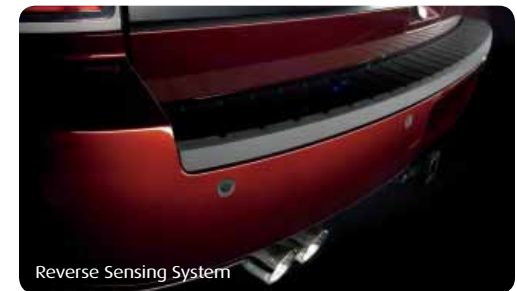
Reverse Sensing System

Continue building your Flex on the next page.