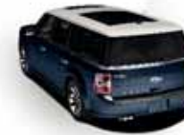
Dark Ink Blue Metallic with White Suede roof (SEL and Limited only)