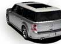
Brilliant Silver Metallic with White Suede roof (SEL and Limited only)