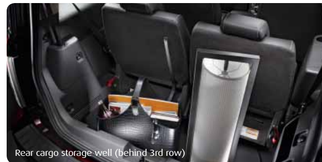
Rear cargo storage well (behind 3rd row)

1st-row center console with armrest, storage, 2 cupholders, and rear pull-out drawer with cupholders and storage for 2nd-row passenger use Accessory delay Air conditioning Auto-dimming rearview mirror Autolock — Power door locks Auxiliary audio input jack Auxiliary rear climate control Carpeted floor mats in 1st and 2nd rows Cupholders/bottle holders (10) Driver and front-passenger sun visors with illuminated vanity mirrors Grab handles — 1st and 2nd rows, retractable Leather-wrapped shifter Map pockets — 1st-row seatbacks Message center with trip computer Overhead console with map lights and sunglasses holder Power points — 12V (4) Power windows with one-touch-up/-down driver-window feature Reading lamps for 2nd- and 3rd-row passengers Steering wheel with cruise and secondary audio controls Tilt-adjustable steering column