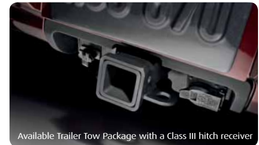
Available Trailer Tow Package with a Class III hitch receiver