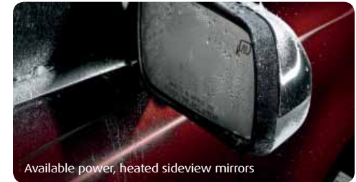
Available power, heated sideview mirrors

19" polished-aluminum wheels with P235/55R19 BSW tires Autolamp with HID headlamps Chrome, power, heated, manually folding sideview mirrors with integrated security approach lamps and memory Power liftgate Satin-aluminum liftgate appliqué LED taillamps Ford SYNC™ voice-activated, in-vehicle communications and entertainment system 6 Color-keyed leather-wrapped steering wheel with wood inlay and cruise and secondary audio controls 1st-row perforated, leather-trimmed bucket seats, including 10-way power driver seat with memory and manual lumbar, and 6-way power passenger seat 2nd-row perforated, leather-trimmed 60/40 split bench seat with folding seatbacks Power-adjustable pedals with memory Ambient Lighting 110V inverter with AC outlet 2nd row removable footrests