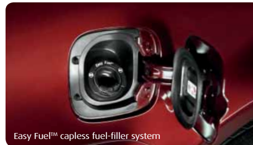
Easy Fuel™ capless fuel-filler system