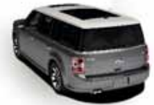
Sterling Grey Metallic with White Suede roof (SEL and Limited only)