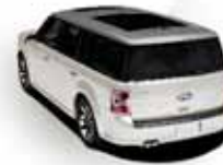
White Suede with Brilliant Silver Metallic roof (SEL and Limited only, SEL shown)