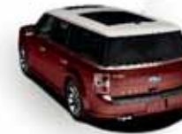
Cinnamon Metallic with White Suede roof (SEL and Limited only)