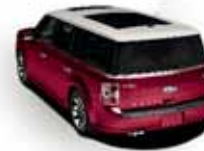
Redfire Metallic with White Suede roof (SEL and Limited only)