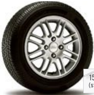
15" Multi-Spoke Alloy Wheels (standard on SES wagon; optional on S and SE; included with optional SE Sport Group)