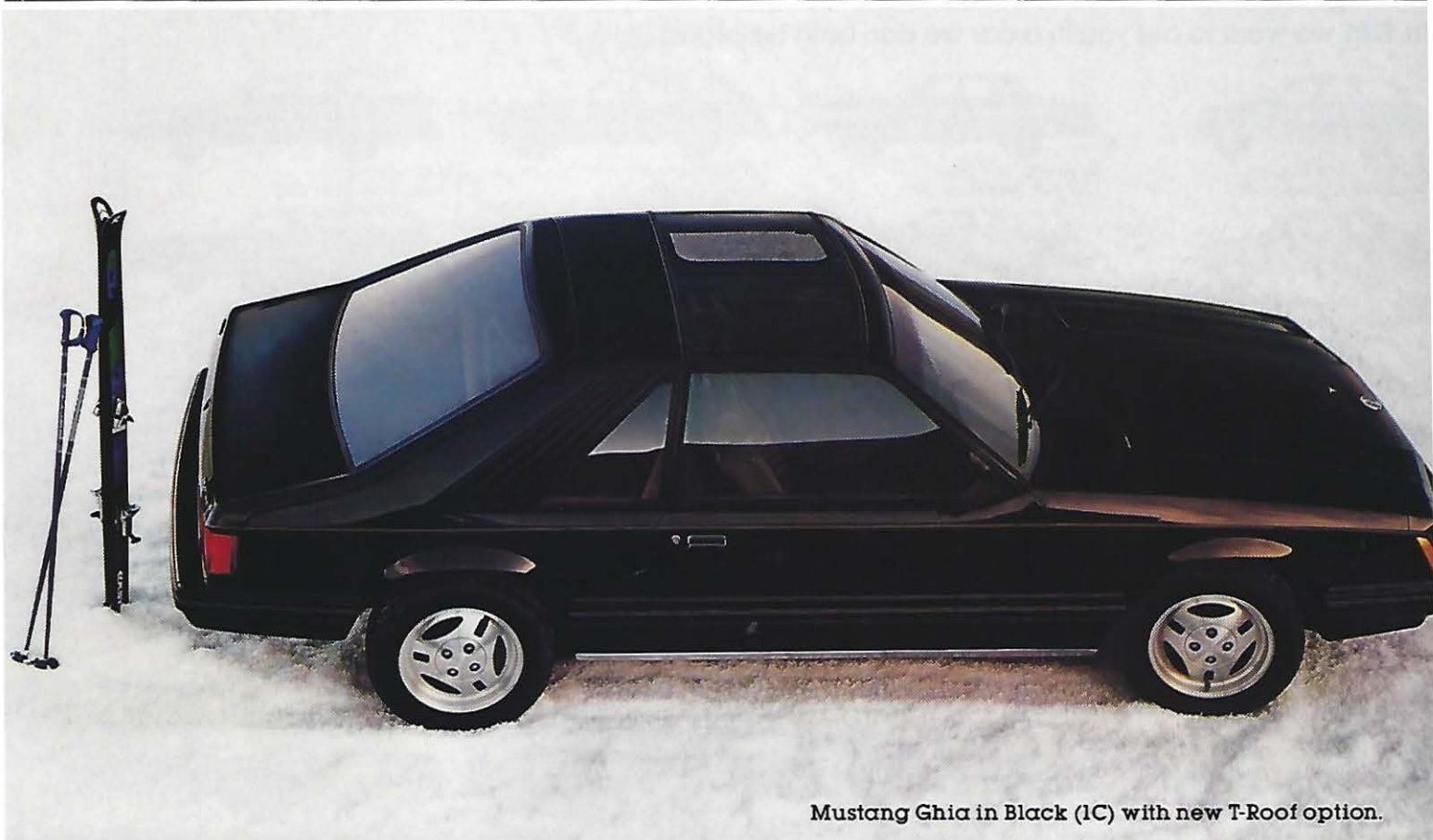
Mustang Ghia in Black (1C) with new T-Roof option.