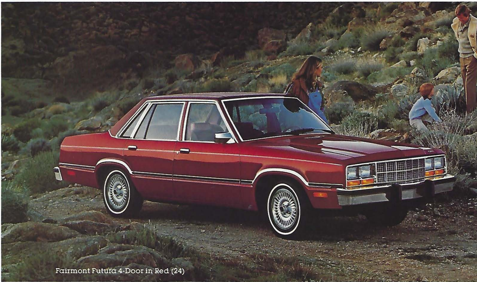
Fairmont Futura 4-Door in Red (24)