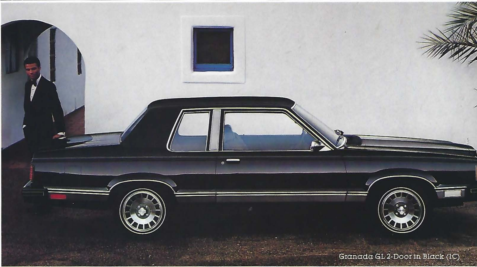
Granada GL 2-Door in Black (1C)