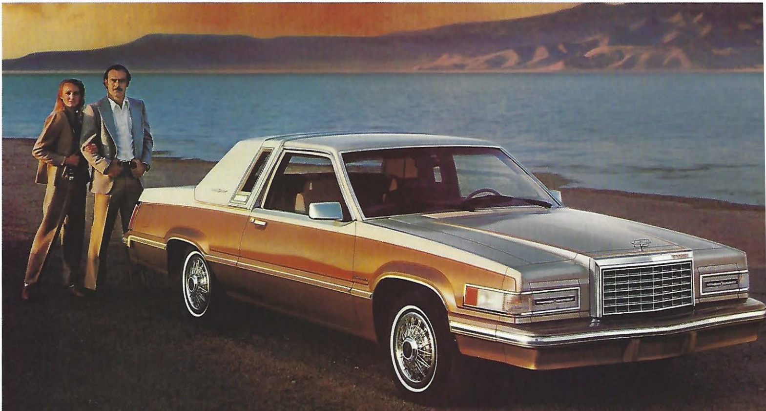
Thunderbird Town Landau in Tu-Tone Fawn (89) over Medium Fawn Glow (55)