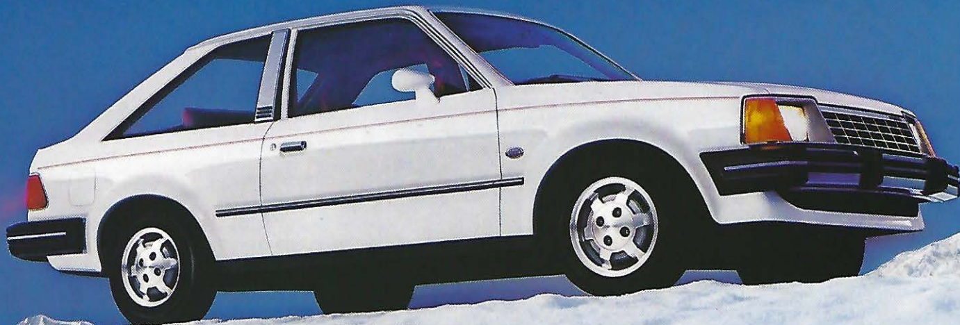
Escort GLX 3-Door Hatchback in Polar White (9D)