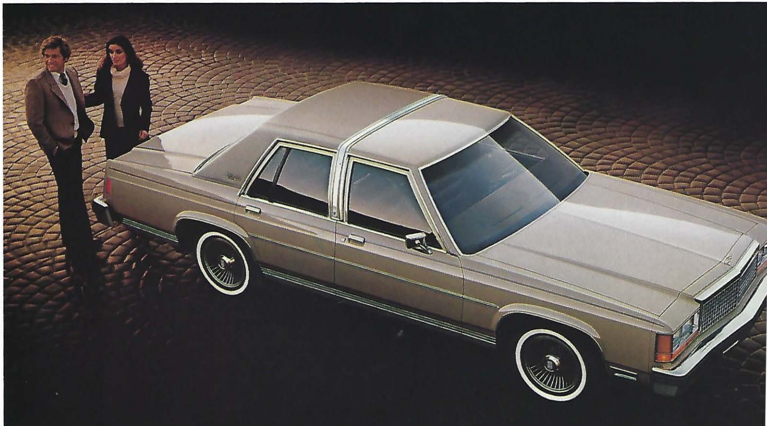
LTD Crown Victoria in Fawn (89) with matching padded rear half vinyl roof