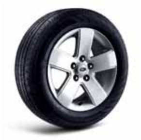
16" Machined-Aluminum Wheel Available on SE