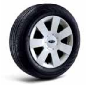
16" Steel Wheel with Deluxe Wheel Cover Standard on S and SE