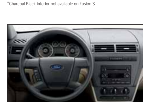
Fusion S Interior shown in Medium Light Stone

Silver Frost Metallic Tungsten Silver Metallic Charcoal Beige Metallic