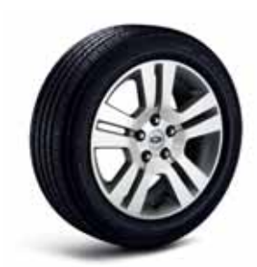
17" Machined-Aluminum Wheel Standard on SEL

Comparisons based on 2005 competitive models (Medium Class with 100-103 cu. ft. passenger volume), publicly available information and Ford certification data at time of publication. Some features discussed may be optional. Vehicles shown may contain optional equipment. Features shown may be offered only in combination with other options or subject to additional ordering requirements or limitations. Certain changes in standard equipment, options and the like, or product delays may have occurred which would not be included in these pages. Your Ford Dealer is the best source for up-to-date information. Ford Division reserves the right to change product specifications at any time without incurring obligations.