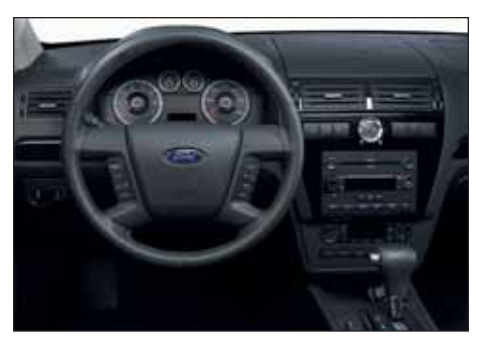
Fusion SEL Interior shown in Charcoal Black