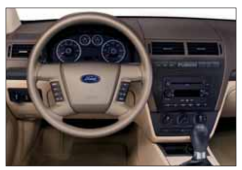
Fusion SE Interior shown in Camel