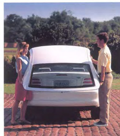
At right: Mustang convertible in Crystal White. It's shown with the optional factory-ordered removable hardtop (see your dealer for availability), which is easy to put on and take off and comes with a rolling stand and storage cover. Some other equipment shown is also optional.

With Mustang for 1994, you can have your hardtop coupe — and your convertible, too.