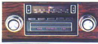
5. AM/FM stereo with search feature