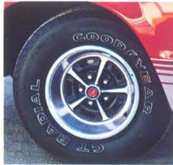
3. Mag 500 chrome wheels