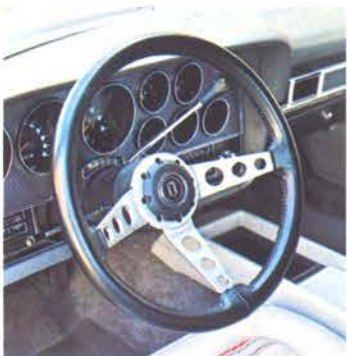
8. Tilt steering wheel