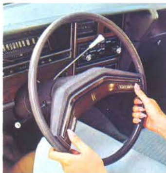
10. Fingertip speed control