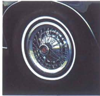
2. Wire wheel covers