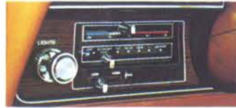
4. SelectAire conditioner