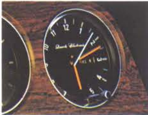
6. Day/date electric clock