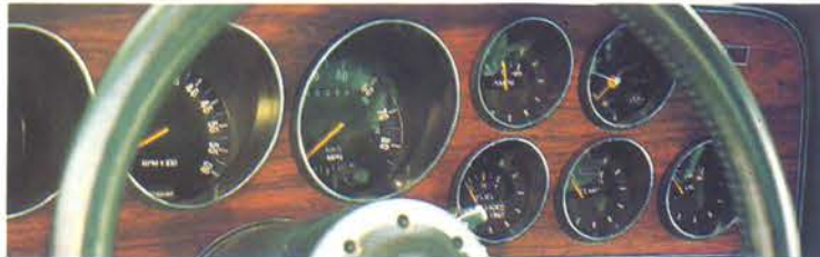
7. Sports instrument panel