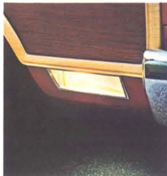
9. Front cornering lamps