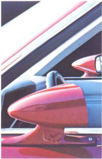
1. Dual sport mirrors